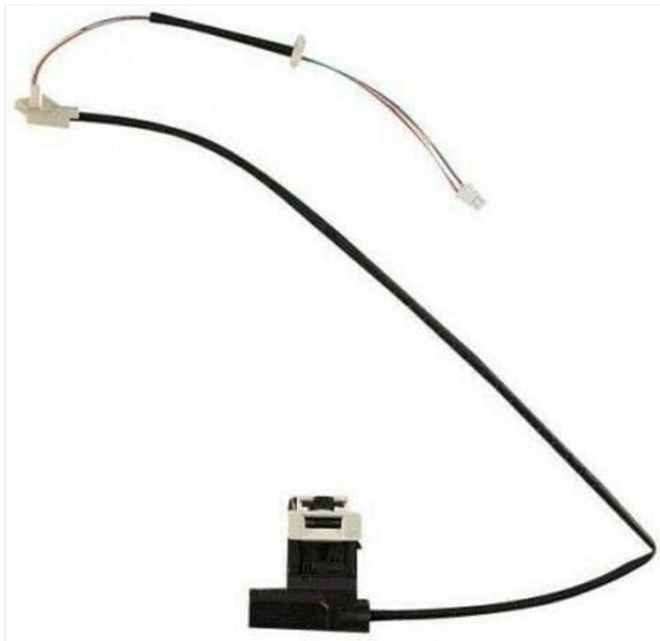
Figure 2: Close-up view of the Delixike Washer Lid Lock Switch, highlighting the electrical connectors and the flexible wiring. This image provides a clearer perspective on the connection points for installation.