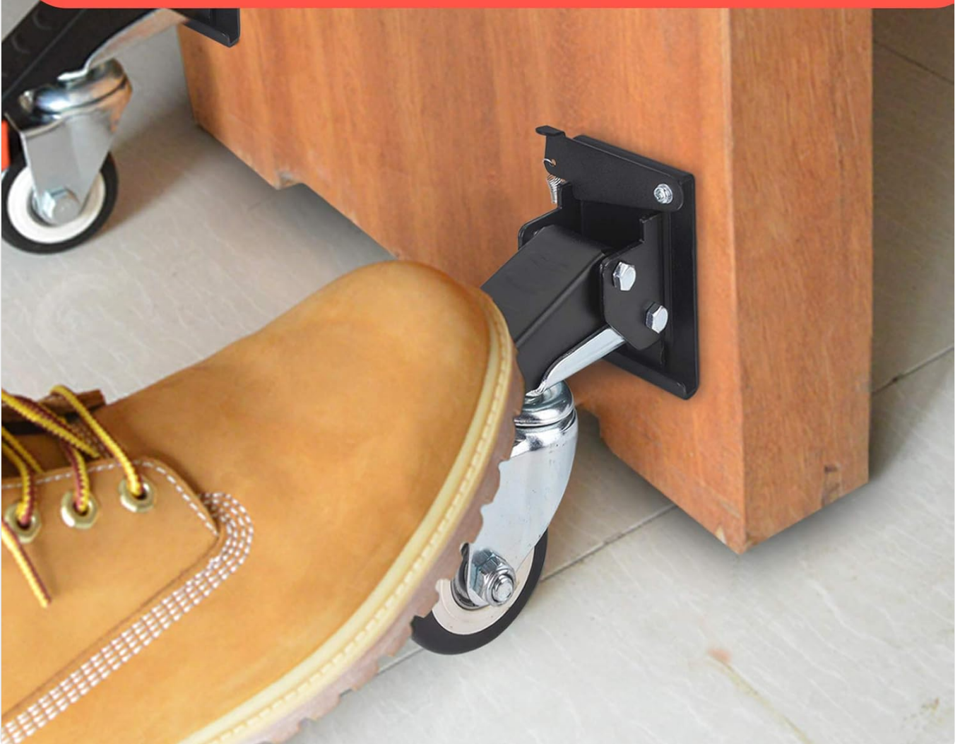
Figure 5: Engaging the Caster