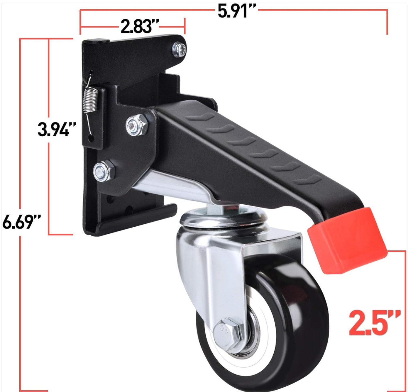
Figure 2: Caster Dimensions