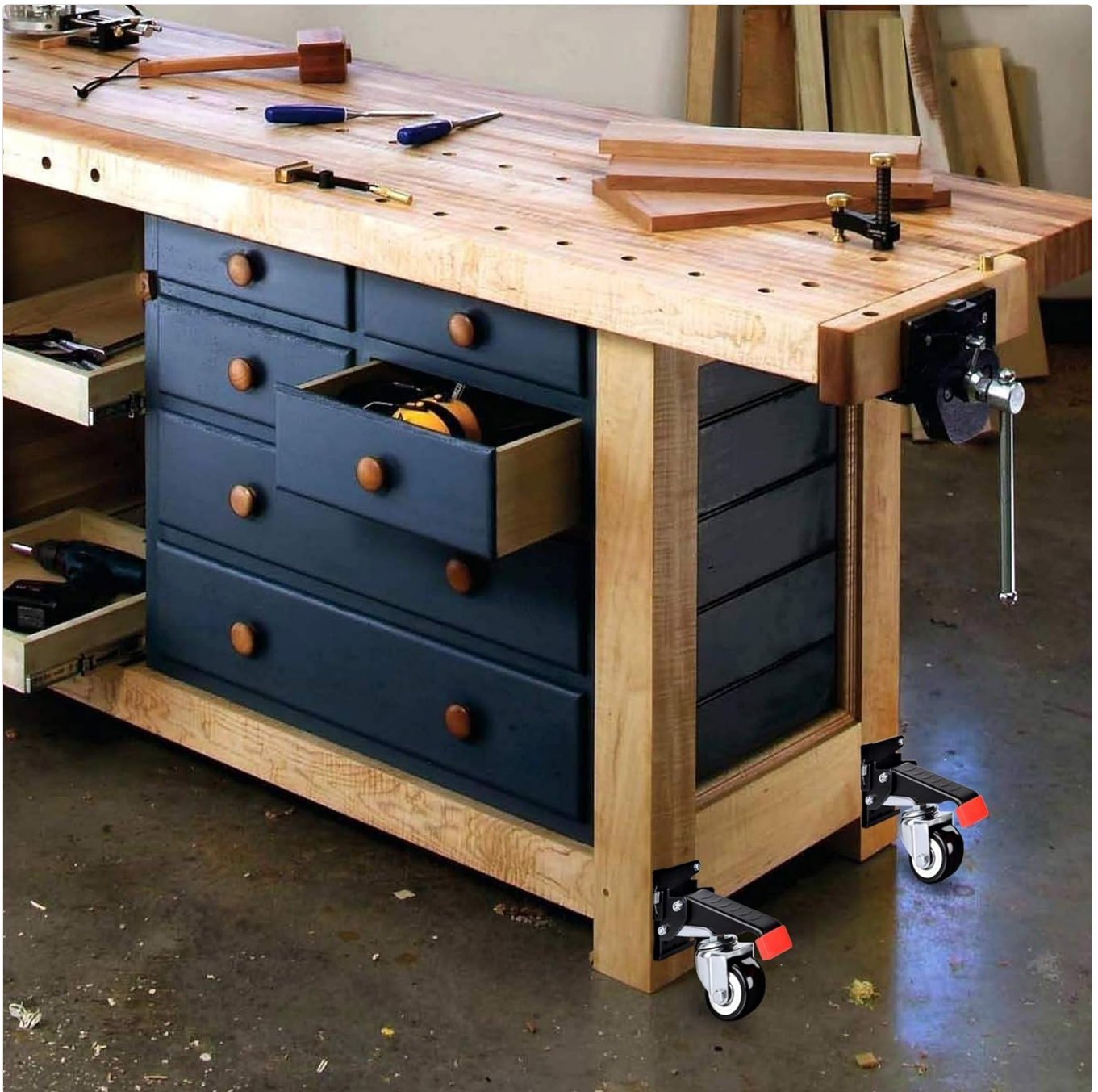
Figure 6: Workbench with Casters Engaged