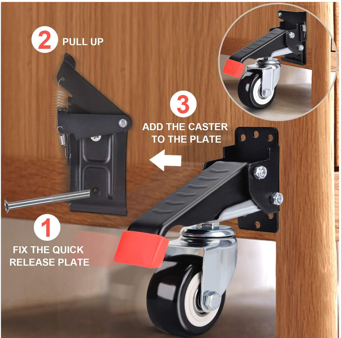
Figure 4: Installation Steps