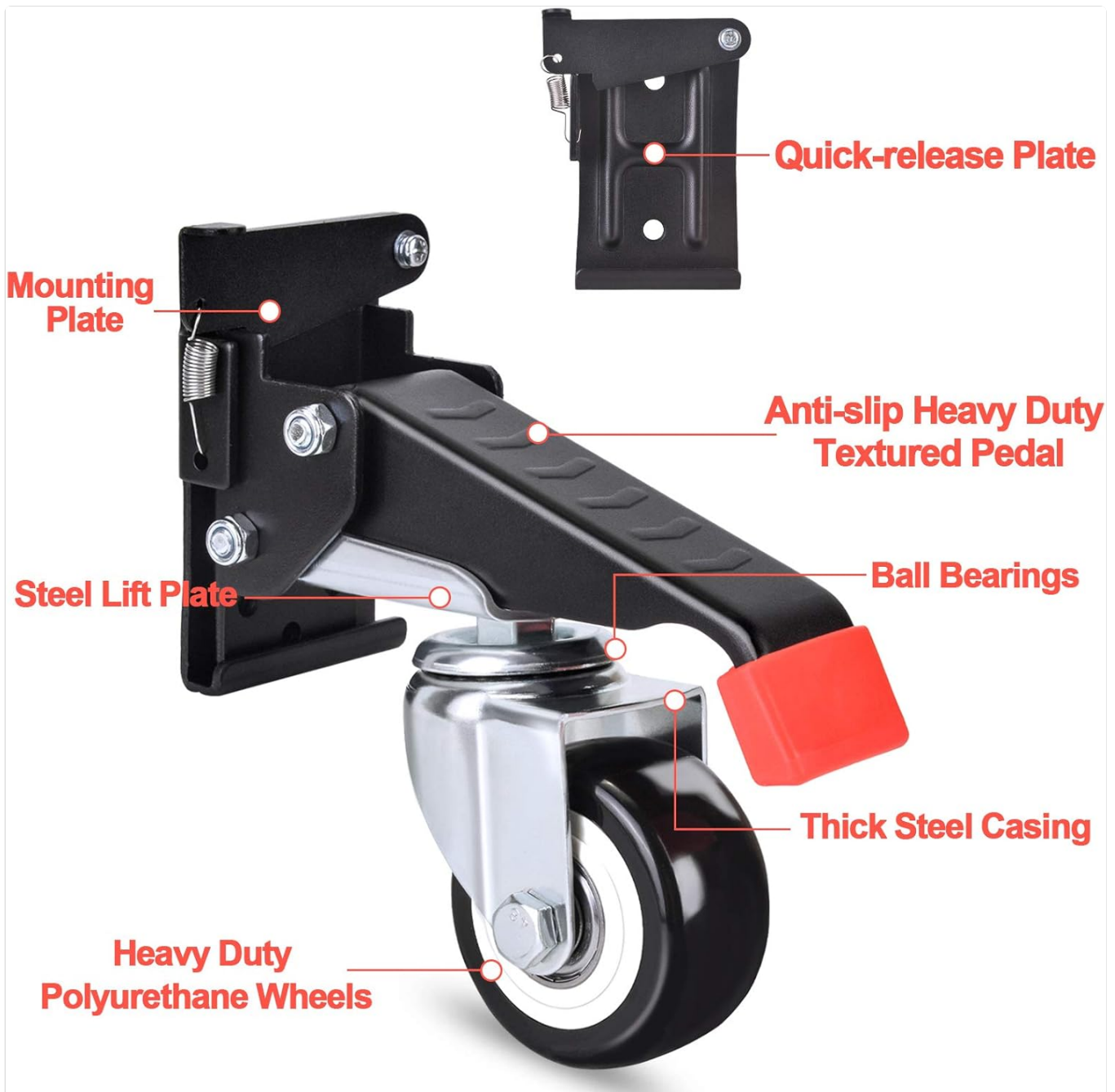
Figure 3: Caster Components