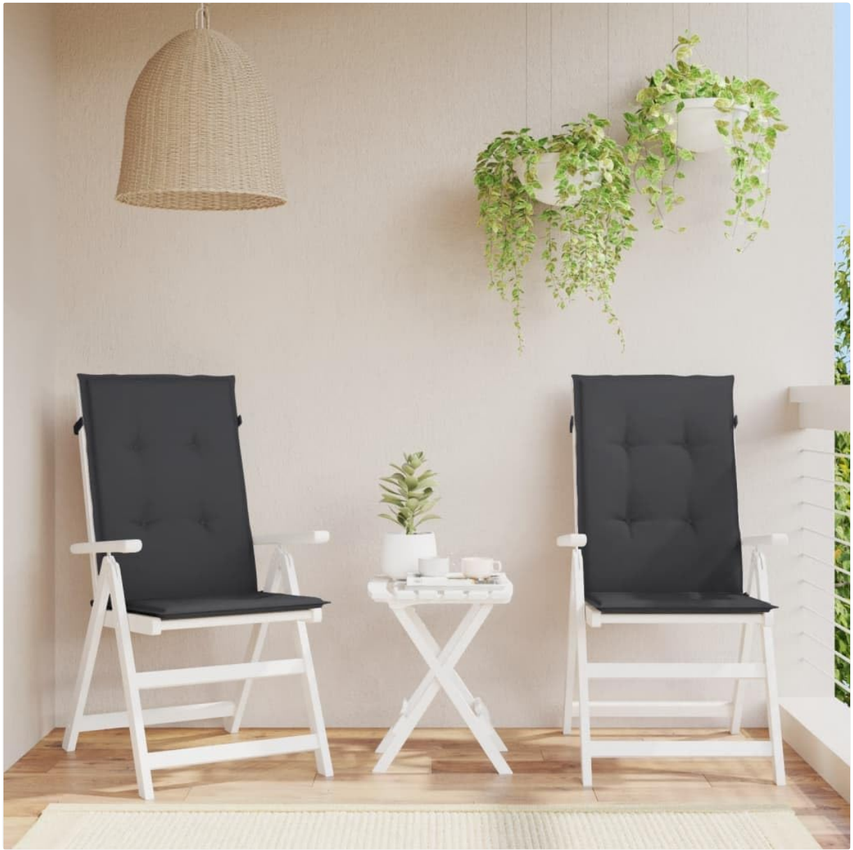
Image 1: vidaXL Black Garden Highback Chair Cushions on outdoor chairs.