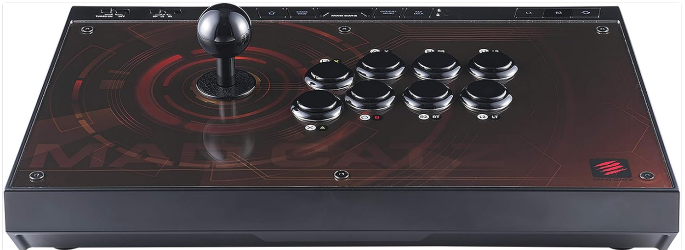
Image: Top-down view of the Mad Catz EGO Arcade Fight Stick, showcasing its joystick and eight action buttons.

This manual provides detailed instructions on setting up, operating, and maintaining your EGO Arcade Fight Stick to ensure optimal performance and longevity.