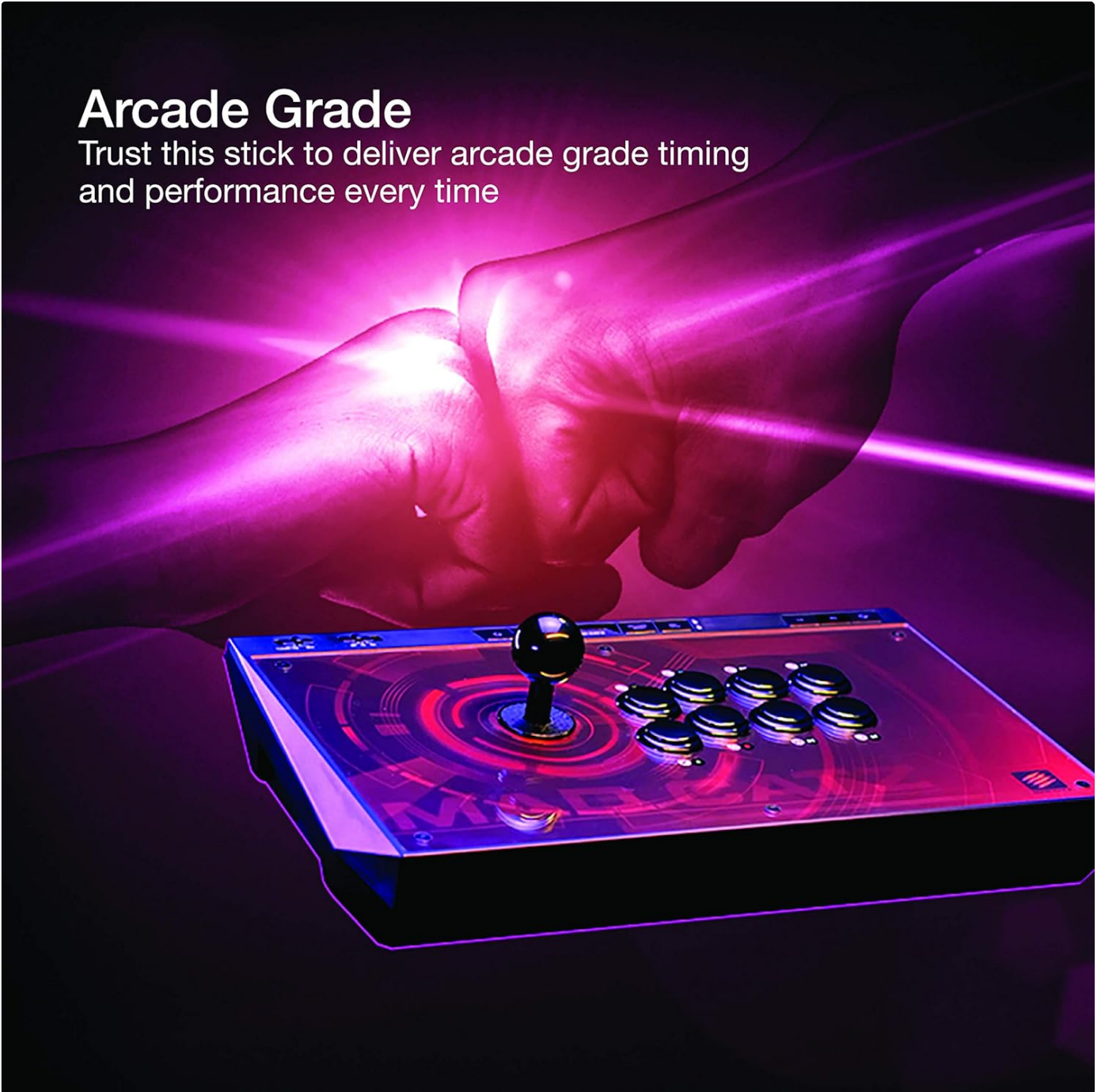
Image: A visual representation of the items included in the EGO Arcade Stick package.

Trust this stick to deliver arcade grade timing and performance every time