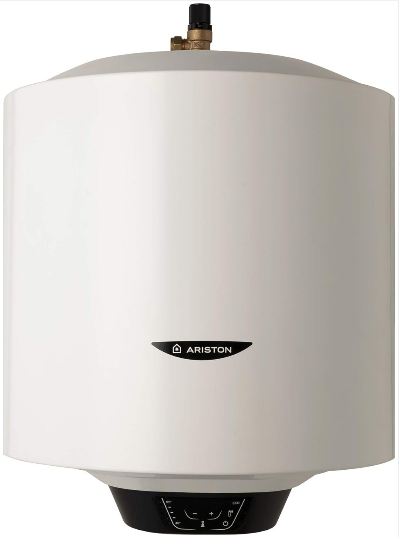
Figure 1: Ariston PRO1 ECO 50 L Electric Storage Water Heater, front view.