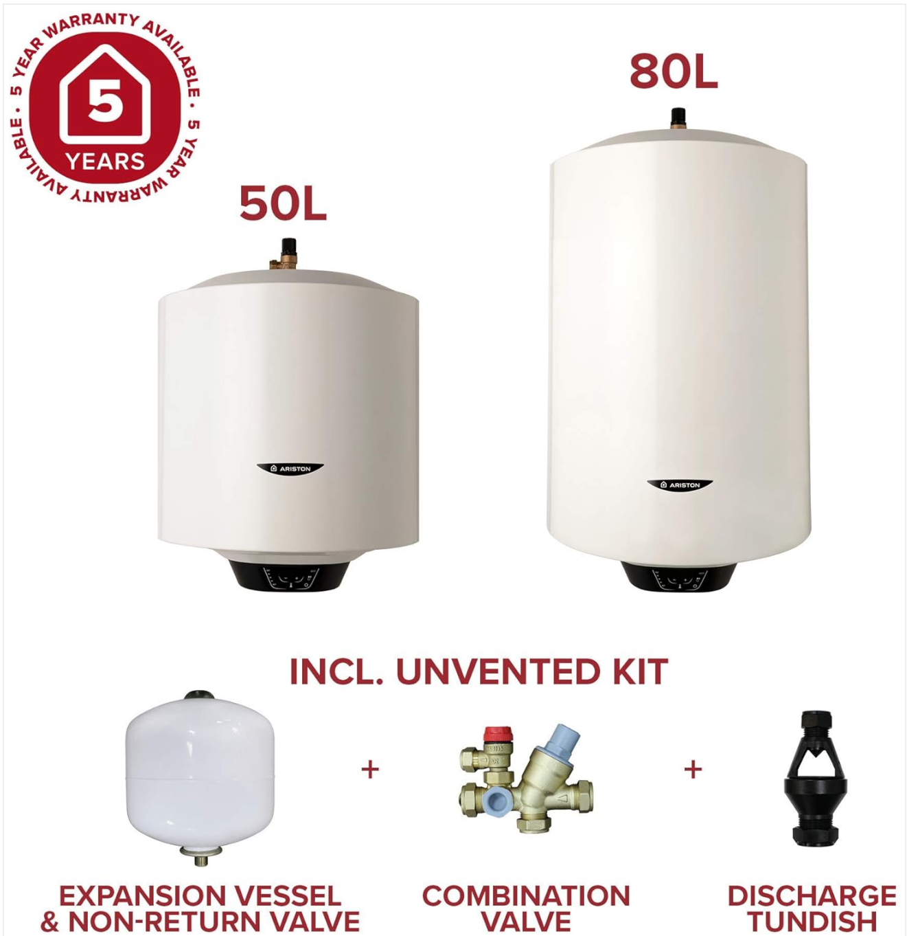
Figure 4: Ariston PRO1 ECO 50L and 80L models shown alongside the included unvented kit components: expansion vessel & non-return valve, combination valve, and discharge tundish.