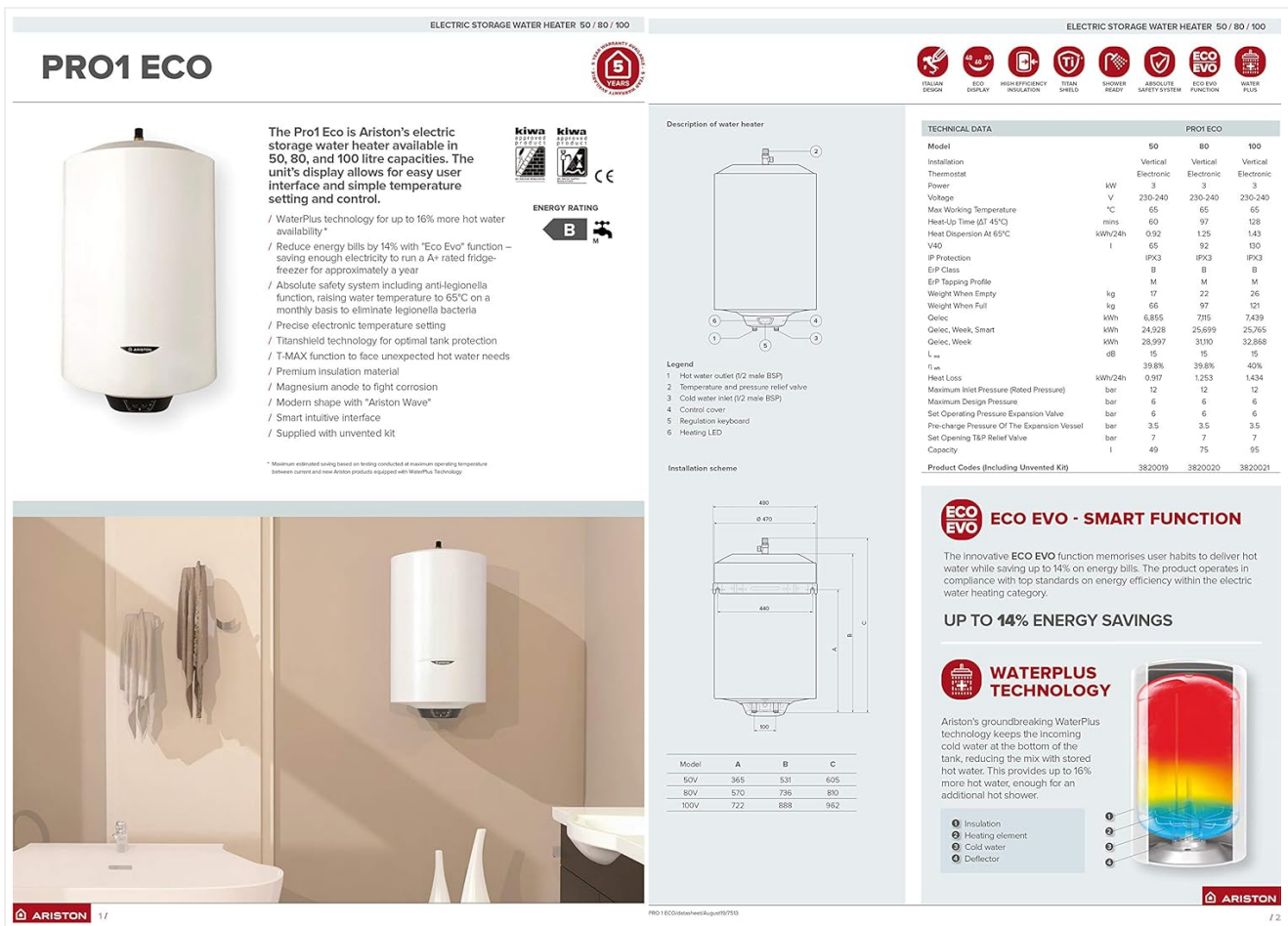
Figure 7: Detailed technical data sheet for Ariston PRO1 ECO electric storage water heaters, including specifications for 50L, 80L, and 100L models.