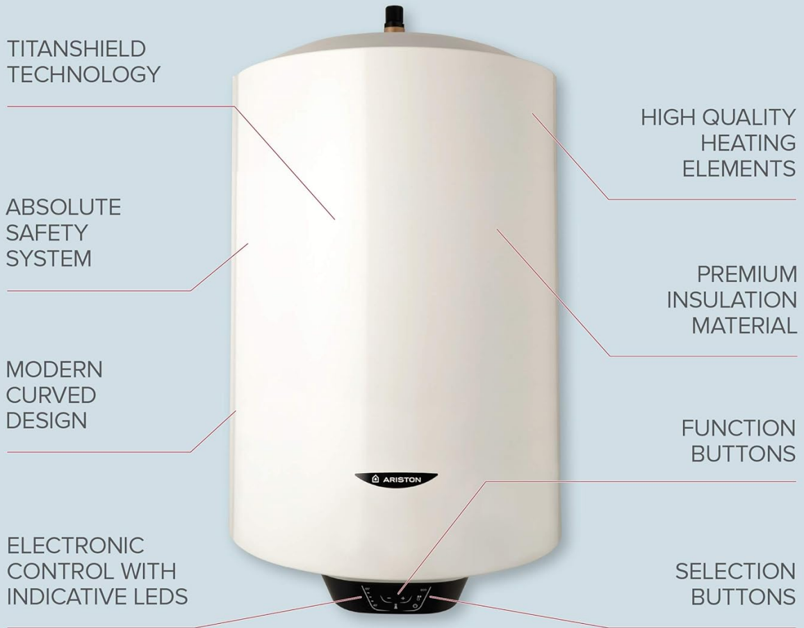
Figure 2: Internal and external features of the PRO1 ECO water heater, including TitanShield Technology, Absolute Safety System, Modern Curved Design, Electronic Control with Indicative LEDs, High Quality Heating Elements, Premium Insulation Material, Function Buttons, and Selection Buttons.