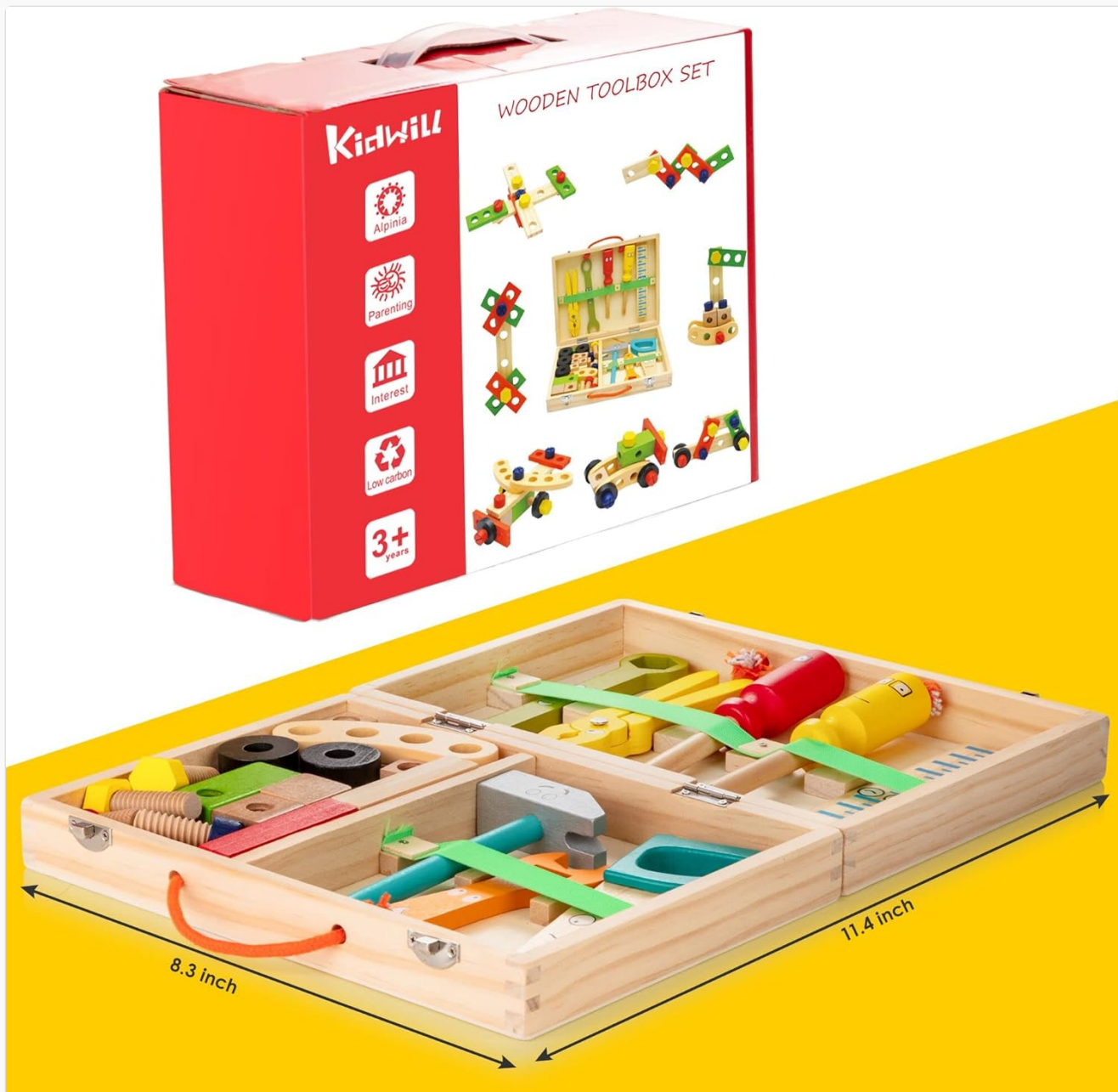
Image: The product packaging for the KIDWILL Wooden Toolbox Set, displaying the product's dimensions and age recommendation.