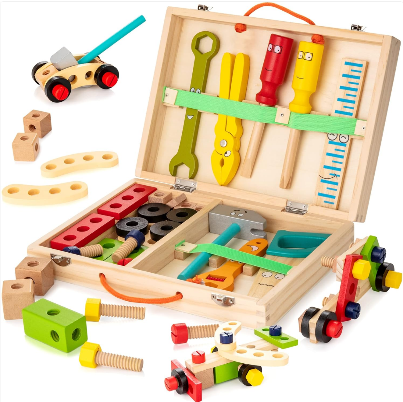
Image: The complete KIDWILL Wooden Toddler Tool Kit, showcasing the open wooden toolbox filled with various colorful wooden tools, nuts, bolts, and construction pieces, alongside several assembled models.