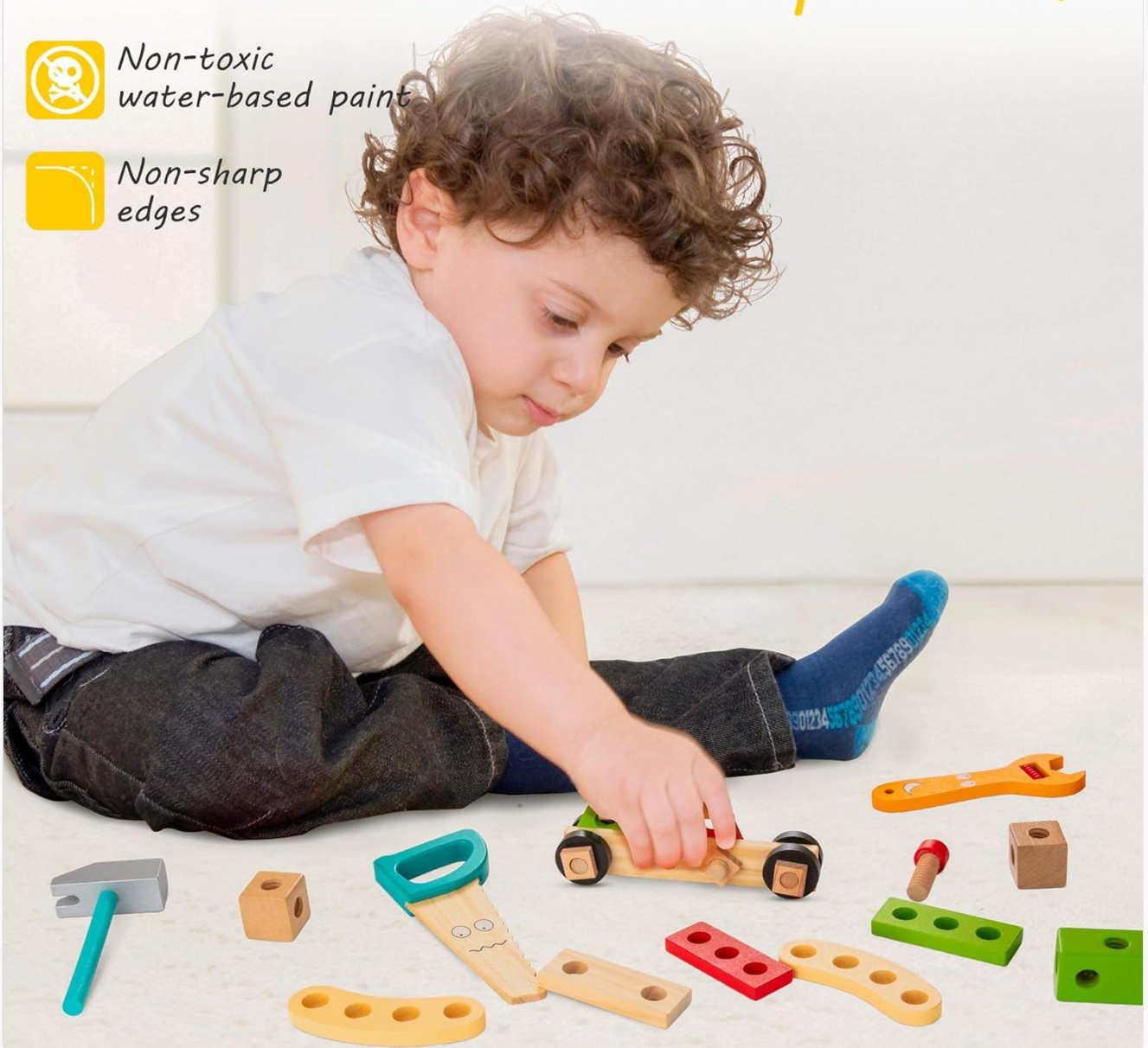
Image: A child engaged in play with the wooden tool kit, illustrating the product's safety features such as non-toxic paint and smooth edges.