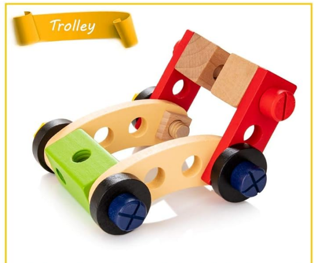
Image: Examples of various models, including a racing car, helicopter, tank, and trolley, that can be constructed using the components of the tool kit.