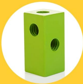
Premium Solid Wood