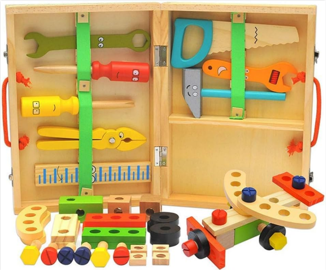
Image: An overhead view of the open wooden toolbox, displaying all the included tools and construction pieces, both within the box compartments and laid out around it.