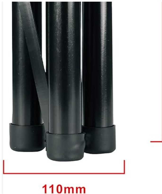
Figure 8.1: Key dimensions of the CONPEX fr-20 Tripod Stand.