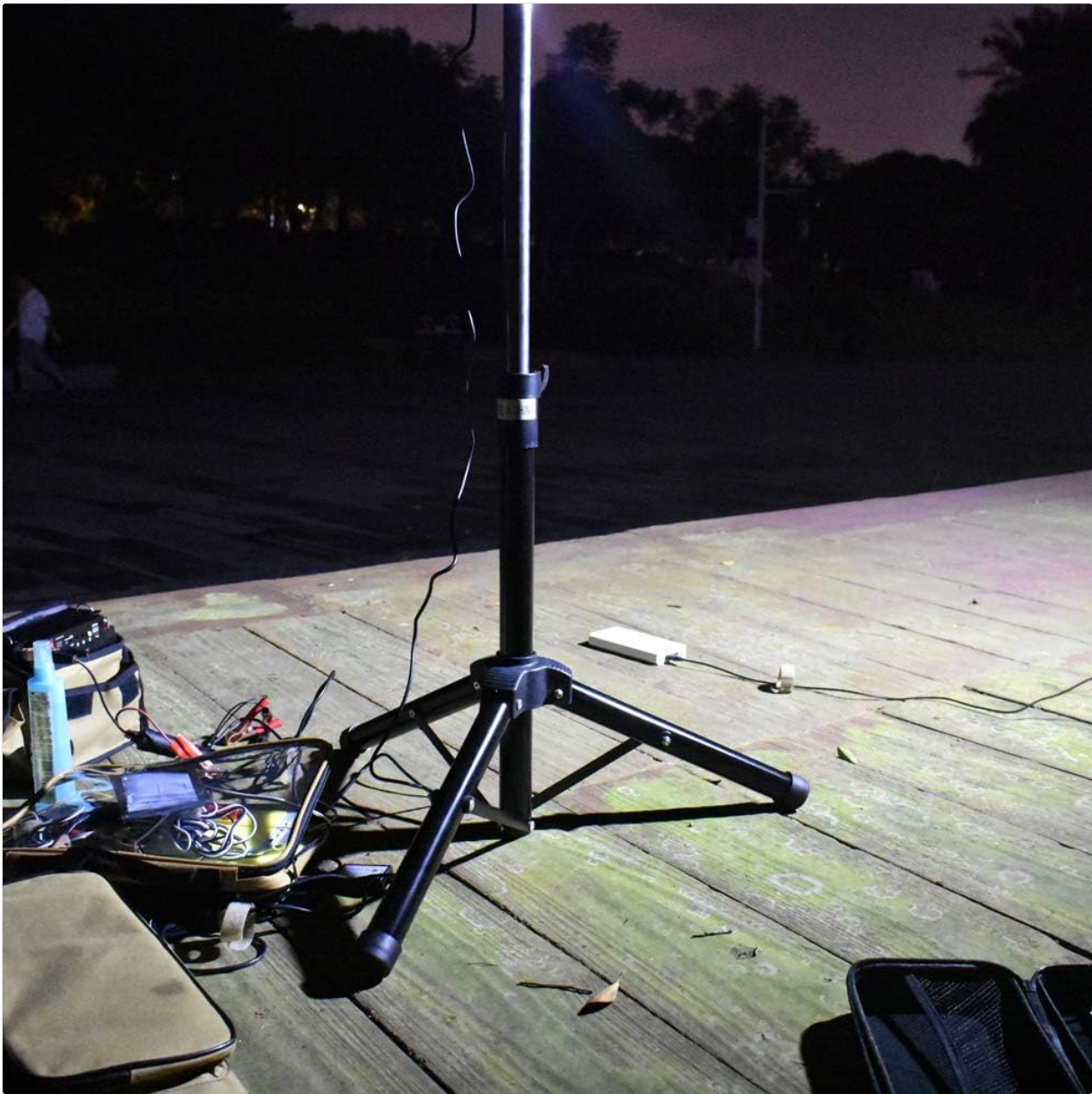
Figure 5.2: Example of the tripod in use with an LED light at night.