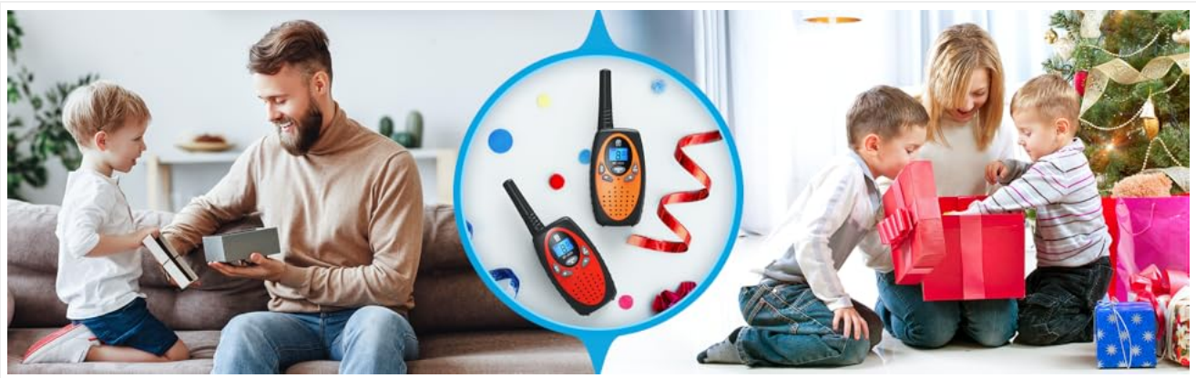
Image: Graphic illustrating the long-range capability of the MTM Walkie Talkies.

The MTM Walkie Talkies XF-638 offer a communication range of up to 3 miles in open fields. The actual range can vary significantly based on terrain, weather conditions, and obstructions.