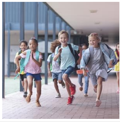
Children playing outdoors with walkie talkies.