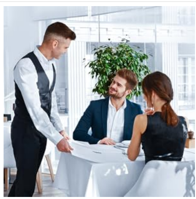
Restaurant staff using walkie talkies for coordination.