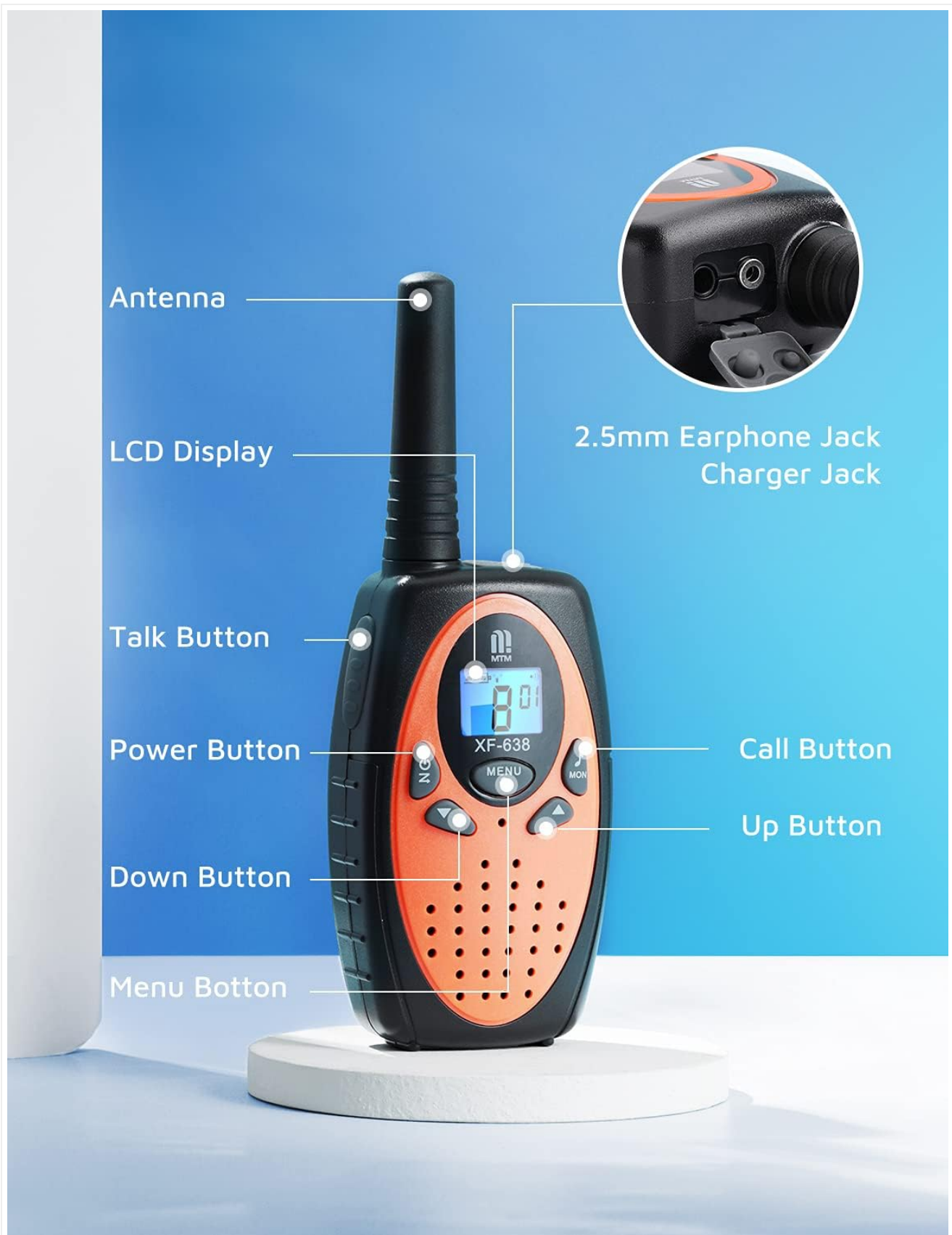
Image: Diagram illustrating the various parts and buttons of the MTM Walkie Talkie XF-638.