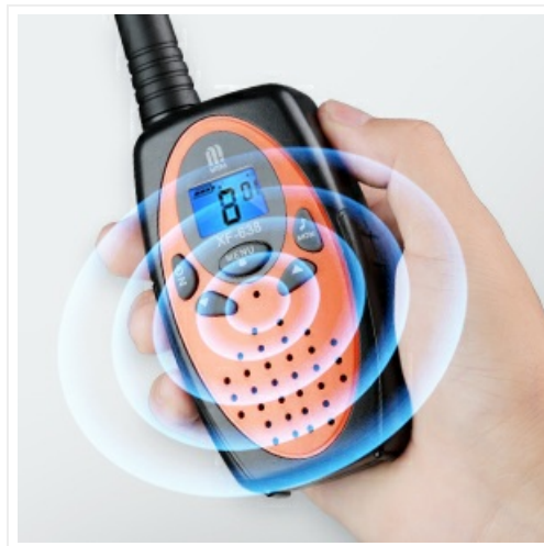
Image: Close-up of the walkie talkie's speaker area, indicating adjustable volume levels.