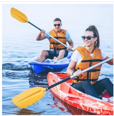
Adults using walkie talkies while kayaking.