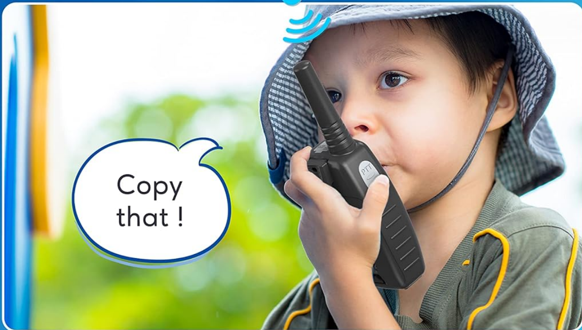
Image: MTM Walkie Talkies XF-638 4-pack in orange color, ready for use.