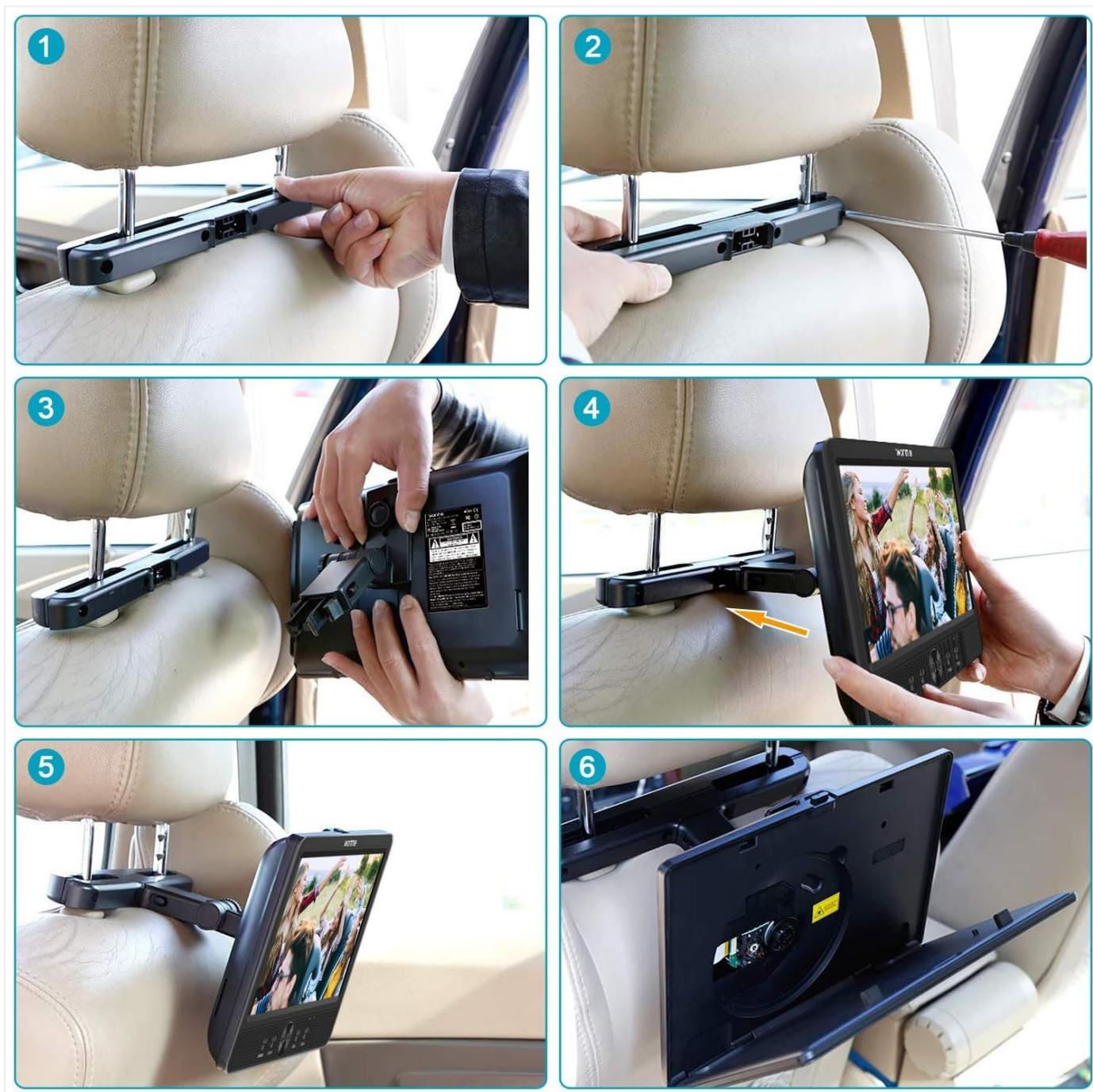
Figure 3: Step-by-step guide on how to install the DVD player using the car headrest mounting bracket. This includes attaching the bracket, securing it, sliding the player into position, and adjusting the screen.