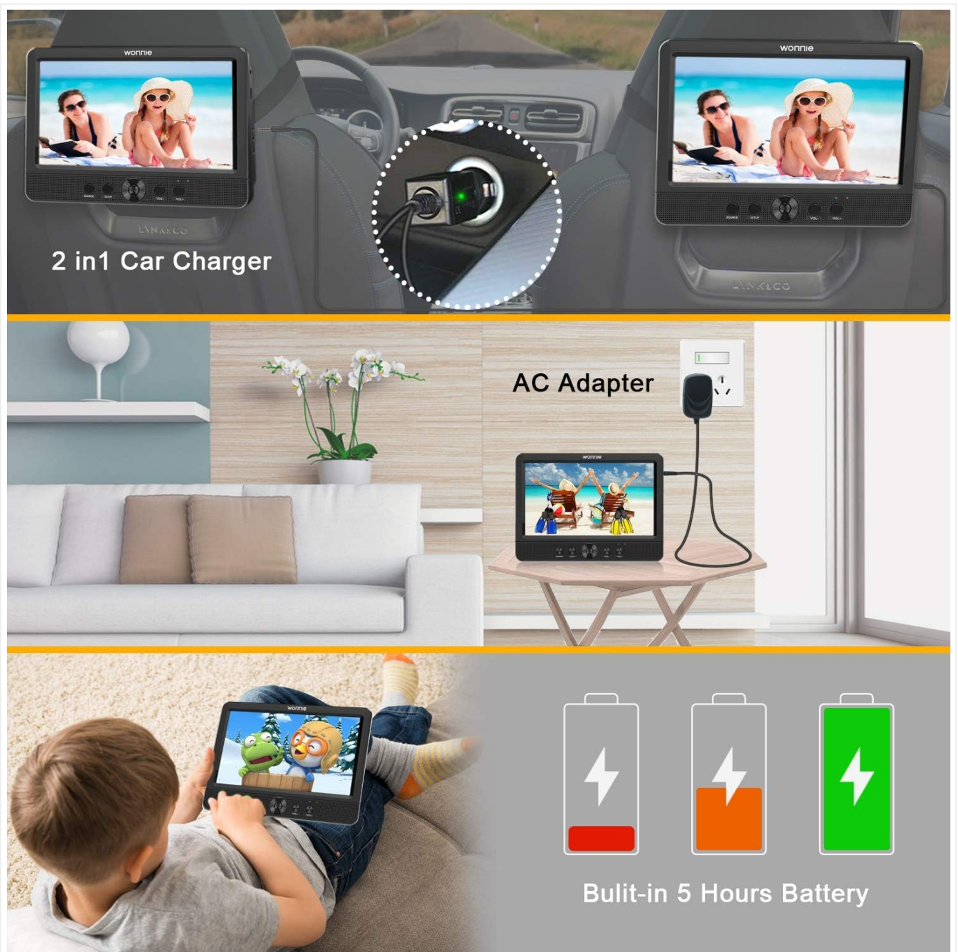
Figure 2: Demonstrates various power options for the DVD players, including the 2-in-1 car charger, AC adapter for home use, and the built-in rechargeable battery with an indicator showing charge levels.