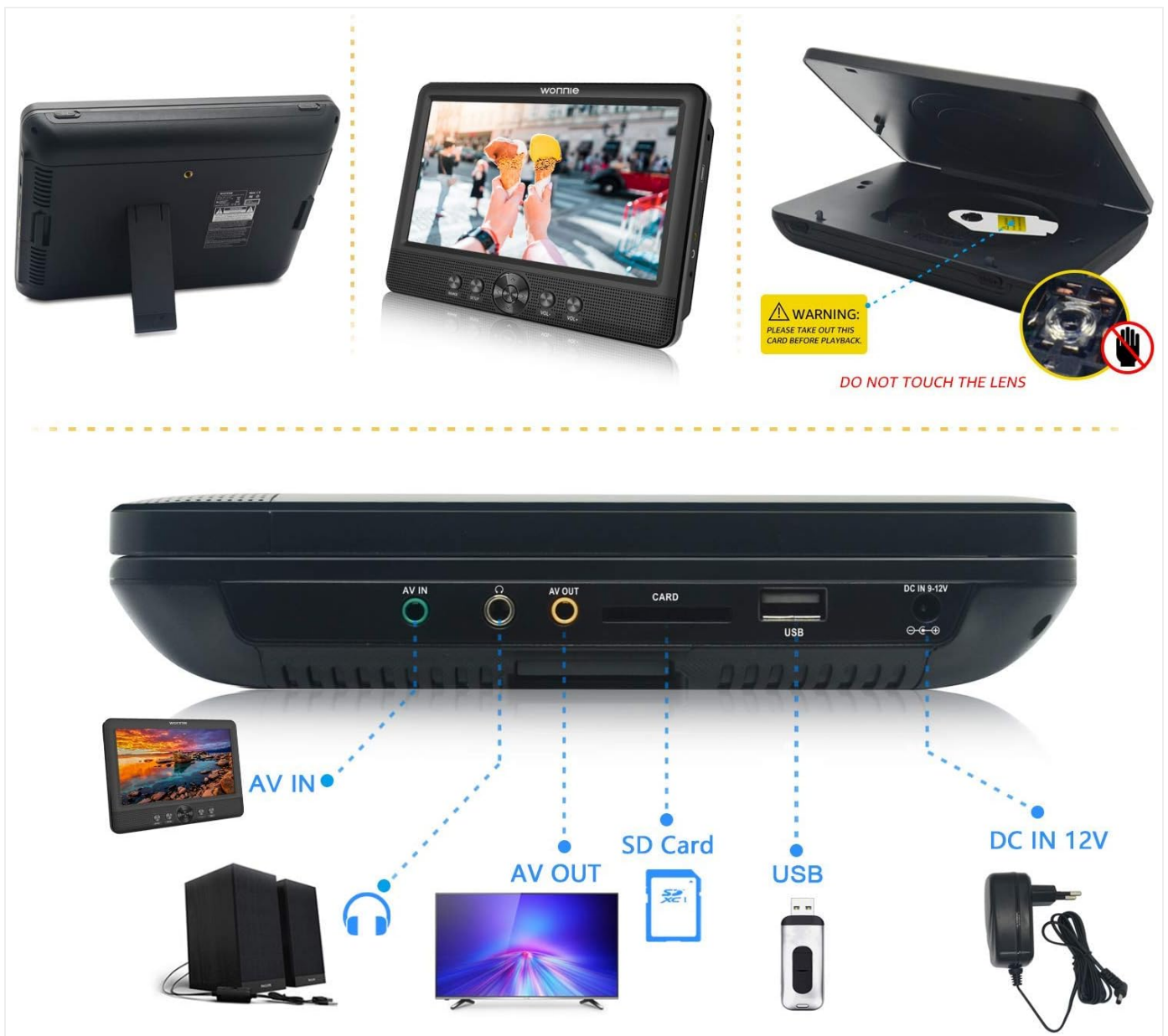
Figure 6: Detailed view of the various ports on the WONNIE DVD player, including AV IN, AV OUT, headphone jack, SD card slot, USB port, and DC IN 9-12V power input. Illustrations show how these ports connect to external devices like speakers, TVs, and storage devices.