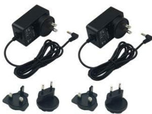
Two AC Adapter