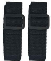
Two Headrest Straps