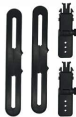
Car Mounting Brackets