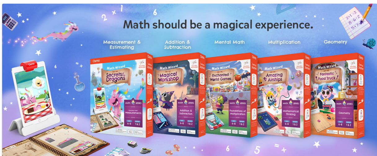
Image: The Osmo Math Wizard game combines digital gameplay with physical pieces for an engaging learning experience.

The Osmo Math Wizard and the Magical Workshop is an interactive learning game designed to teach addition and subtraction to children aged 6-8 (Grades 1-2). This system combines physical game pieces with digital gameplay on an iPad or Fire Tablet, providing a hands-on approach to mathematical concepts. The game offers real-time feedback and adapts to the child's pace, fostering confidence in a stress-free environment. An Osmo Base and a compatible iPad or Fire Tablet are required for gameplay and are sold separately.