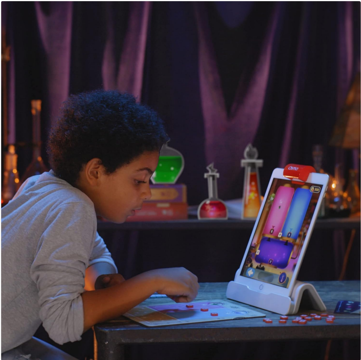
Image: A child interacting with the Osmo Math Wizard game, using physical pieces to solve on-screen challenges.

Your browser does not support the video tag.