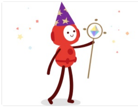
Image: Focus on addition and subtraction skills.