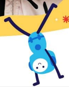
Image: The Osmo Math Wizard game allows children to learn at their own pace.