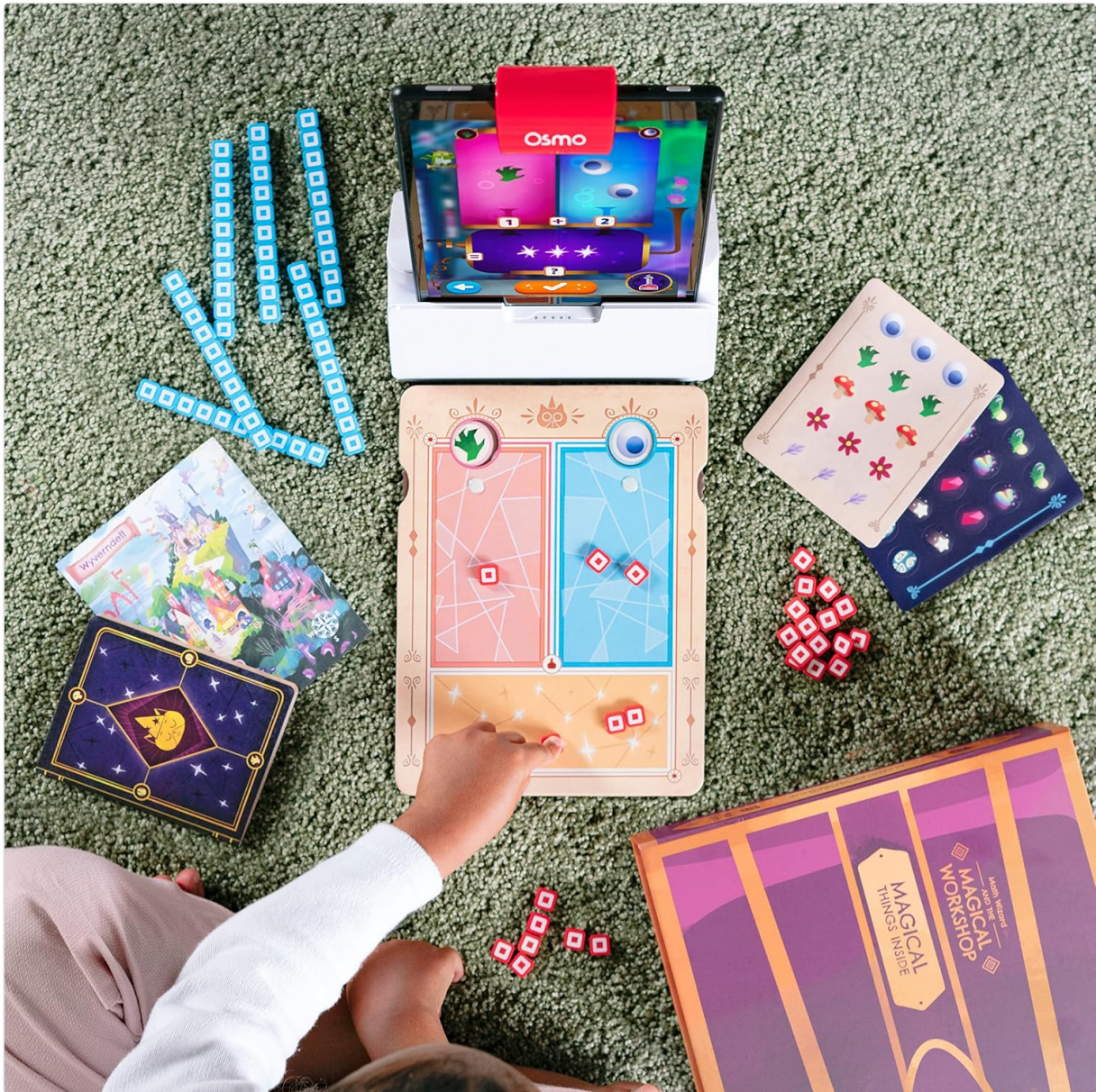
Image: All physical components included in the Osmo Math Wizard and the Magical Workshop set.