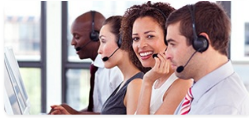
Image: A team of customer support representatives wearing headsets, ready to assist with product inquiries.

You can visit the LOVENSE Official Store on Amazon for more information and support.