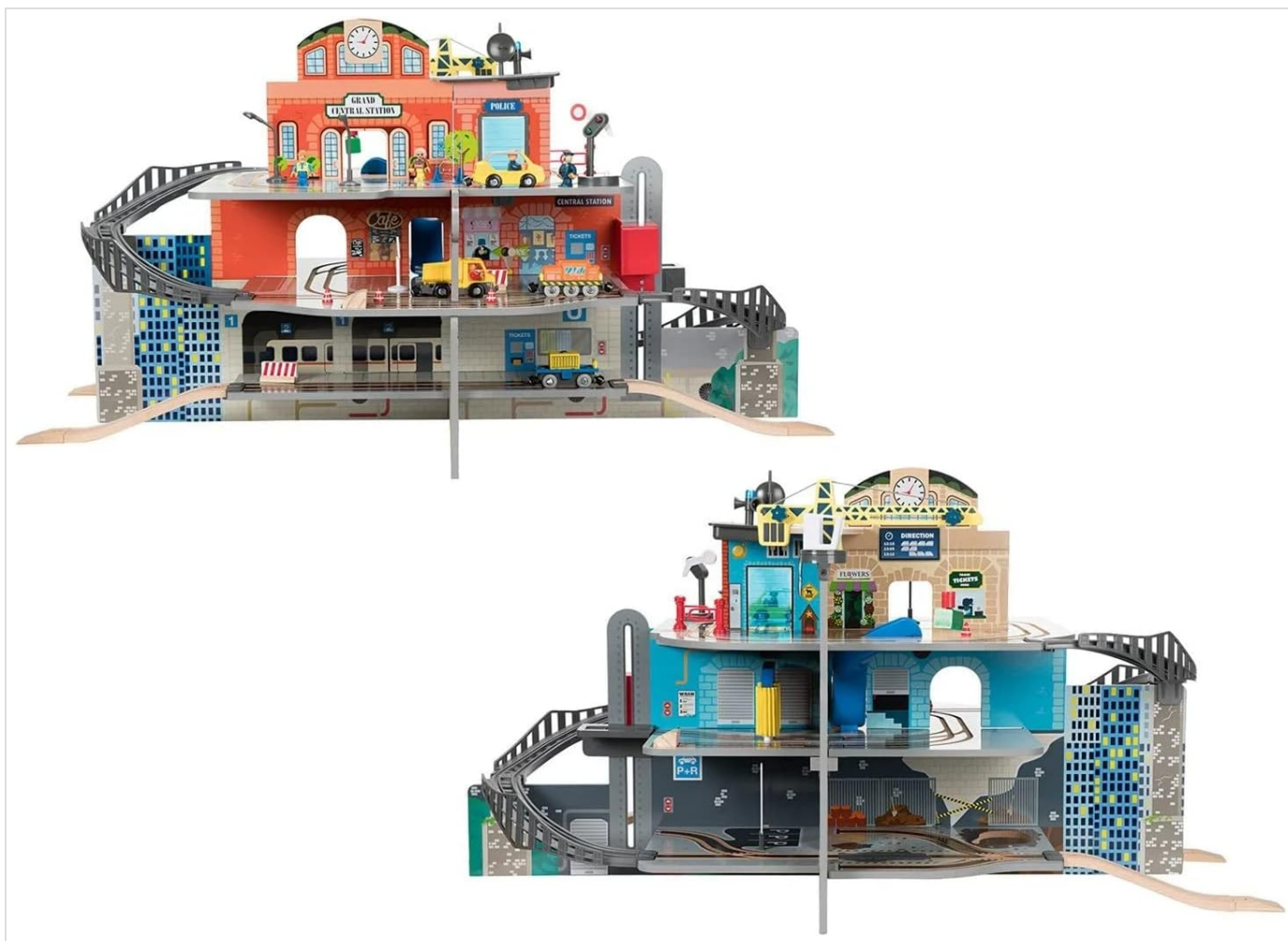
Image: The Playtive XXL Main Station Set, showcasing its three levels of play, including the main station building, tracks, and various interactive elements like a crane and police station.