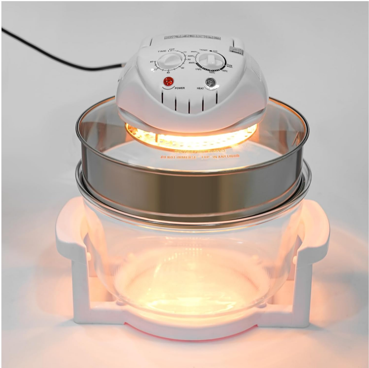
Image: The air fryer in operation, with the heating element visibly glowing, indicating the unit is actively cooking.