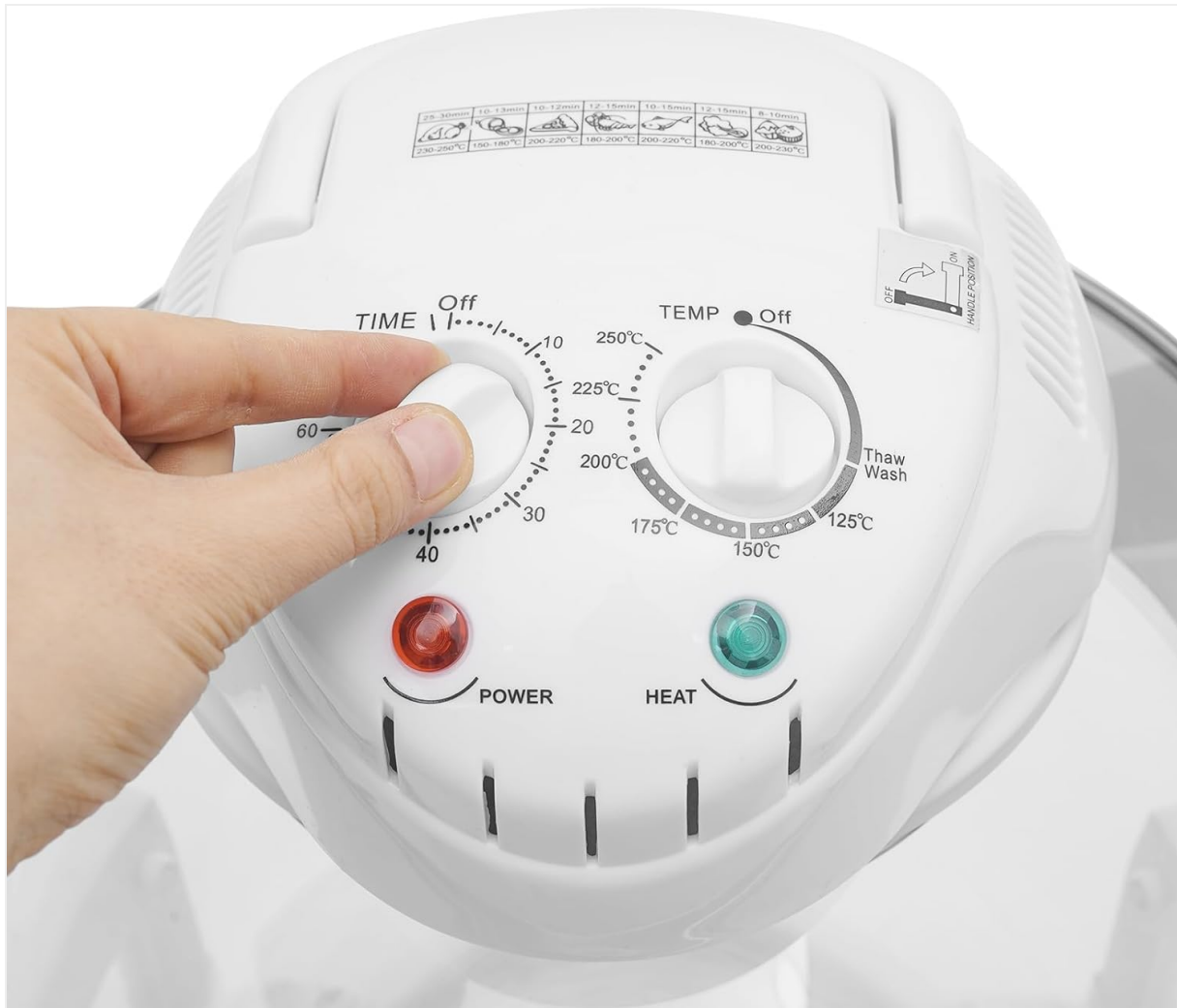
Image: A close-up of the control panel, illustrating the mechanical timer and temperature knobs. The timer knob is being turned by a hand.

The TBVECHI Air Fryer Convection Oven features simple knob controls for temperature and time settings.