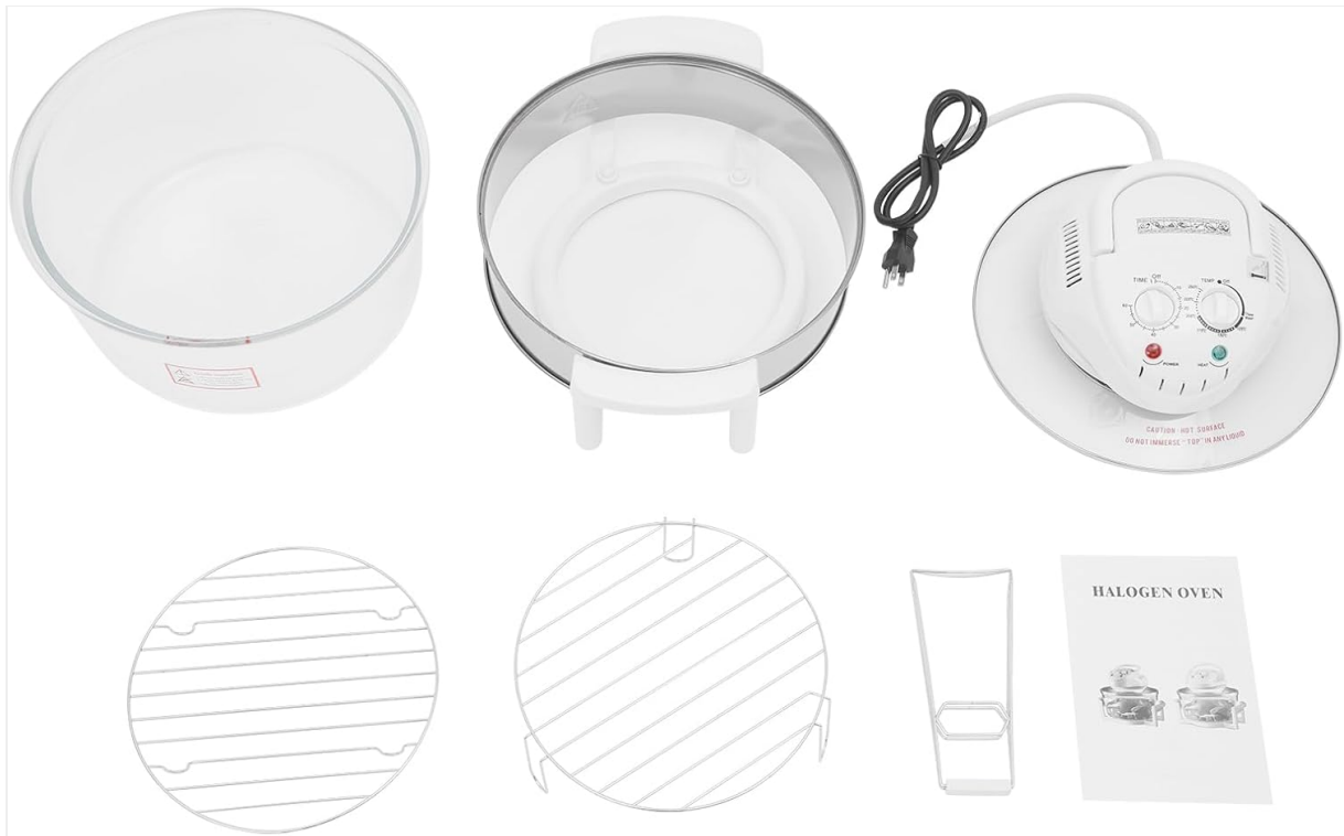
Image: An exploded view showing all included components: the main glass bowl, the top heating and control unit, power cord, two different grill racks, a steam rack, and a food clip.