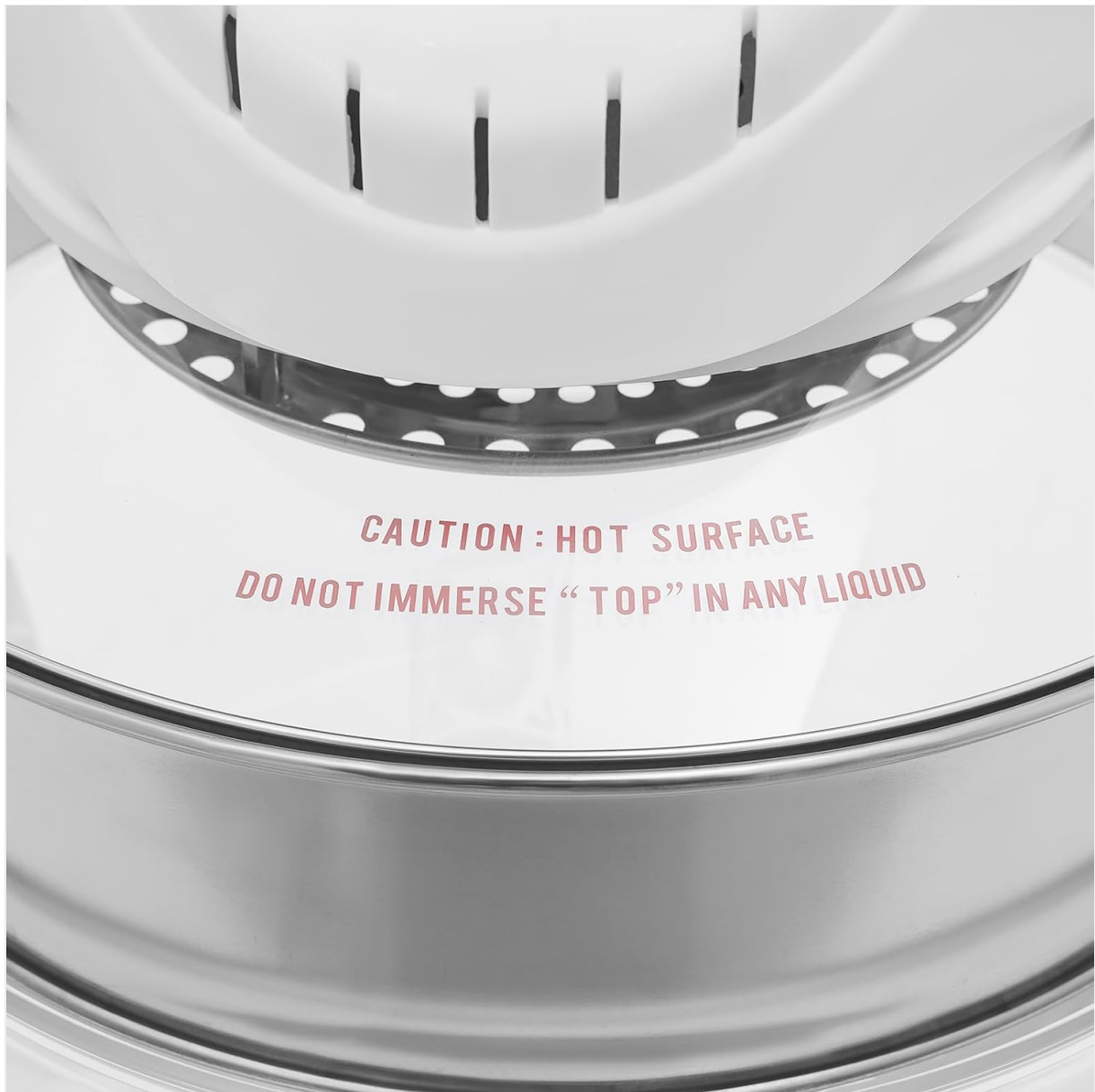
Image: A close-up view of the control unit, highlighting the important safety warning regarding hot surfaces and not immersing the top unit in liquid.