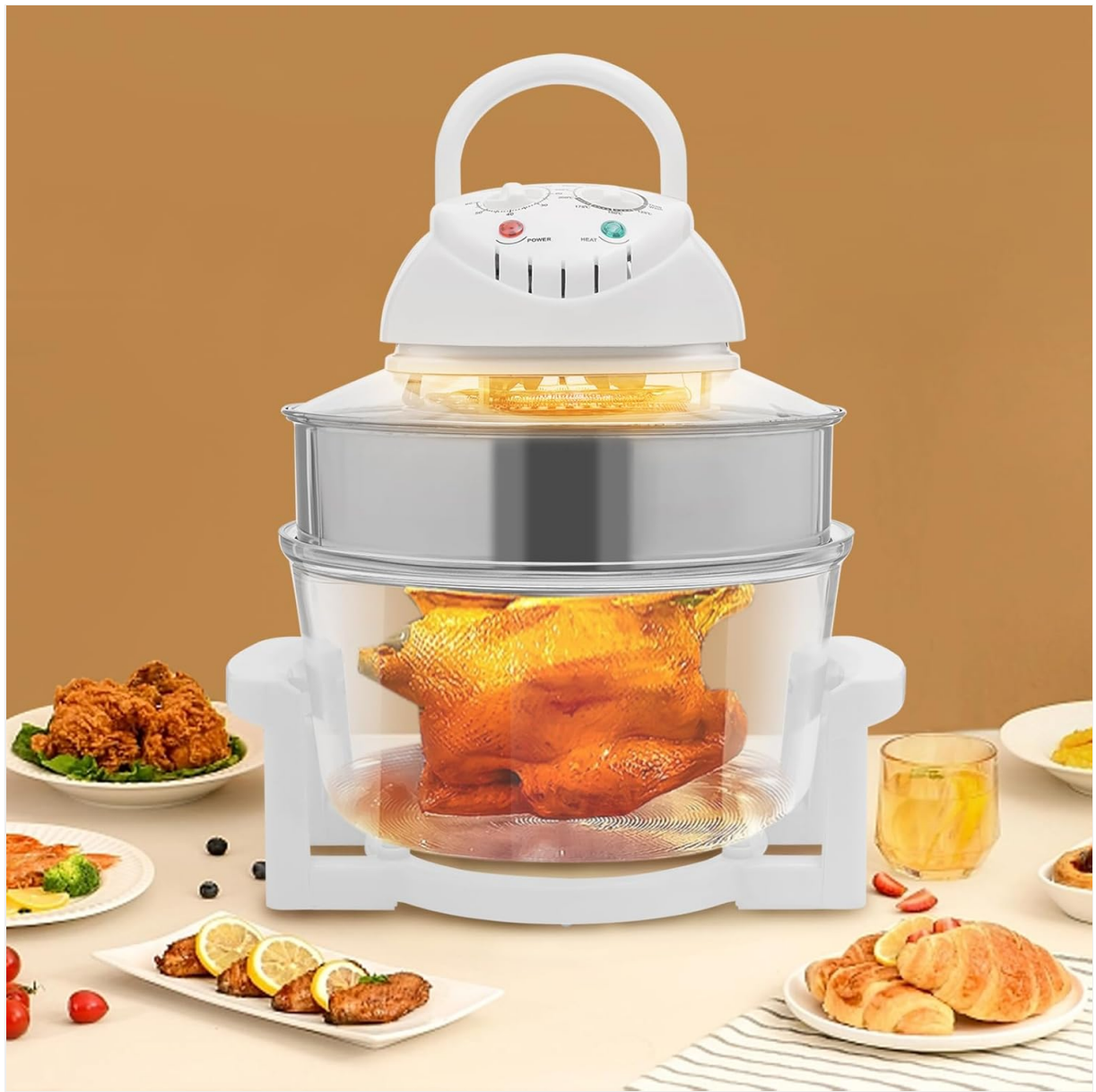
Image: The air fryer actively cooking a whole chicken, demonstrating its capacity and the visibility through the glass bowl. Various prepared dishes are arranged around the unit.