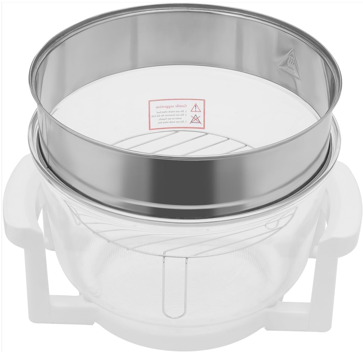
Image: The air fryer assembled with the expansion ring, demonstrating how it increases the cooking volume for larger items.