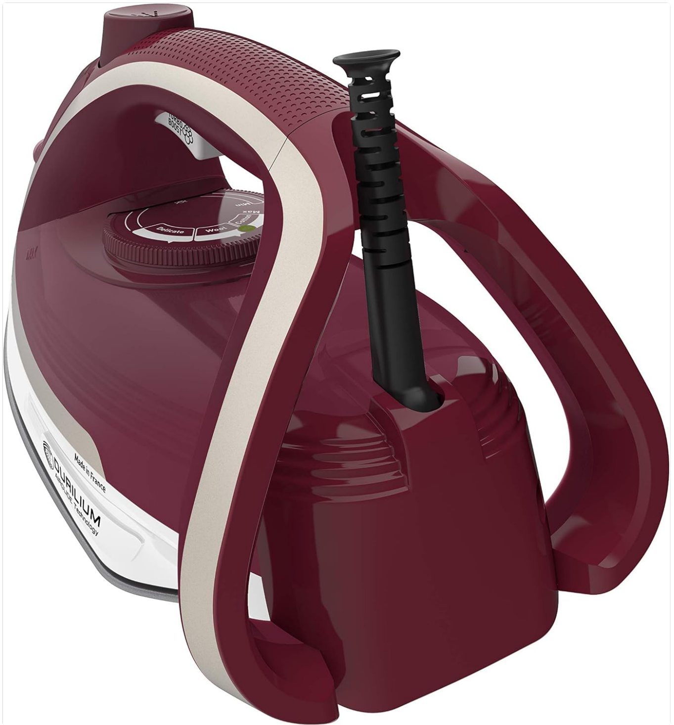
Figure 1: Side view of the Tefal FV 6810 Ultragliss Plus Steam Iron, highlighting the ergonomic handle and water filling inlet.