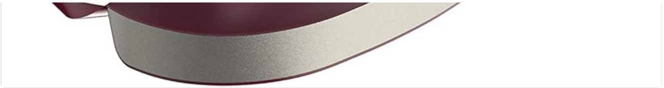
Figure 3: Angled view of the iron, illustrating the soleplate design and accessible control dial.