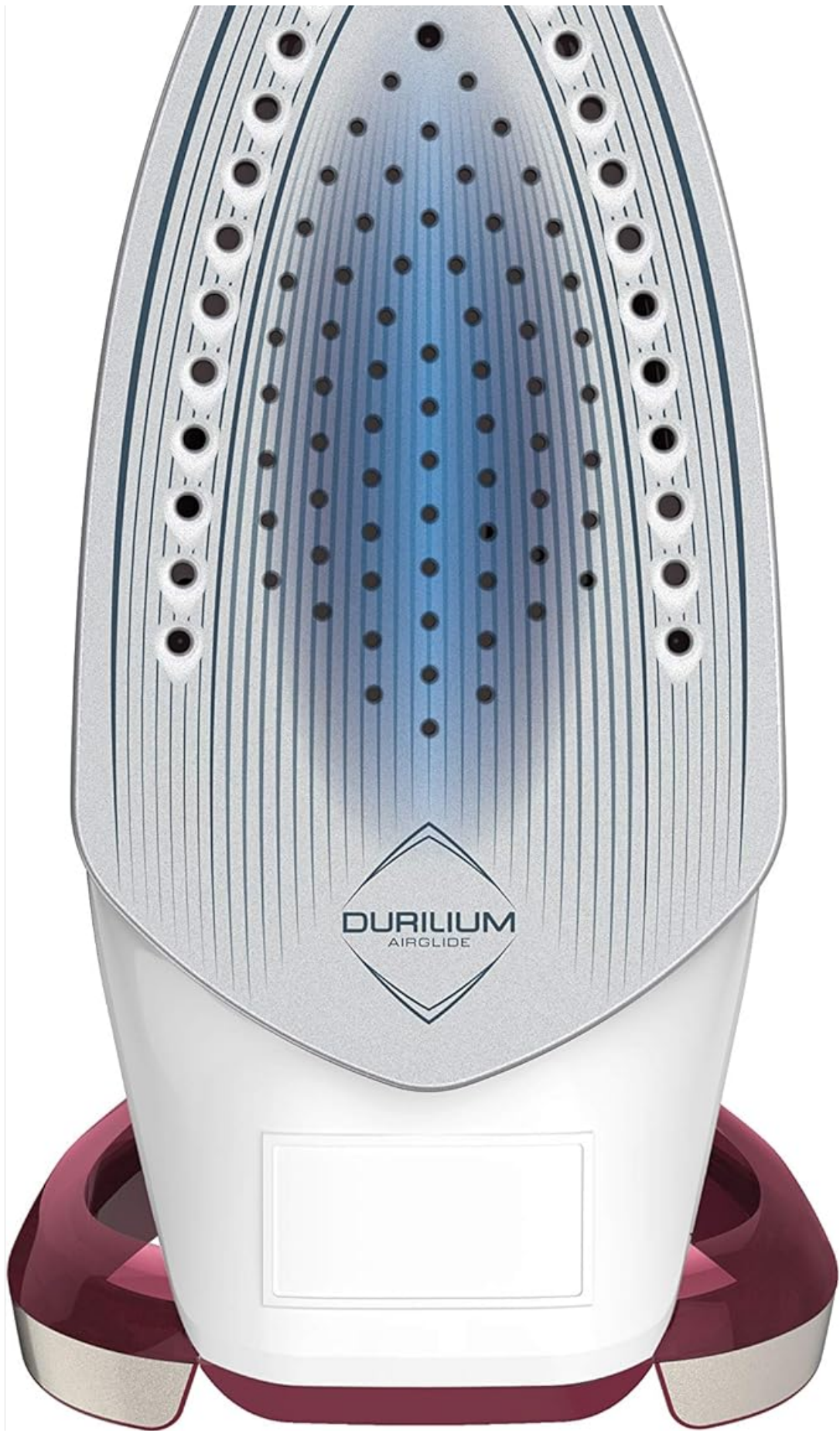
Figure 2: Underside view of the iron, showcasing the Durilium Airglide soleplate with active steam openings for optimal steam distribution.