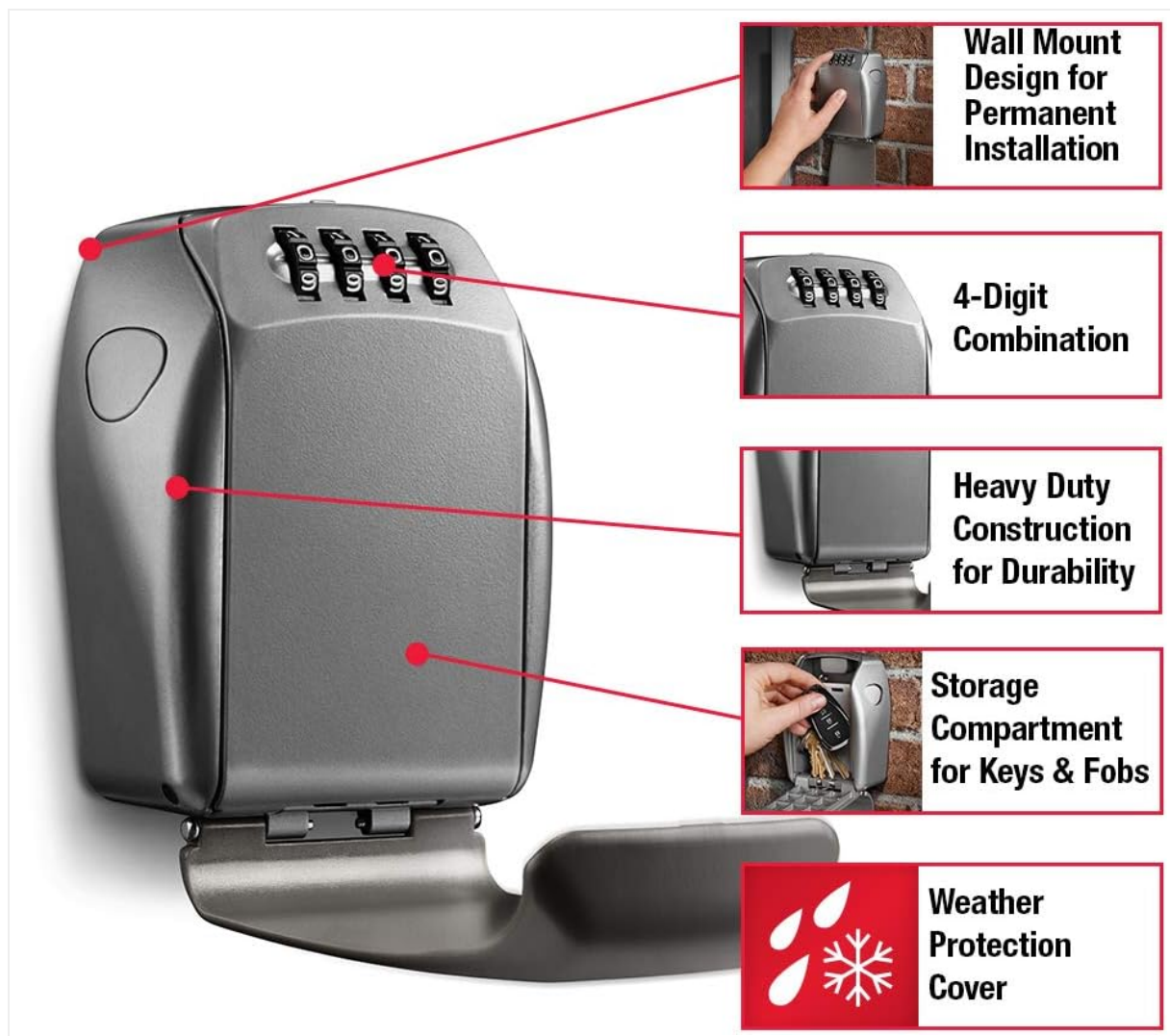
Image 2.1: Diagram highlighting the wall mount design, 4-digit combination, heavy-duty construction, storage compartment, and weather protection cover.