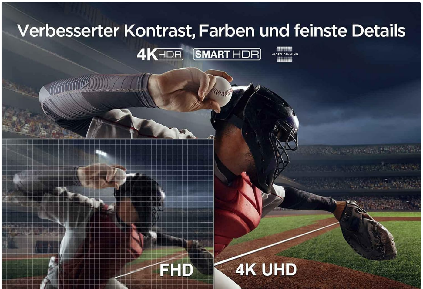
Figure 5: An illustration demonstrating the enhanced contrast, colors, and fine details achieved with 4K HDR and Smart HDR with Micro Dimming on the TCL 43P610, comparing it to Full HD (FHD) resolution.