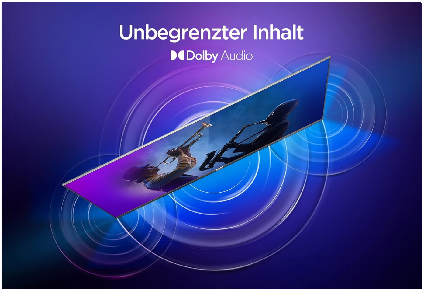
Figure 6: A visual representation highlighting the Dolby Audio feature of the TCL 43P610, indicating its capability to deliver high-quality,