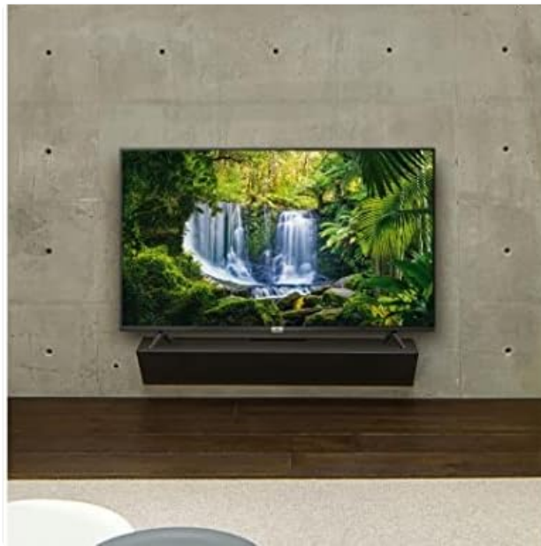
Figure 2: The TCL 43P610 television elegantly wall-mounted above a media console, demonstrating its suitability for various room setups. The image on the screen shows a vibrant waterfall scene.

If you choose to wall mount your TV, ensure you use a VESA-compatible wall mount kit (not included) that supports the TV's weight and VESA pattern. Follow the instructions provided with your wall mount kit. It is recommended to seek professional installation for wall mounting.