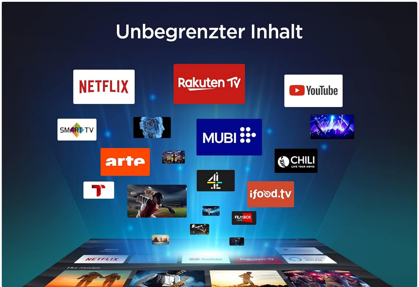
Figure 4: The Smart TV interface of the TCL 43P610, displaying icons for popular streaming services such as Netflix, YouTube, Rakuten TV, Mubi, and Arte, indicating the wide array of content available.

Your TCL 43P610 is a Smart TV, providing access to a wide range of online content and applications. Connect your TV to the internet via Wi-Fi or LAN to enjoy services like Netflix, YouTube, and more. Navigate to the Smart TV home screen to browse and launch applications.