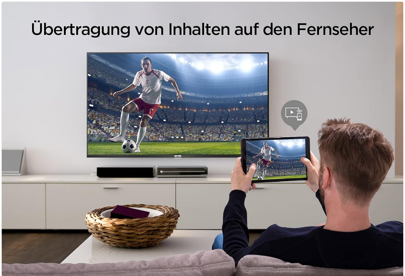
Figure 7: A user demonstrating the content casting feature, wirelessly displaying content from a tablet onto the TCL 43P610 television, illustrating seamless media sharing.

The T-cast feature allows you to cast content from your mobile devices (smartphones, tablets) directly to your TV screen. Ensure both your TV and mobile device are connected to the same Wi-Fi network. Use a compatible T-cast application on your mobile device to initiate casting.