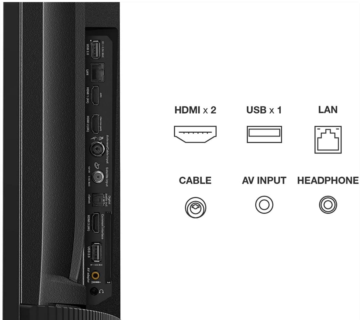
Figure 3: A detailed view of the connectivity ports on the side of the TCL 43P610 TV, including two HDMI ports, one USB port, a LAN port, and inputs for cable, AV, and headphones. This illustrates the TV's versatile connection options.