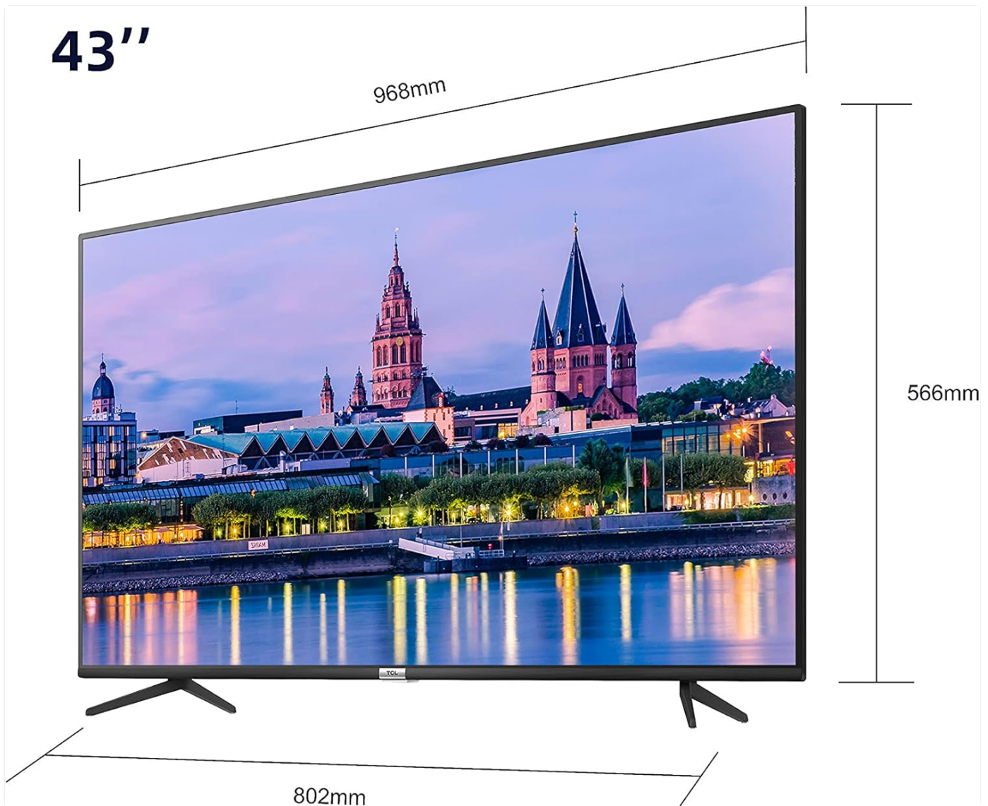
Figure 9: A diagram illustrating the key dimensions of the TCL 43P610 43-inch TV, showing a width of 968mm and a height of 566mm, useful for planning installation space.