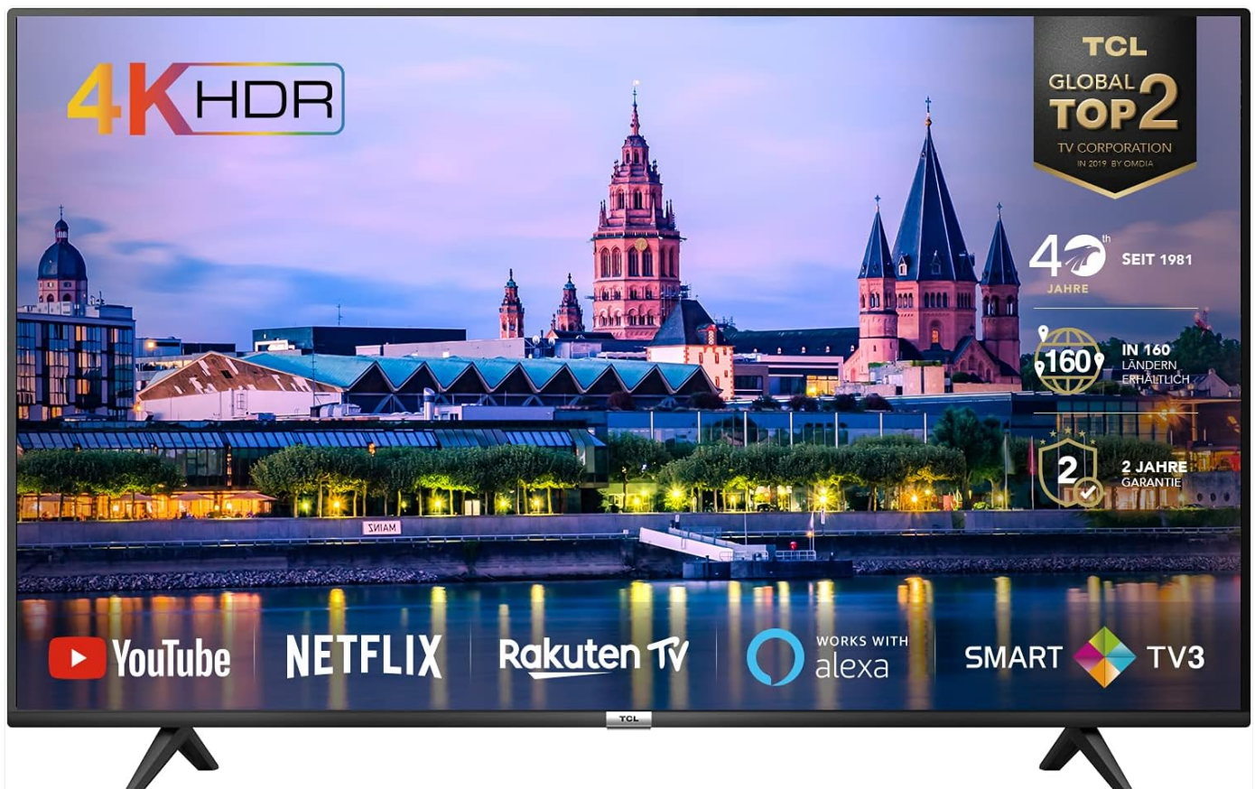
Figure 1: The TCL 43P610 43-inch 4K UHD Smart LED TV, showcasing its slim design and vibrant display with a city skyline image. The TV supports 4K HDR and features built-in access to popular streaming services like YouTube and Netflix.

This manual provides essential information for setting up, operating, and maintaining your TCL 43P610 43-inch 4K UHD Smart LED TV. Please read this manual thoroughly before using your television to ensure proper and safe operation. Keep this manual for future reference.