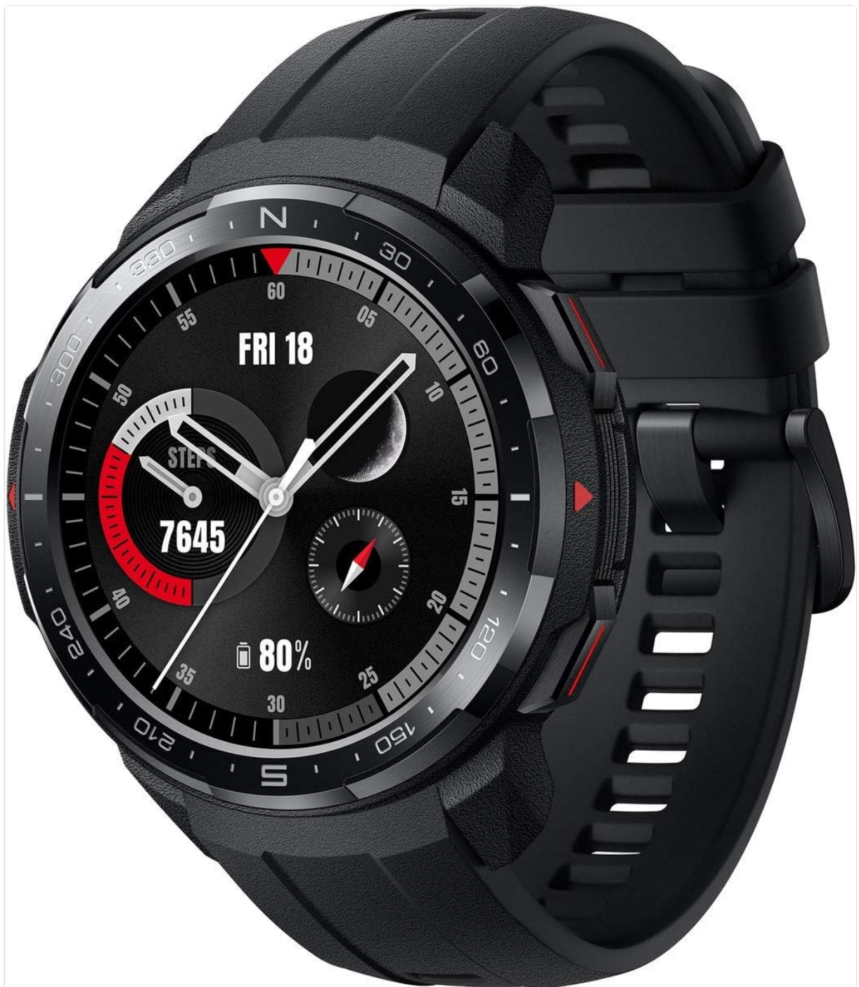
Figure 3.1: Front view of the HONOR Watch GS Pro, showing the 1.39-inch AMOLED display and side buttons.