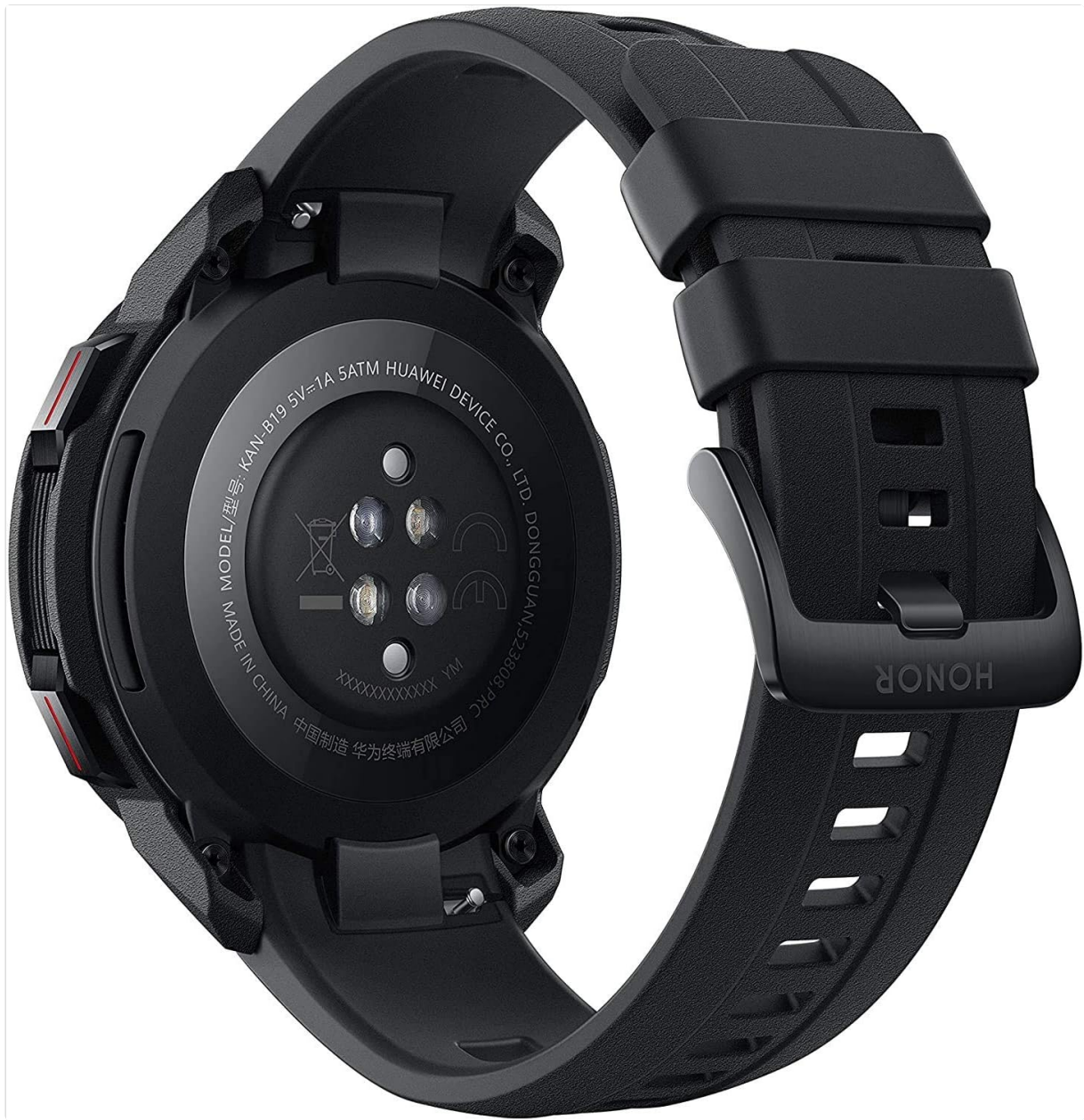
Figure 3.2: Rear view of the HONOR Watch GS Pro, highlighting the heart rate sensor and charging pins.