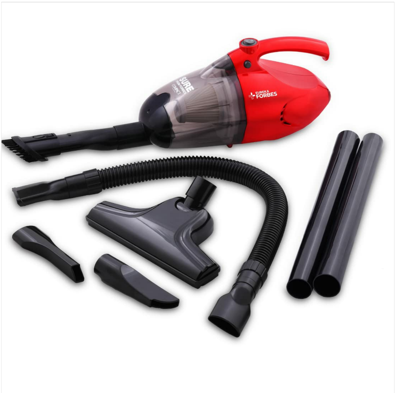
Image: The Eureka Forbes Compact Vacuum Cleaner unit shown with all its included accessories laid out, including the main unit, hose, extension tubes, and various nozzles.