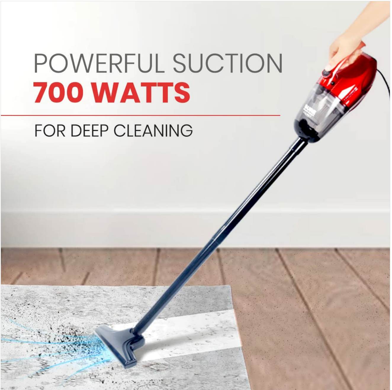
Image: The Eureka Forbes Compact Vacuum Cleaner being used with extension tubes and floor brush to clean a floor, demonstrating its powerful 700 Watts suction for deep cleaning.