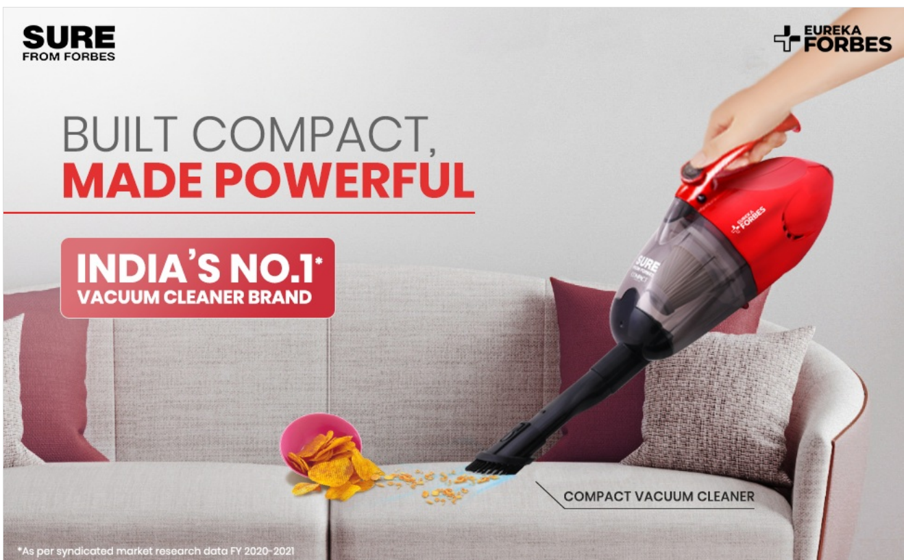
Image: A person using the Eureka Forbes Compact Vacuum Cleaner with an attachment to clean a sofa, demonstrating its compact and powerful design for effective cleaning.