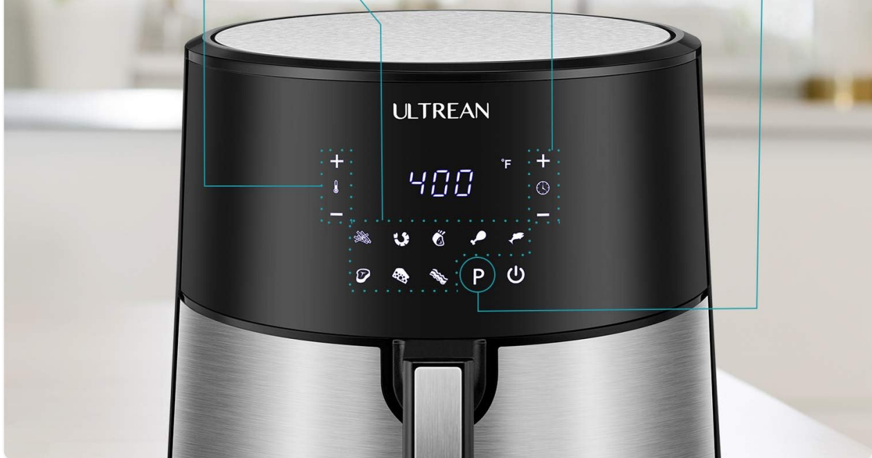
Image: Close-up of the Ultrean Air Fryer's digital control panel, showing temperature, time, and various function icons.