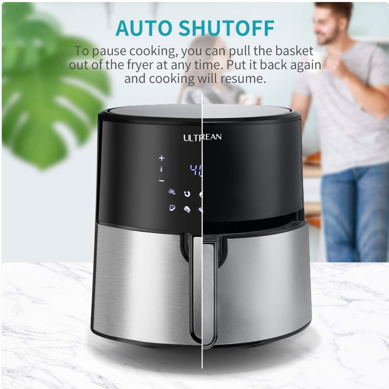
Image: A visual representation of the air fryer's auto shut-off feature, showing cooking pausing when the basket is removed and resuming when reinserted.

Image: The Ultrean Air Fryer's digital display showing icons for its 8 cooking presets: French Fries, Shrimp, Roast, Chicken, Fish, Steak, Cheese Melts, and Bacon.