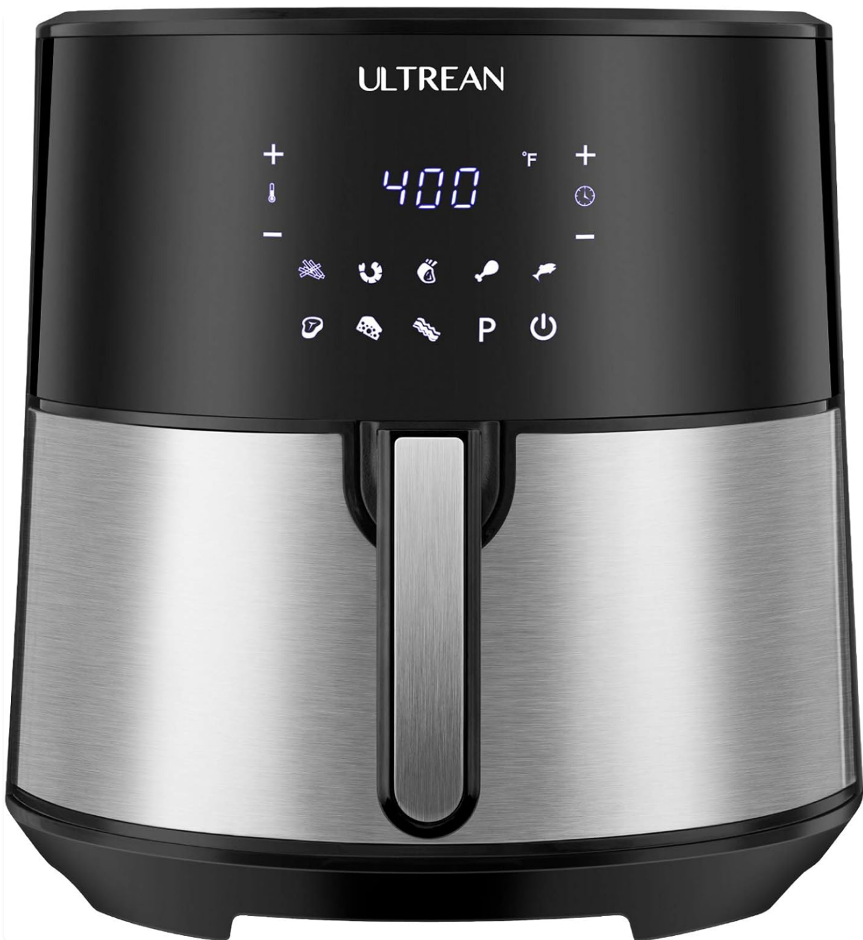
Image: Front view of the Ultrean 8 Quart Air Fryer, showcasing its black and stainless steel design with a digital display.