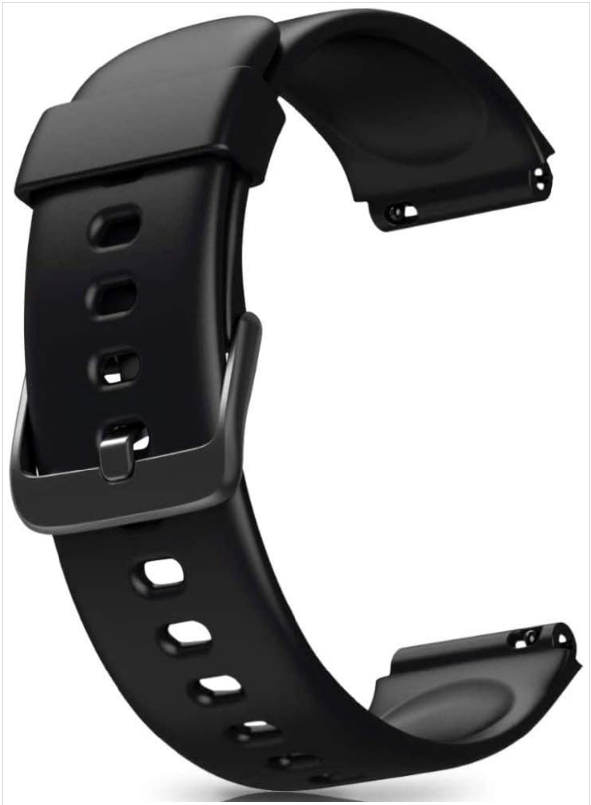
Image: The ZURURU Soft Silicone Smart Watch Replacement Band, shown in black, featuring a classic buckle closure and multiple adjustment holes for a secure fit.