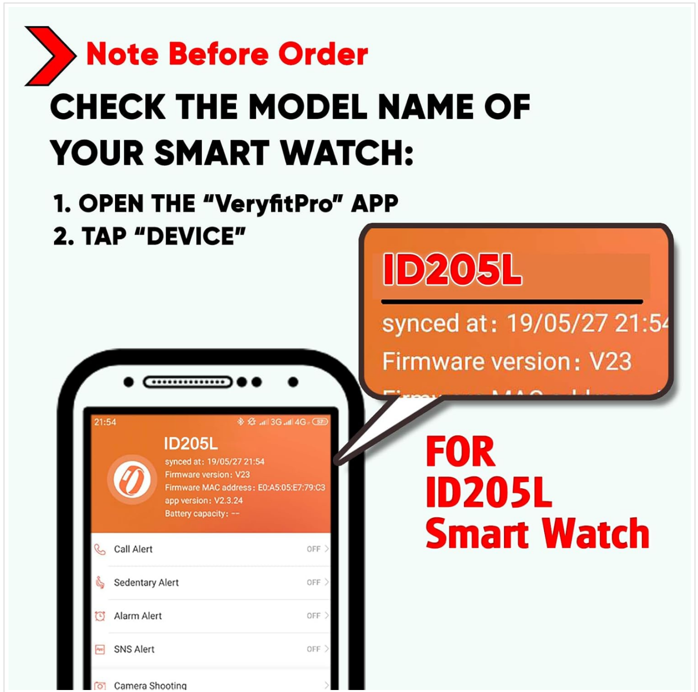
Image: A visual guide demonstrating how to verify your smartwatch model (ID205L) by accessing the "VeryfitPro" application and navigating to the "Device" section.

Before installing your new band, it is crucial to confirm your smartwatch model and the required band width. This band is designed for smartwatches using 19mm spring bars, such as the Veryfitpro ID205L.