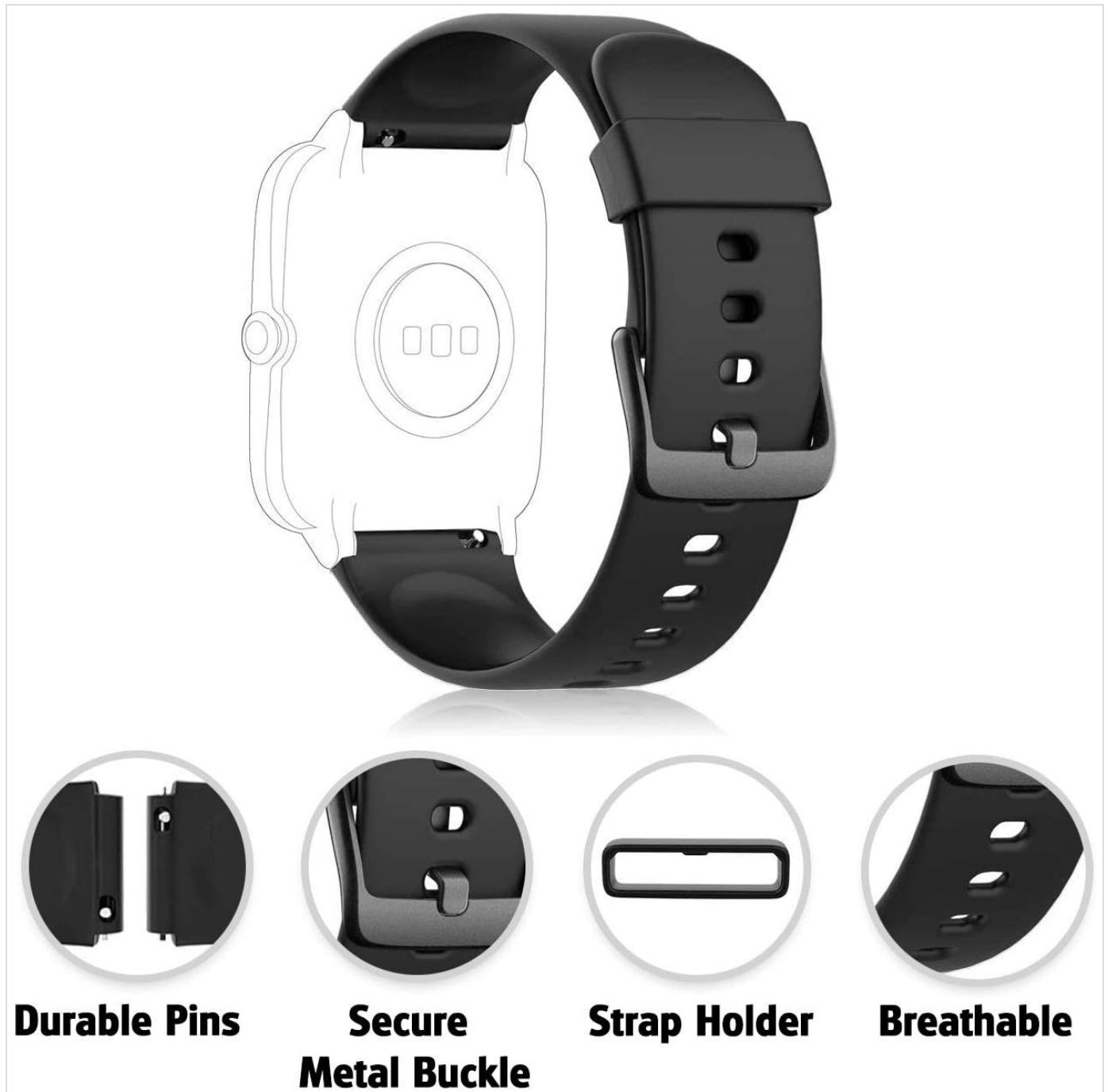
Image: A detailed view highlighting the band's construction, including durable pins for secure attachment, a robust metal buckle for reliable fastening, a strap holder to keep excess band neatly tucked, and a breathable design for comfort.

Once installed, the ZURURU silicone band offers a comfortable and secure fit for daily wear. Its design incorporates features for enhanced user experience.