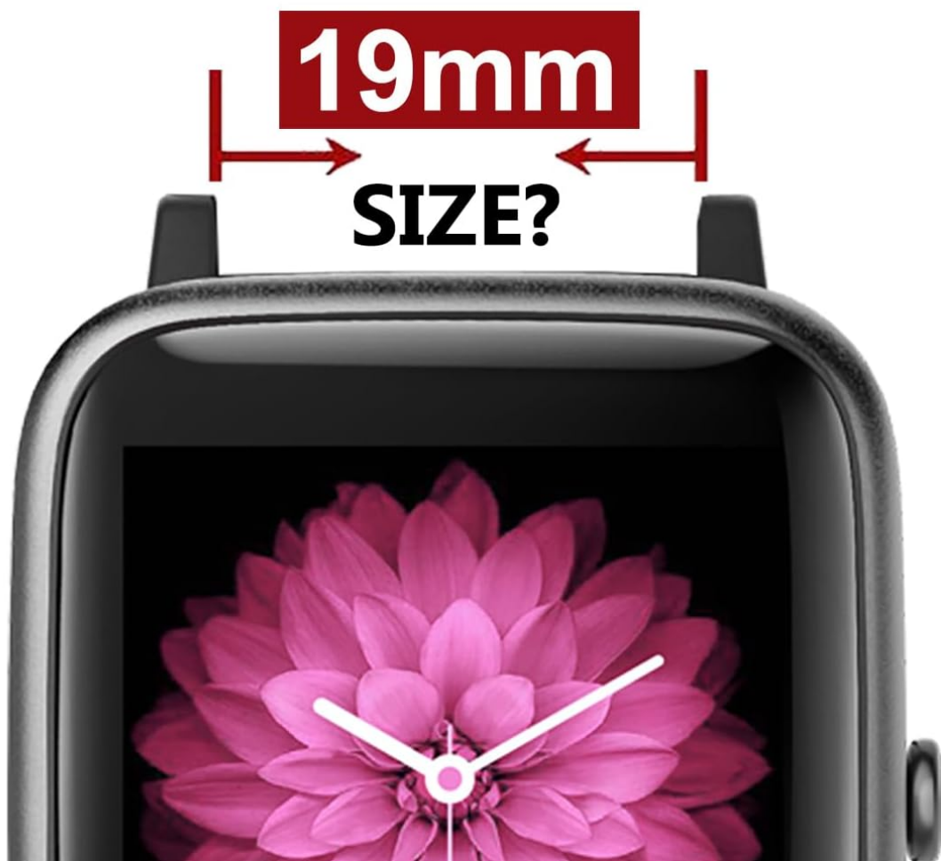
Image: An illustration indicating the correct method to measure the watch lug width, confirming the 19mm size required for this replacement band.

Compatible with VERYFITPRO ID205L Smart watch that uses standard 19mm spring bars.