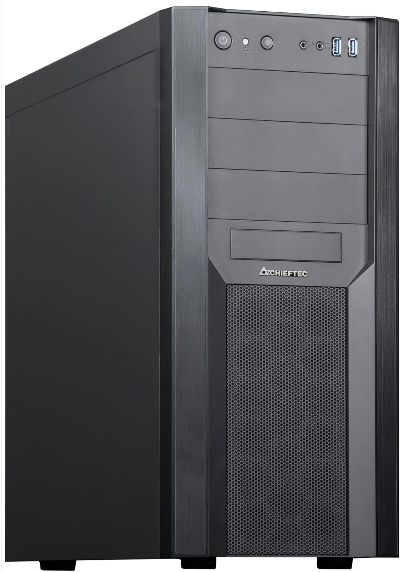
Figure 1: Angled front view of the Chieftec CW-01B-OP Computer Unit Tower in black.