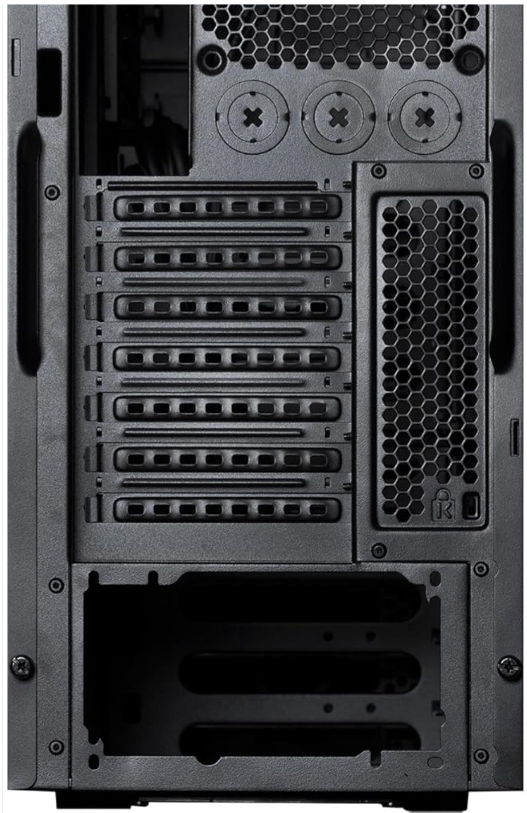
Figure 5: Rear view of the CW-01B-OP case, illustrating the expansion slots and rear fan mounting area.