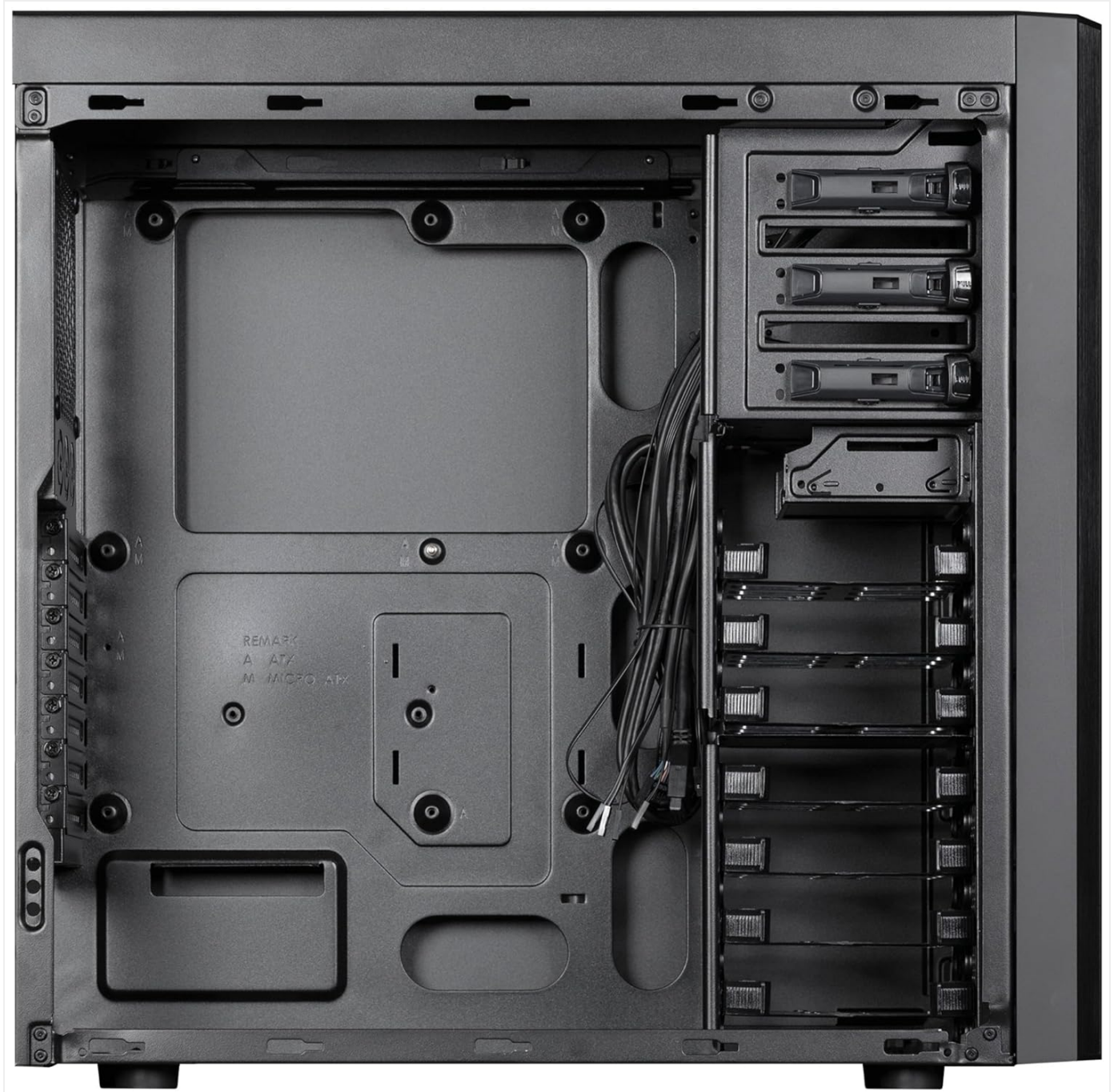
Figure 2: Internal view of the CW-01B-OP case, highlighting the spacious motherboard tray and cable management cutouts.