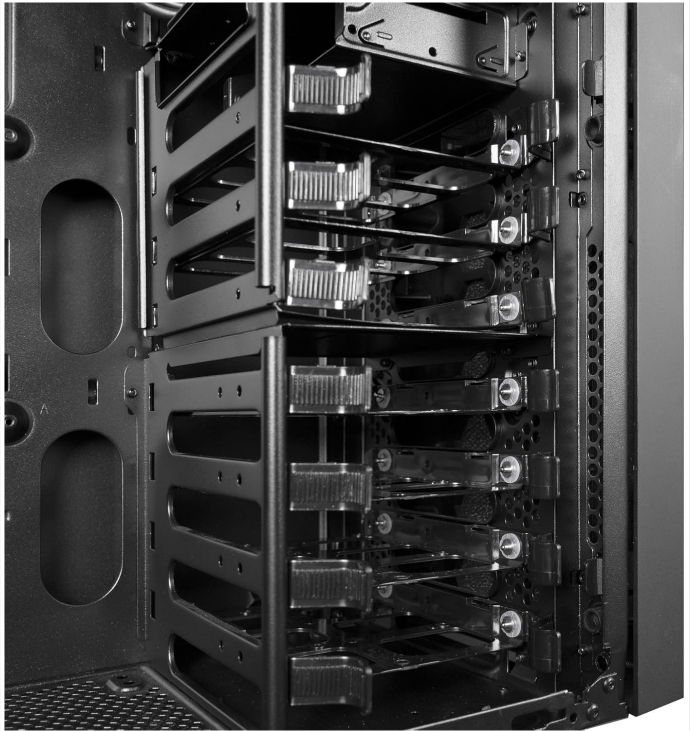
Figure 3: Close-up view of the internal drive bays, demonstrating the extensive mounting options for storage devices.