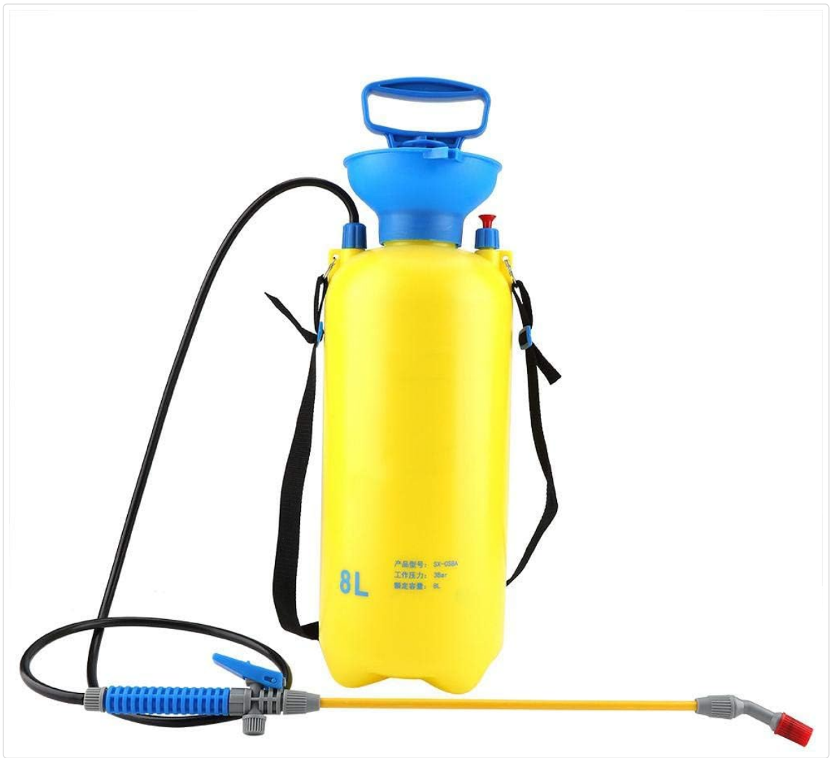
Figure 2.1: Overall view of the Sorand 8L Manual Garden Sprayer, showing the main tank, pump assembly, hose, and spray wand.