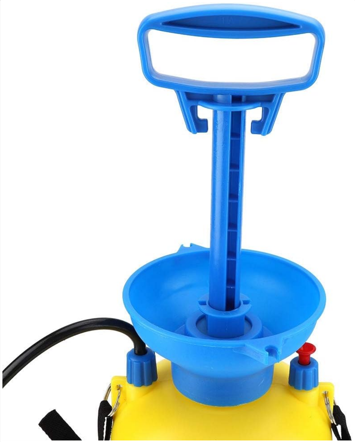
Figure 2.2: Detail of the blue pump handle and the wide opening for filling the tank, designed to minimize spills and facilitate easy access.