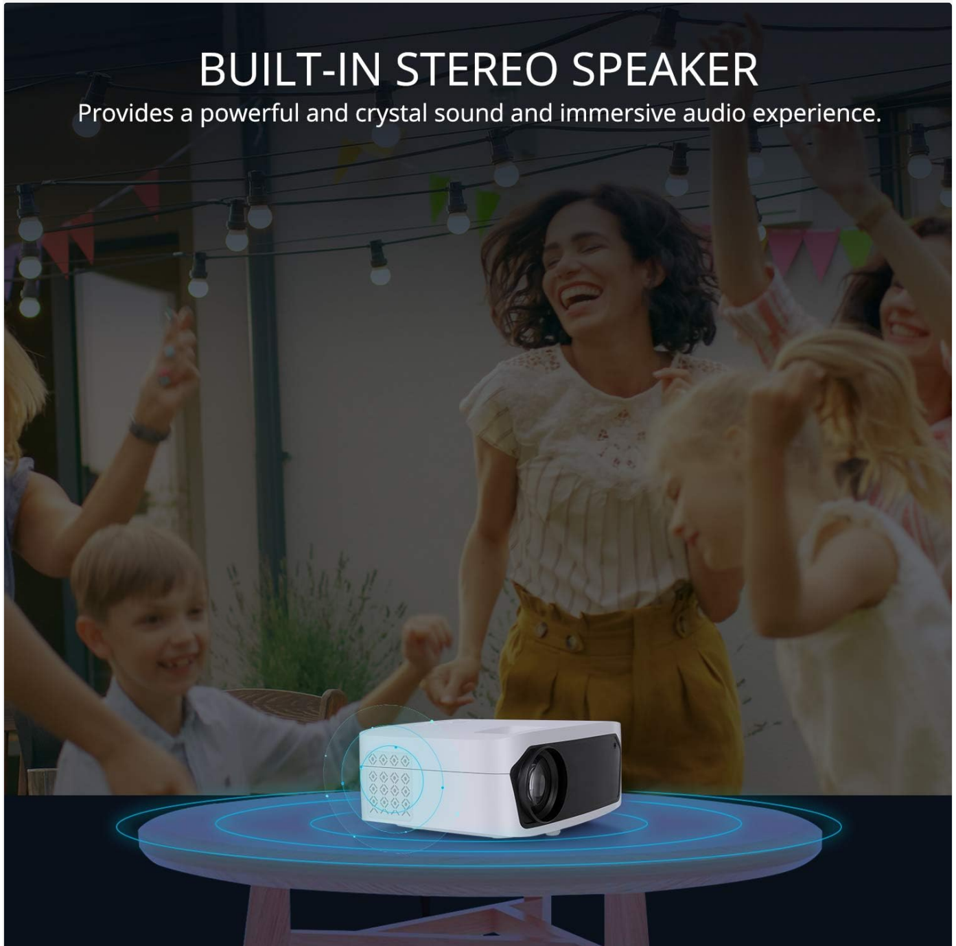
Image 6.3: This image illustrates the built-in stereo speaker feature of the EKASN projector, emphasizing its ability to provide powerful and clear sound for an immersive audio experience.

The projector features a built-in stereo speaker for convenient audio playback. For enhanced sound quality, you can connect external speakers or headphones using the 3.5mm audio output jack.