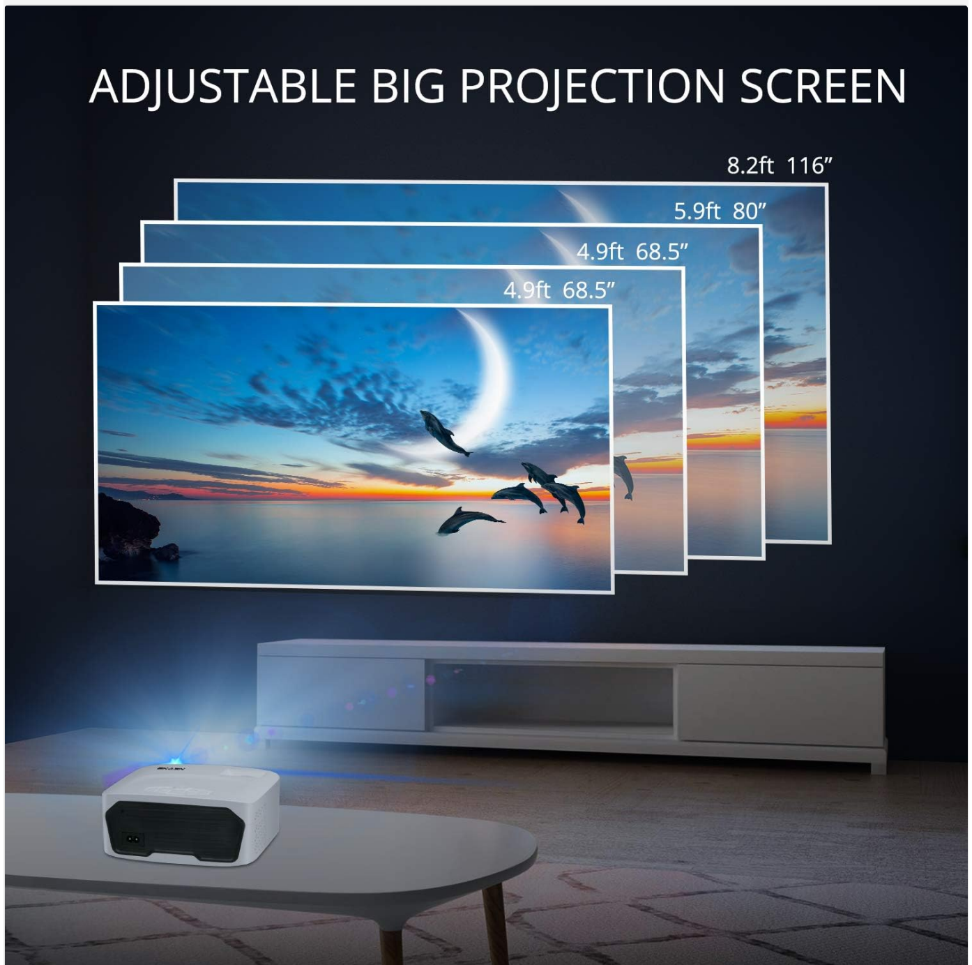
Image 5.1: This illustration demonstrates the adjustable big projection screen capability of the EKASN projector, showing various screen sizes achievable at different projection distances.

Place the projector on a stable, flat surface. Ensure the projector is positioned directly in front of the projection surface (wall or screen) for best results. The optimal projection distance ranges from 3.9ft to 8.2ft, providing a screen size from 50" to 120".