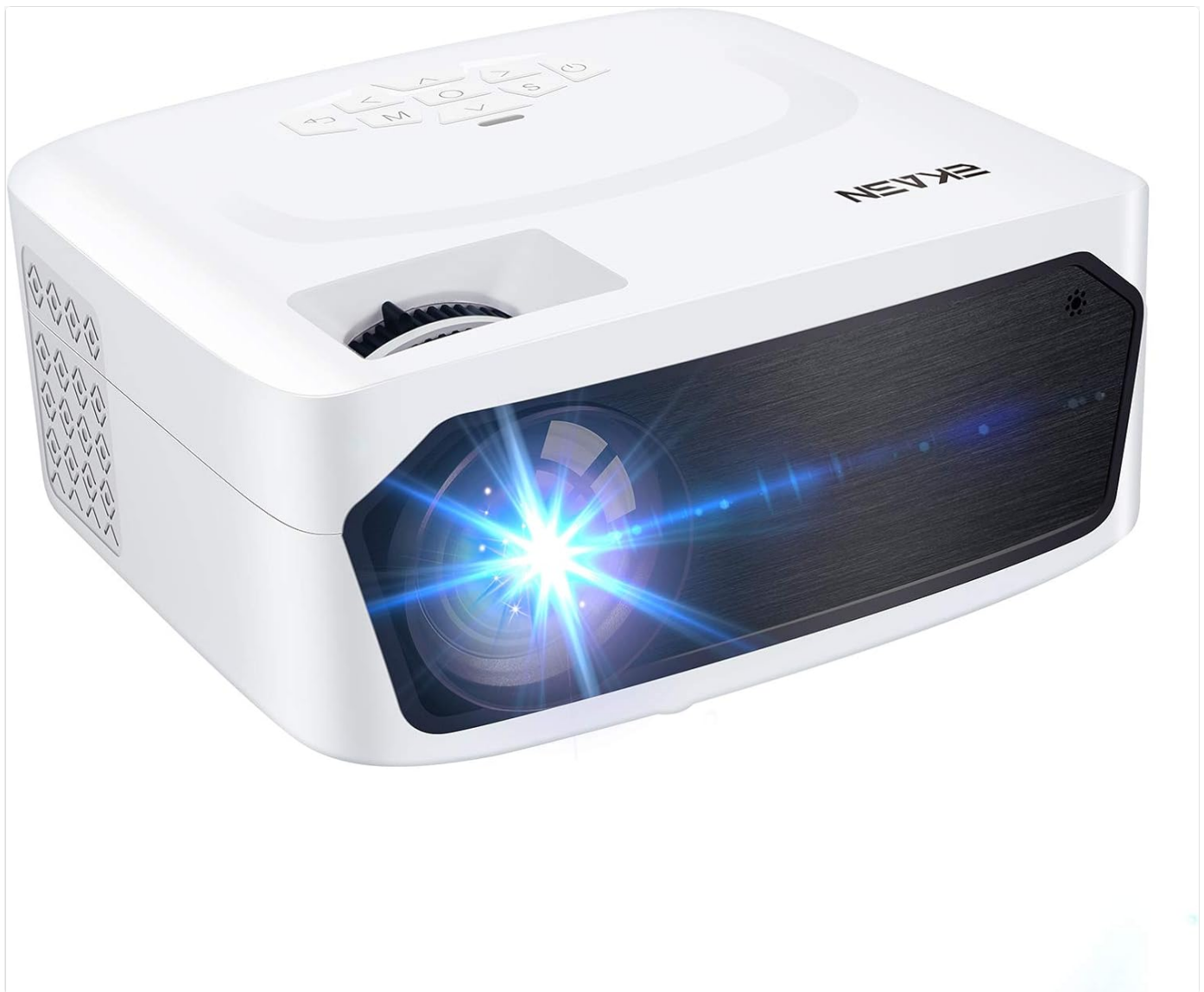
Image 1.1: The EKASN Portable Movie Projector MP02, a compact and versatile device designed for home theater and outdoor entertainment.