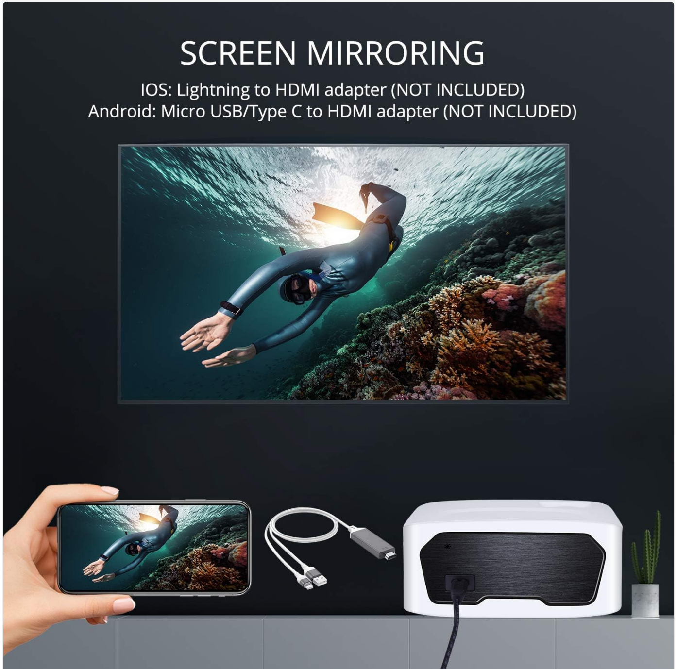
Image 6.2: This image demonstrates the screen mirroring capability of the EKASN projector, showing how to connect an iPhone (with a Lightning to HDMI adapter) and an Android phone (with a Micro USB/Type C to HDMI adapter) to the projector for displaying content.

To mirror your smartphone screen, an additional adapter is required (not included):