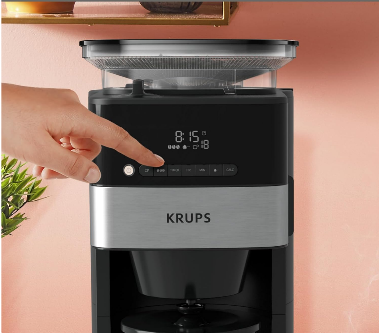
Figure 5.2: A hand demonstrating the use of the control panel, specifically highlighting the timer function for scheduled brewing.