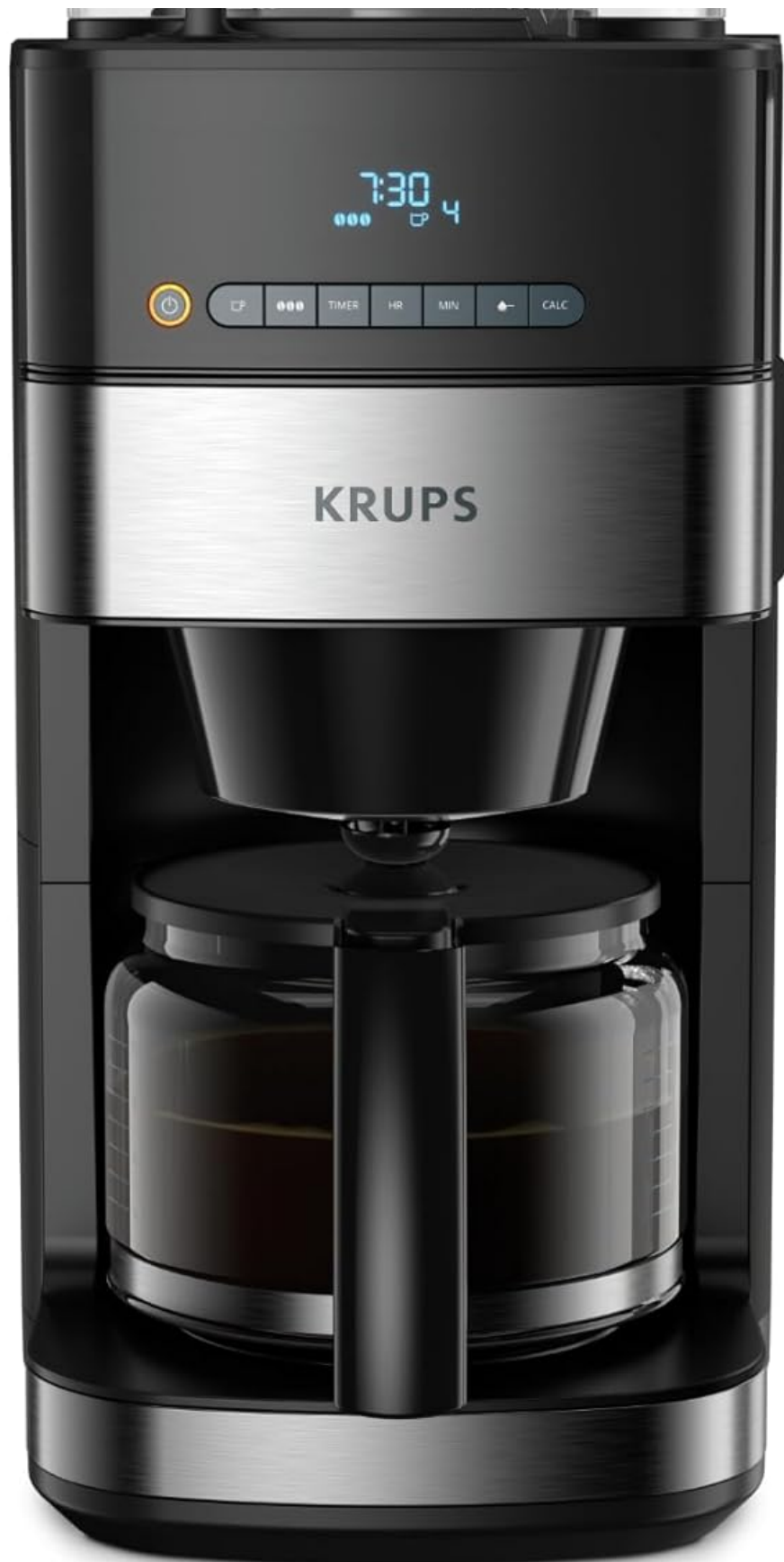
Figure 8.1: The coffee maker with its approximate dimensions, showing a width of 36 cm and a height of 43 cm.