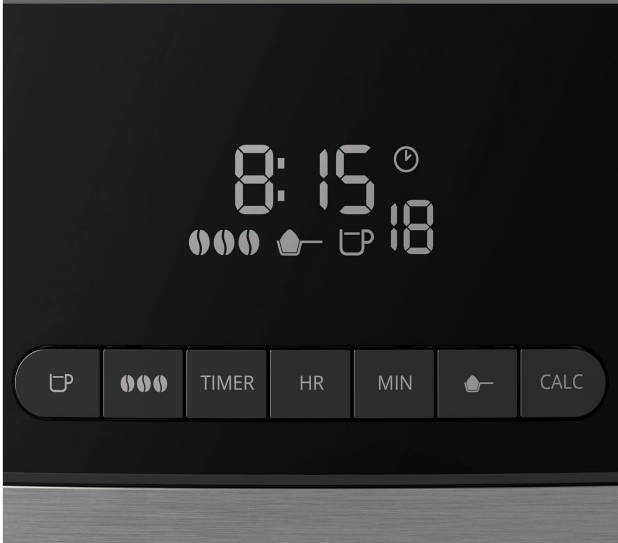
Figure 3.3: A detailed view of the digital control panel, featuring an LED display and intuitive buttons for various settings.