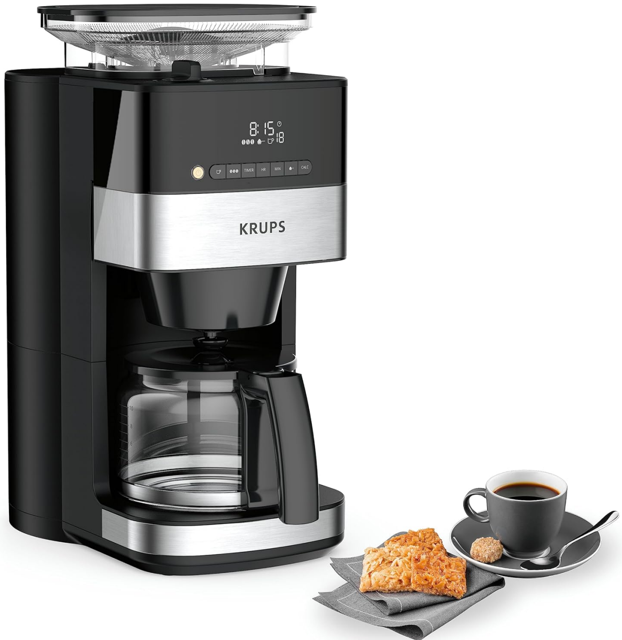
Figure 3.1: The Krups Grind Aroma Coffee Maker, showcasing its sleek design alongside a cup of coffee and pastries.