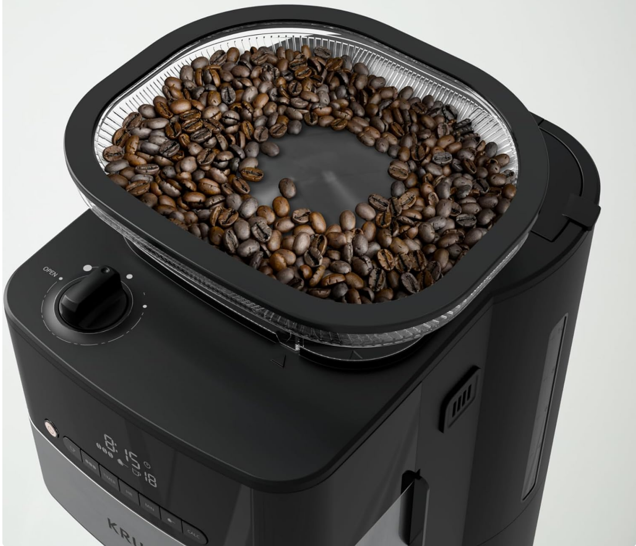
Figure 3.4: The top section of the coffee maker, clearly showing coffee beans loaded into the integrated conical burr grinder.