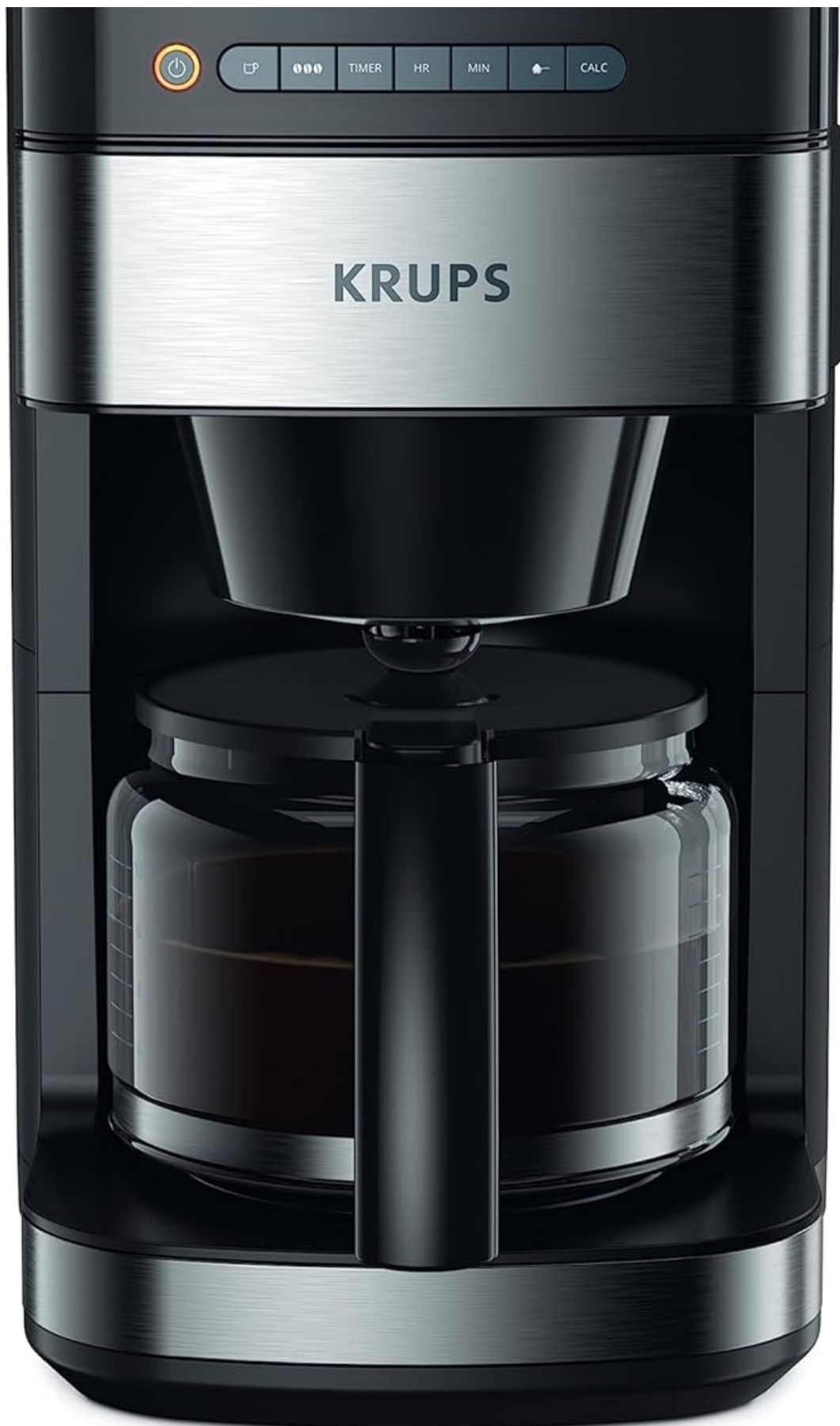
Figure 3.2: A direct front view of the Krups Grind Aroma Coffee Maker, highlighting its compact form.