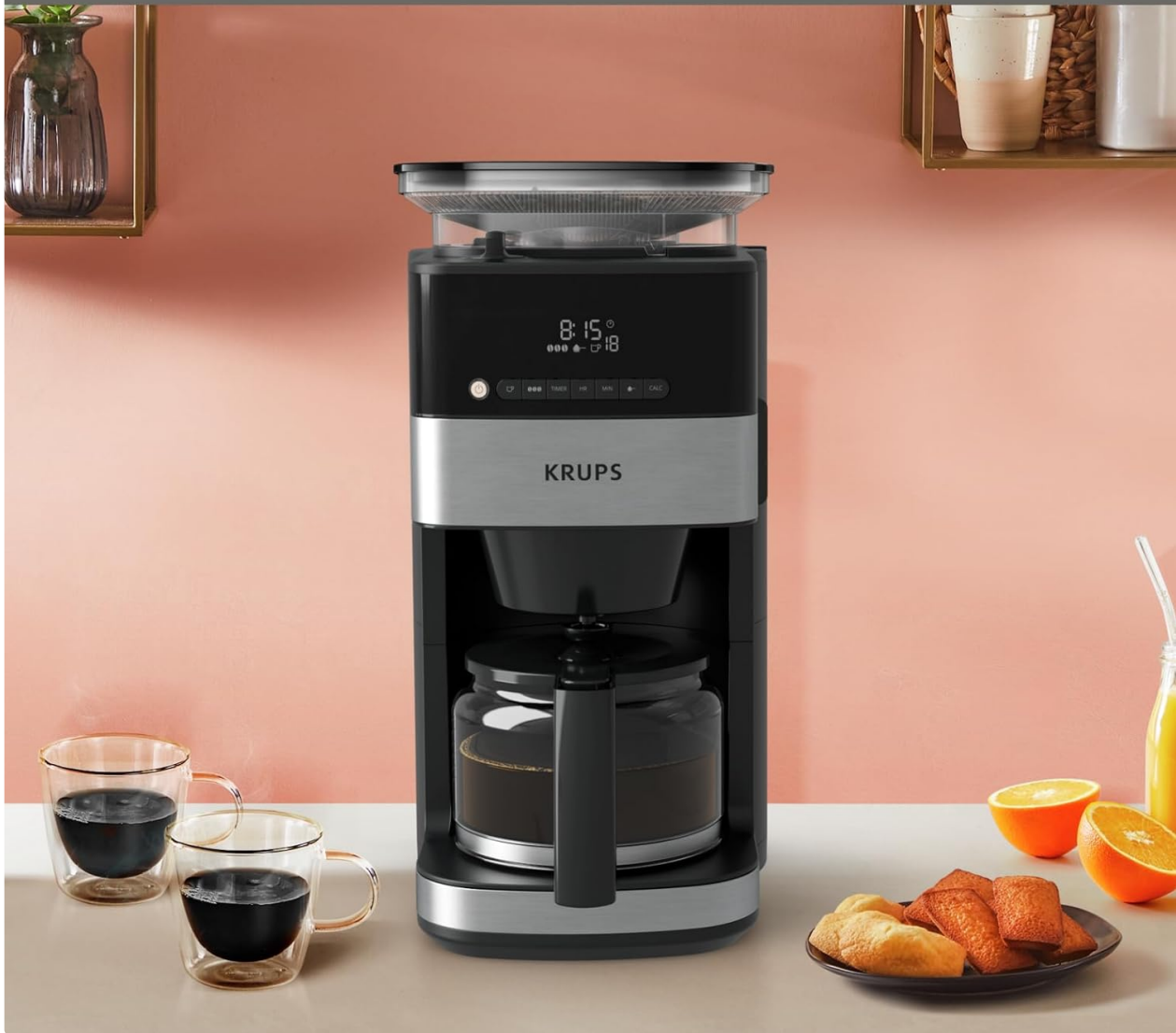
Figure 5.1: The coffee maker ready for use, demonstrating the versatility of brewing with either whole beans or pre-ground coffee.