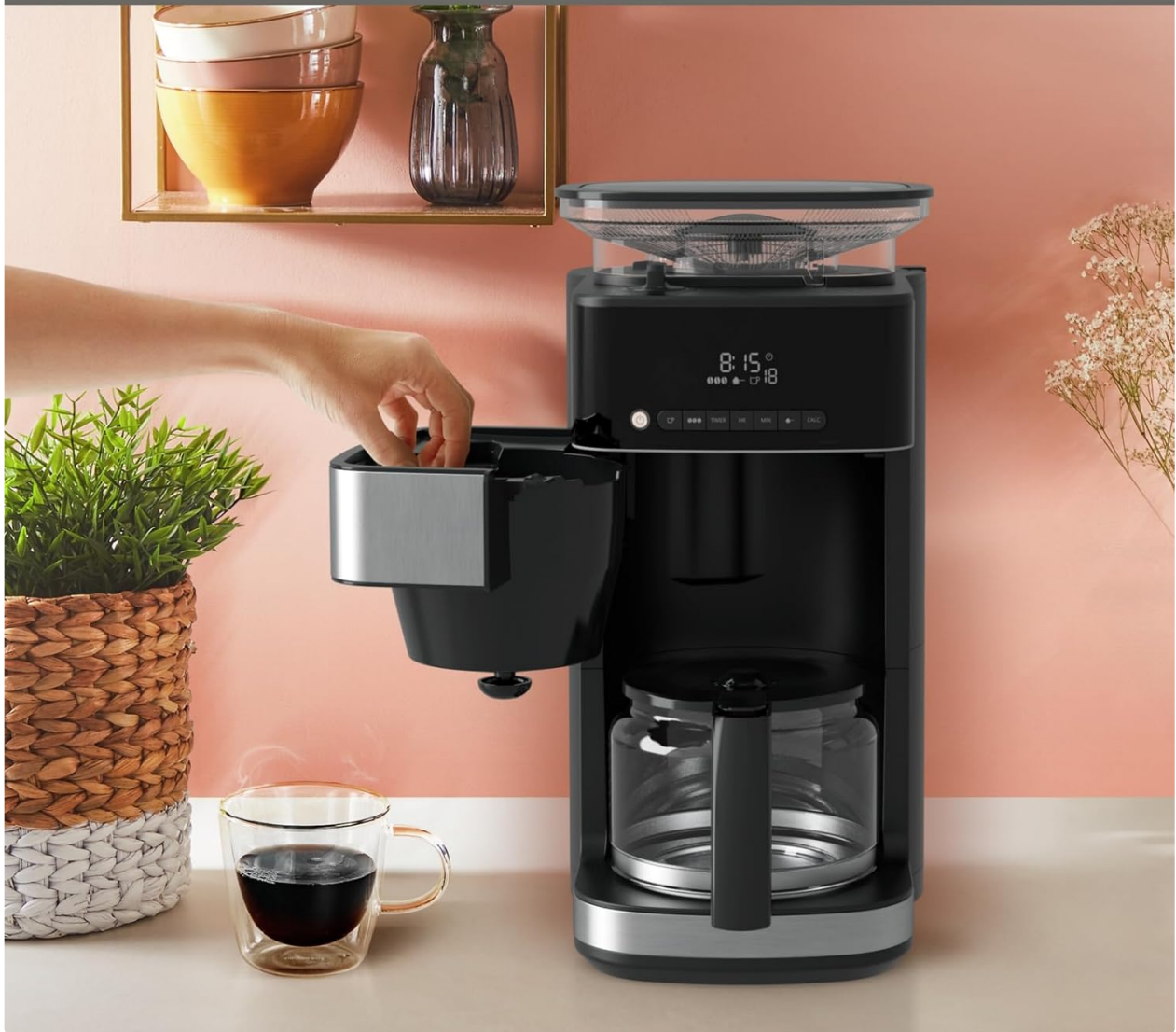
Figure 6.1: A hand demonstrating the removal of the integrated bean container and grinder, highlighting the ease of cleaning these components.