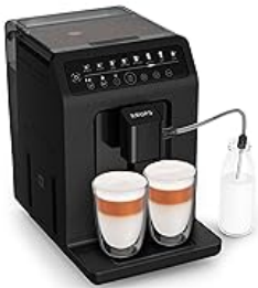
Figure 9.1: KRUPS' 15-year repairability commitment, highlighting their dedication to product longevity and sustainability.

For further assistance, spare parts, or to locate a repair center, please visit the official KRUPS website or contact their customer support. You can also visit the KRUPS Brand Store for more information and products.