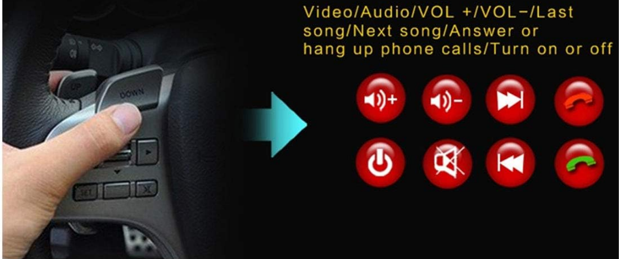
Image 6: Diagram illustrating the steering wheel control function, showing how vehicle steering wheel buttons can be used to control the GOFORJUMP 9601G for functions like volume, track change, and call handling.

Video/Audio/VOL +/VOL-/Last song/Next song/Answer or hang up phone calls/Turn on or off