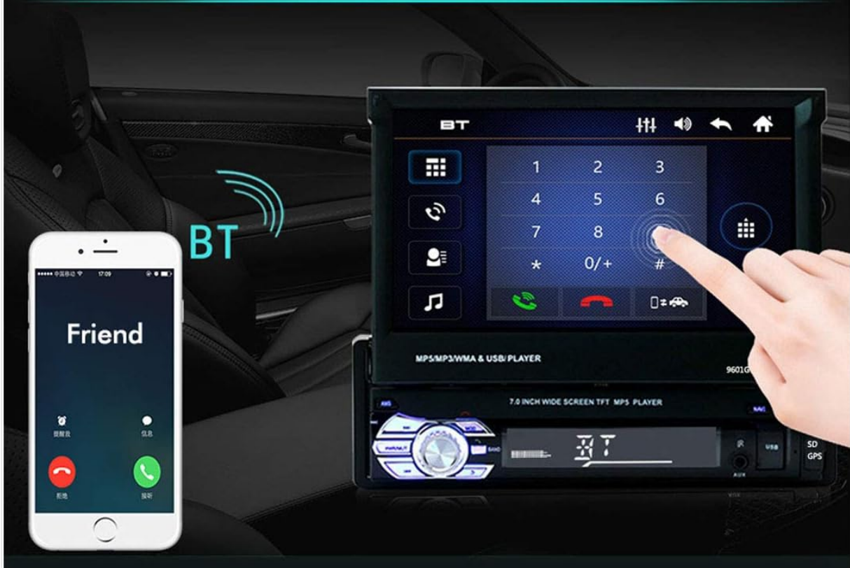
Image 4: Illustration of the GOFORJUMP 9601G's Bluetooth hands-free calling feature, showing a smartphone connected to the car stereo for safe communication while driving.

Connect your phone to the MP5 by the bluetooth, easy to answer and hang up a calling, make driving safer.