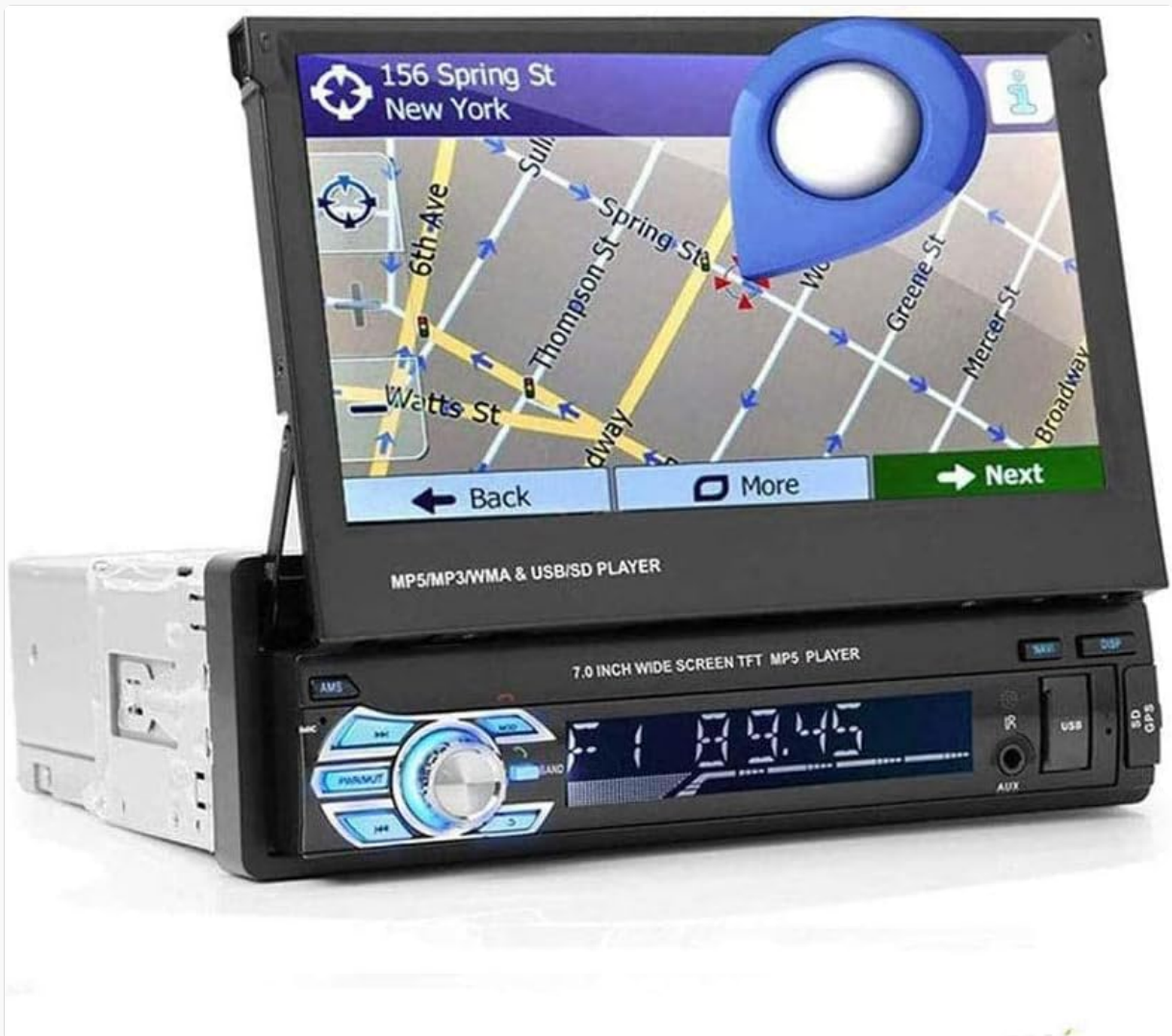
Image 1: Front view of the GOFORJUMP 9601G Car MP5 Stereo Player with its 7-inch screen extended, displaying a GPS navigation map. The main unit features control buttons and a rotary knob.