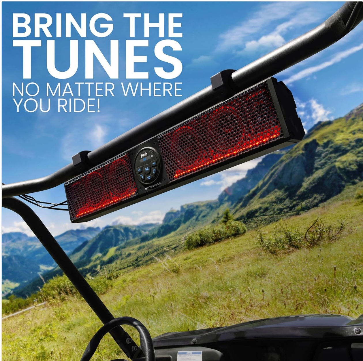
Image: The BRT26RGB sound bar showcasing its multicolor illumination feature, with examples of red, blue, green, and purple lighting.