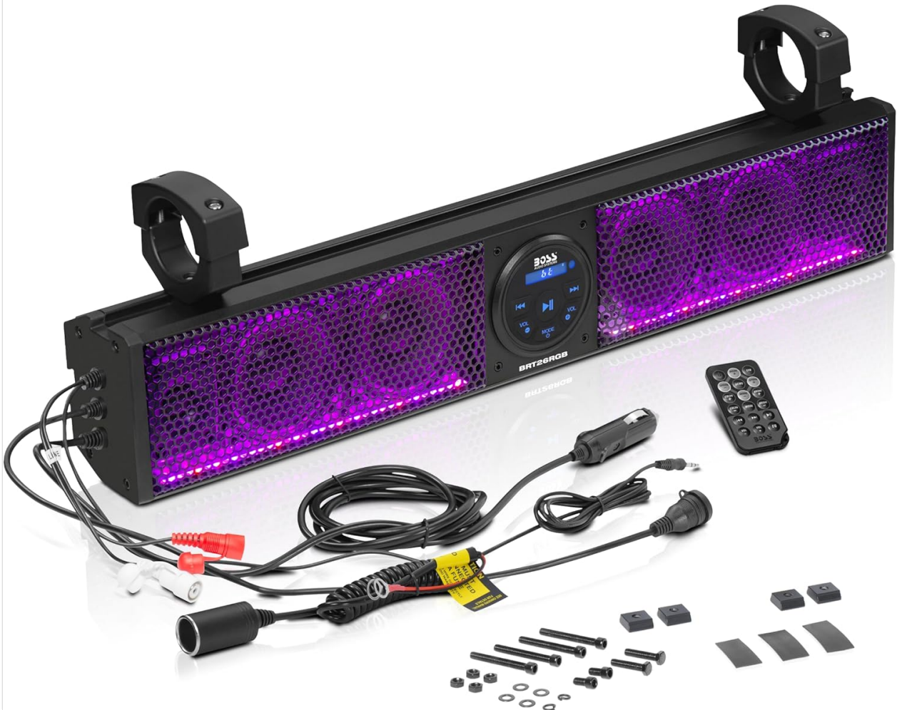
Image: All components included in the BRT26RGB package, laid out for inspection. This includes the sound bar, a wireless remote, power cables, and various mounting accessories.