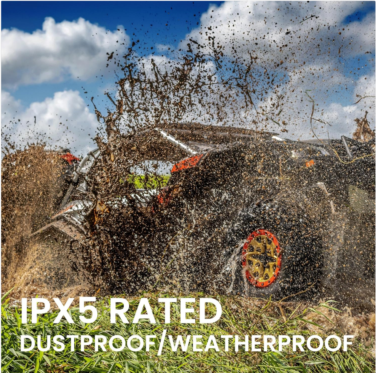
Image: An ATV driving through mud and water, illustrating the IPX5 weatherproof and dustproof capabilities of the sound bar in challenging conditions.