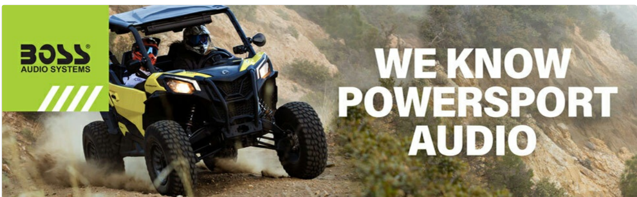
Image: Information regarding the 3-Year Platinum Online Dealer Warranty provided by BOSS Audio Systems for purchases made through Amazon.com.

For additional information and support, visit the BOSS Audio Systems Store on Amazon.