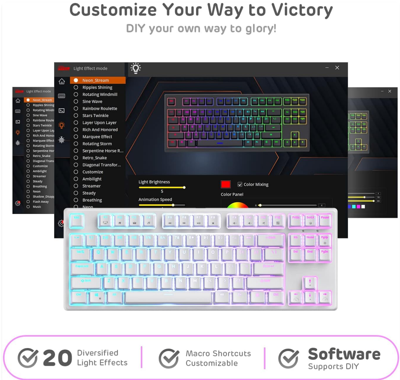
Image: This image displays the user interface of the RK ROYAL KLUDGE customization software, which allows for detailed control over light effects, macro shortcuts, and other DIY settings for the keyboard.

Note: Please contact customer support for any software installation or usage questions.