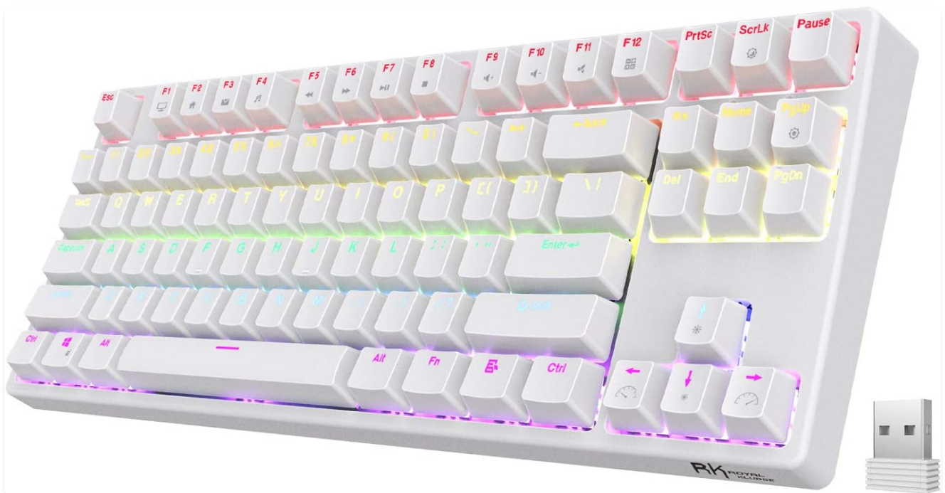
Image: The RK ROYAL KLUDGE Sink87G TKL Mechanical Gaming Keyboard in white, showcasing its compact layout and vibrant RGB backlighting. A USB wireless dongle is visible to the right of the keyboard.

Thank you for choosing the RK ROYAL KLUDGE Sink87G TKL Mechanical Gaming Keyboard. This compact, tenkeyless (TKL) keyboard offers both wired and 2.4G wireless connectivity, dynamic RGB backlighting, and customizable features, providing a versatile and responsive typing and gaming experience. This manual provides detailed instructions for setup, operation, maintenance, and troubleshooting to ensure optimal performance of your keyboard.