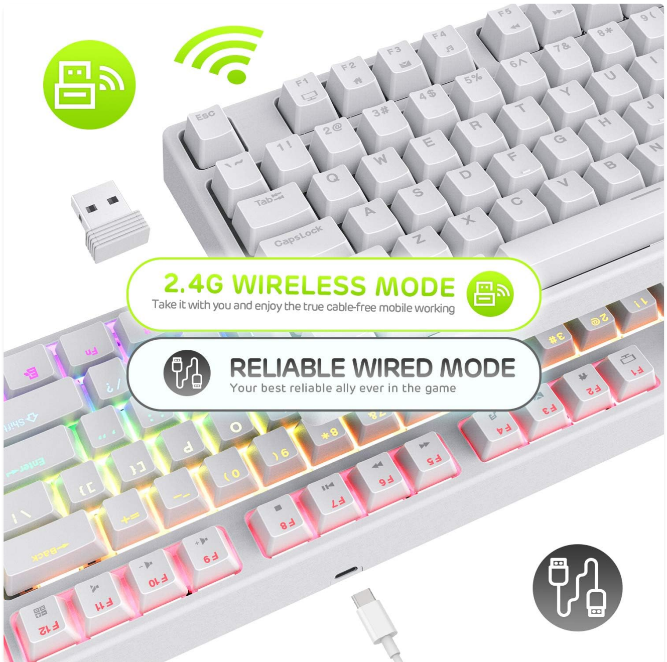
Image: This visual guide demonstrates both the 2.4G wireless connection method using a USB dongle and the reliable wired connection via a USB-C cable.

3. The keyboard will be recognized as a standard USB keyboard and is ready for use.