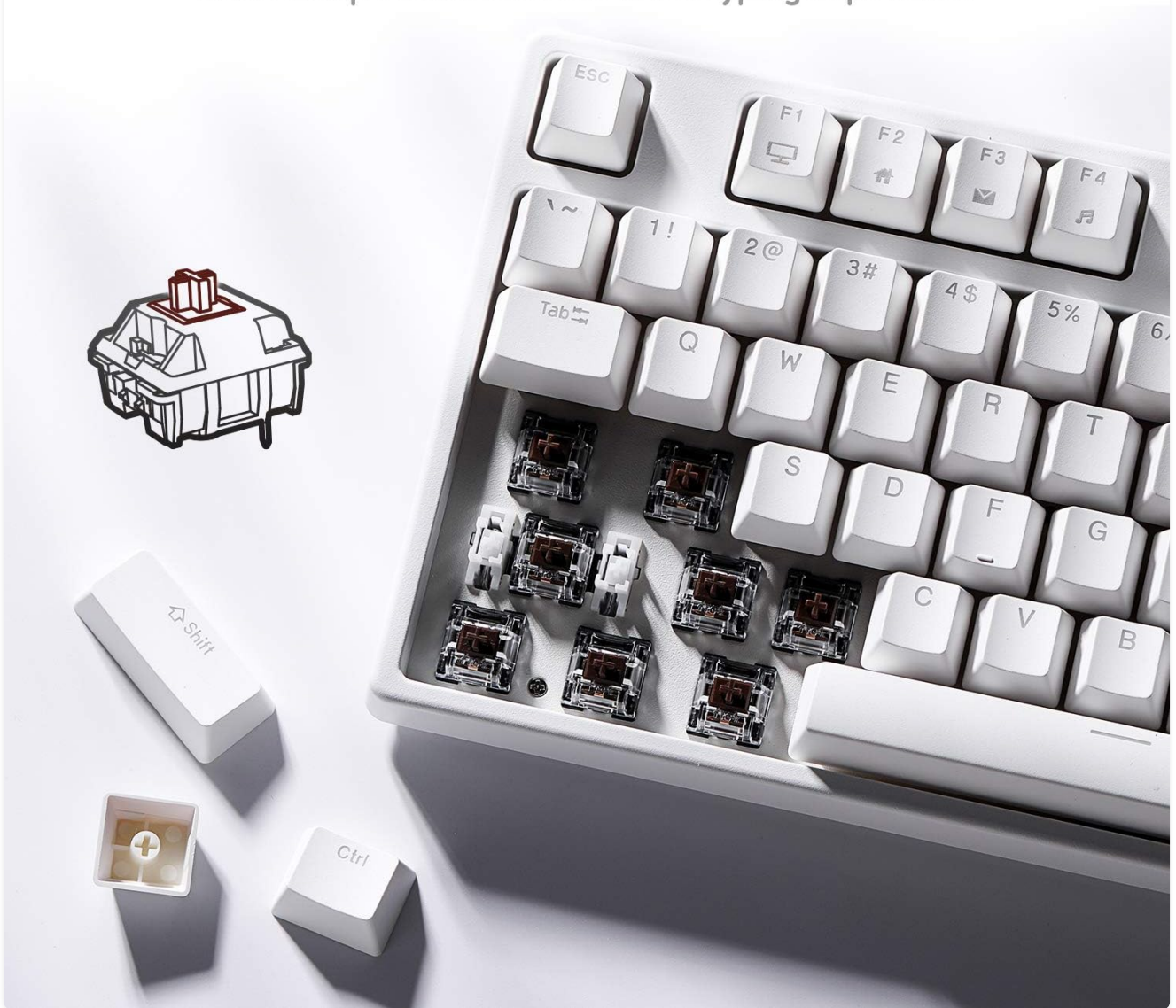
Image: This image highlights the balanced brown mechanical switches used in the keyboard, emphasizing their tactile feedback and low noise operation. Several keycaps are removed to show the switch mechanisms.

Little bump tactile with low noise typing experience