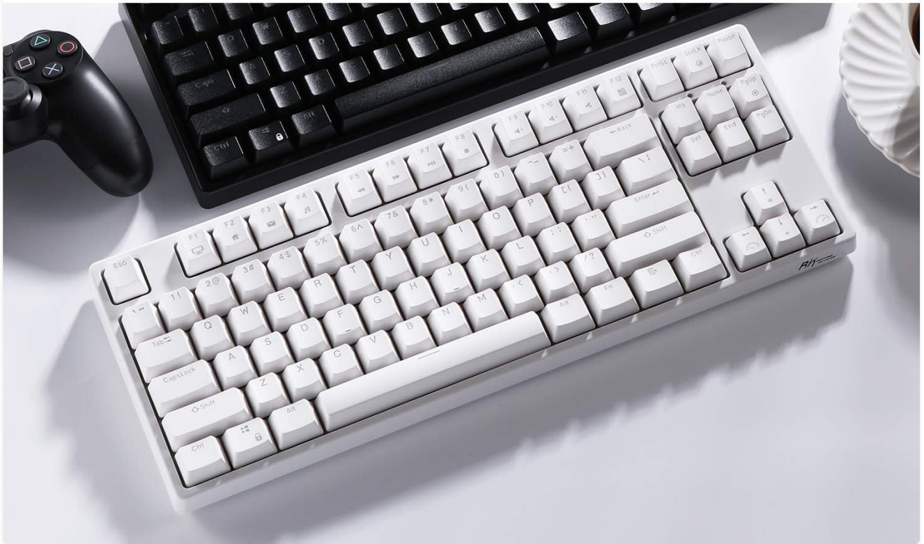
Image: A visual summary of the keyboard's main features, including its dual connectivity, brown mechanical switches, RGB lighting, macro customization, detachable USB-C cable, TKL layout, and 1850mAh battery capacity.