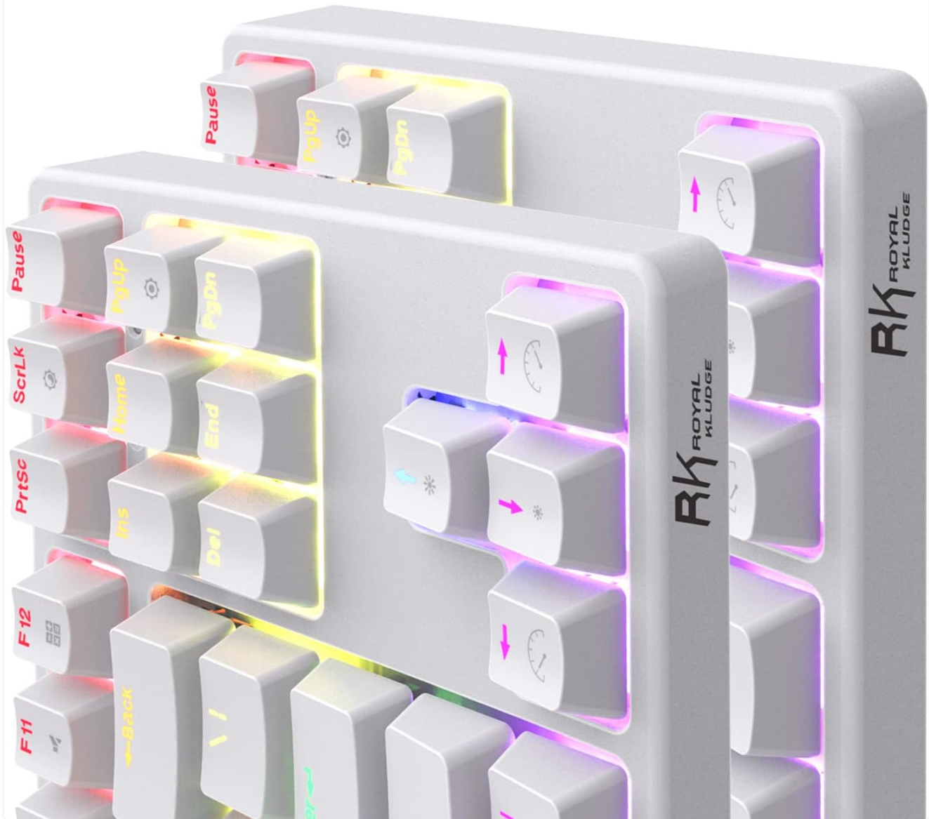
Image: A detailed view of the keyboard's right side, demonstrating the vibrant and dynamic RGB illumination with various light effect modes.

20 RGB light effect modes meet all your moods