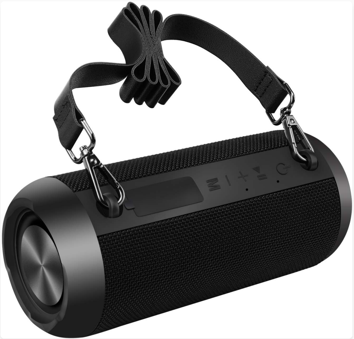
Image 1.1: The SENXINGYAN SXY-M2 Pro Portable Bluetooth Speaker with its carrying strap.