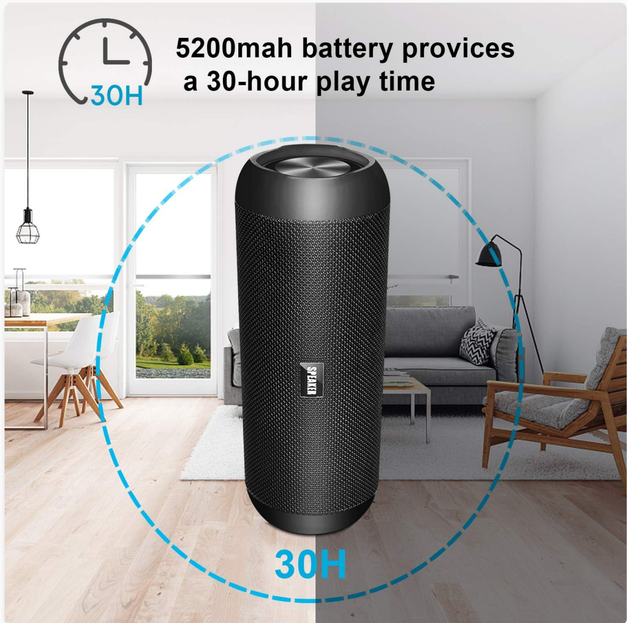
Image 4.1: The speaker's 5200mAh battery provides up to 30 hours of playtime.