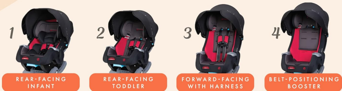
Figure 3.1: Visual guide to the four modes of use and corresponding weight limits.