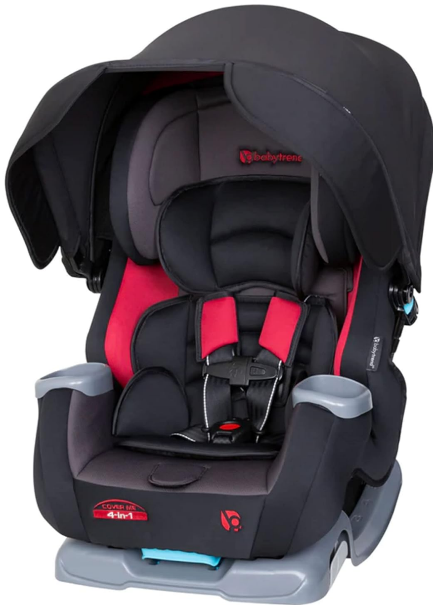
Figure 1.1: Baby Trend Cover Me 4-in-1 Convertible Car Seat (Scooter color).