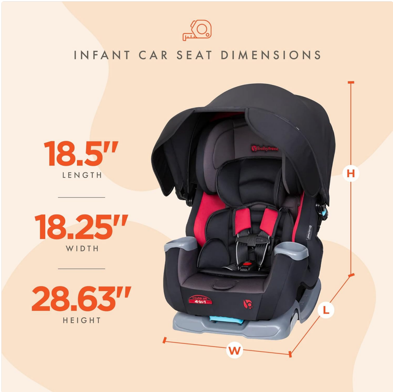
Figure 7.1: Product dimensions for the car seat.