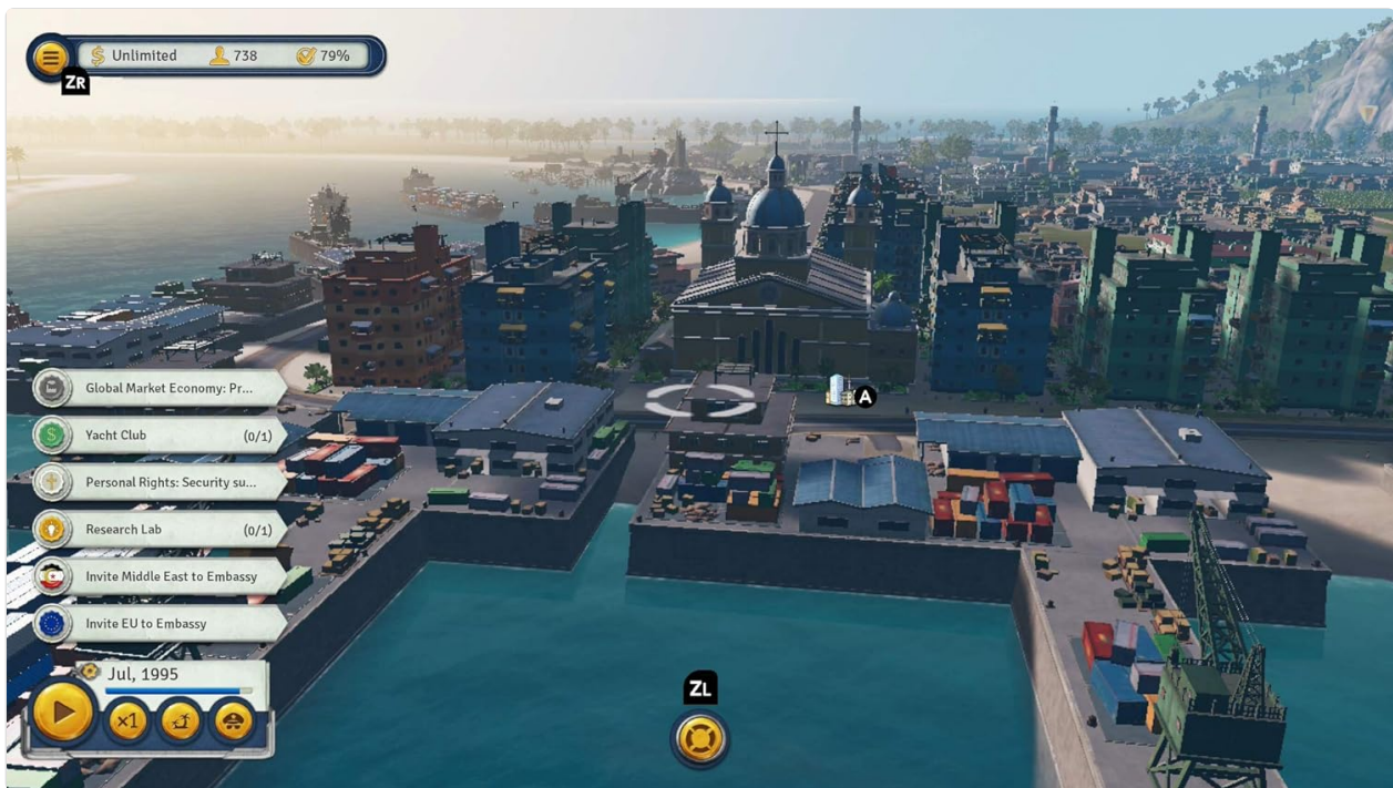
Image: A busy port area with cargo ships, shipping containers, and industrial structures, highlighting trade and logistics in Tropicico 6.