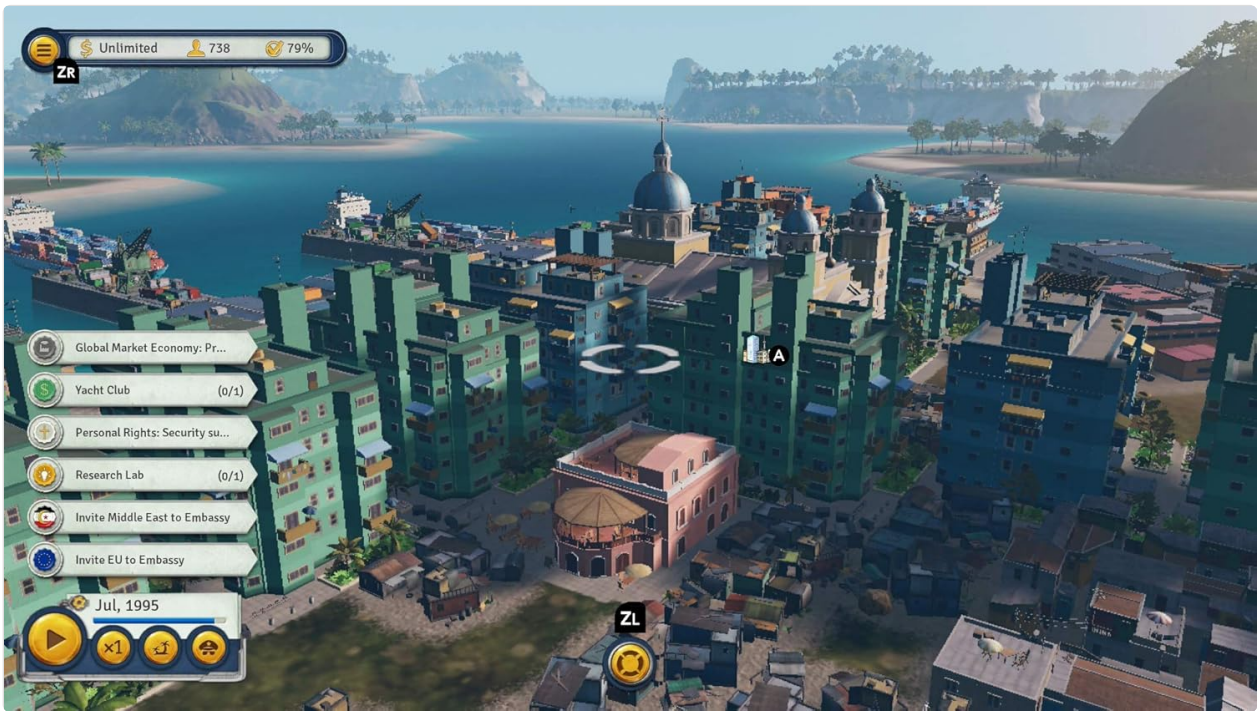
Image: A densely populated urban area featuring numerous multi-story buildings and a prominent church or cathedral, showing city density.