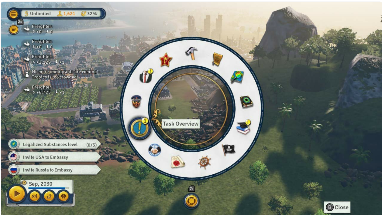
Image: The in-game task overview menu, displaying a circular selection of icons representing different administrative and gameplay functions.