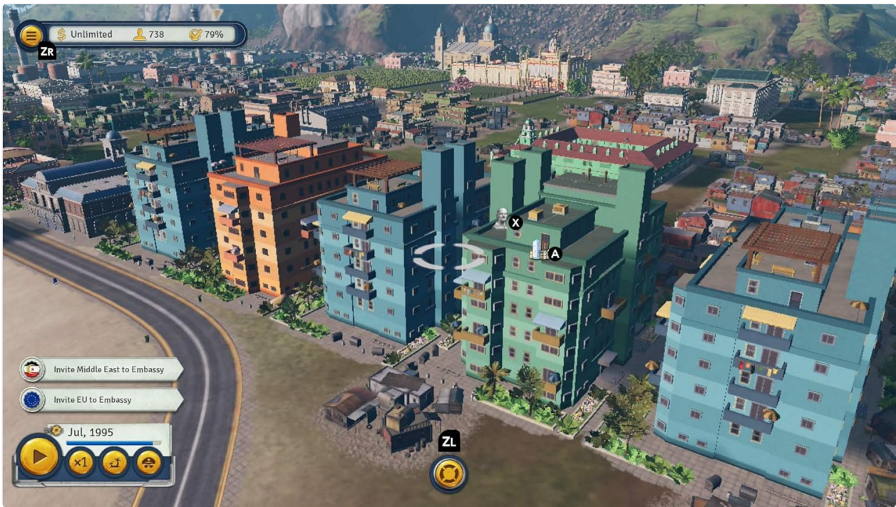
Image: A residential district featuring several apartment blocks, illustrating urban development in Tropic 6.