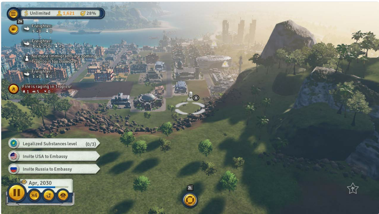
Image: A scenic view of mountainous terrain with scattered settlements, under a hazy sky, depicting the diverse environments in Tropico 6.