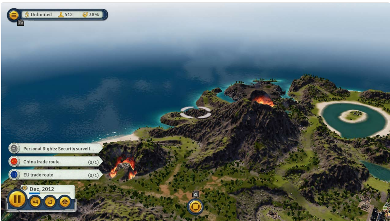
Image: A volcanic island with visible lava flows, illustrating the dynamic and sometimes hazardous environments in Tropico 6.