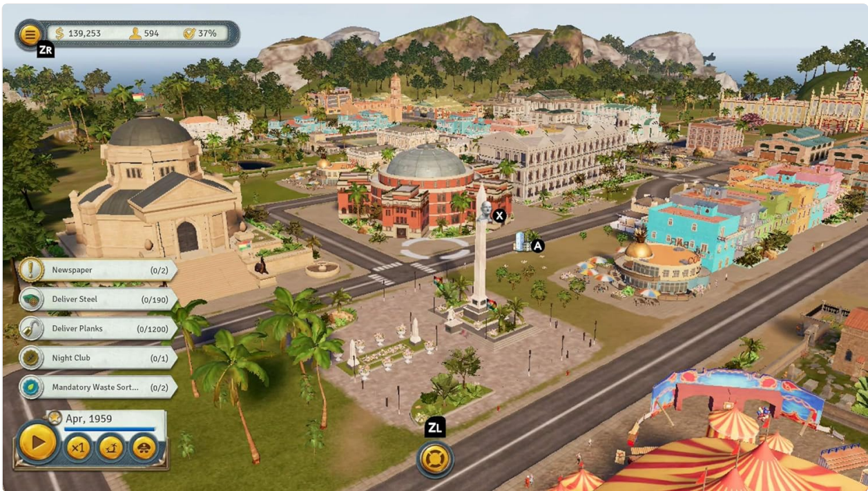
Image: A view of a developed city in Tropic 6, showcasing residential and commercial buildings, roads, and a central obelisk.