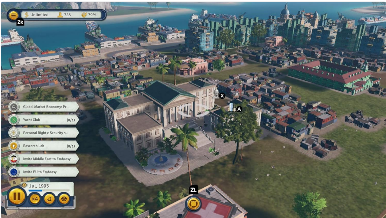
Image: A majestic government building or palace with a fountain, representing the seat of power in Tropico 6.