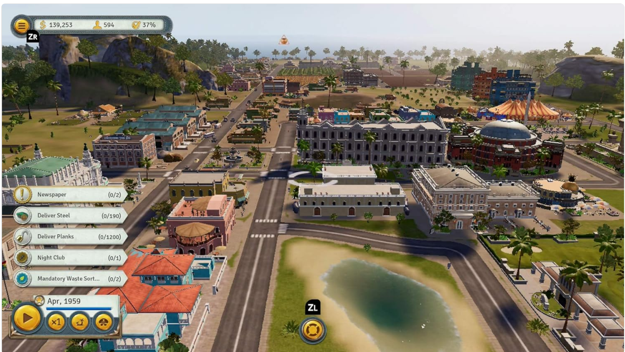
Image: A panoramic city view with a blend of housing and civic structures, set against a large body of water, illustrating coastal development.