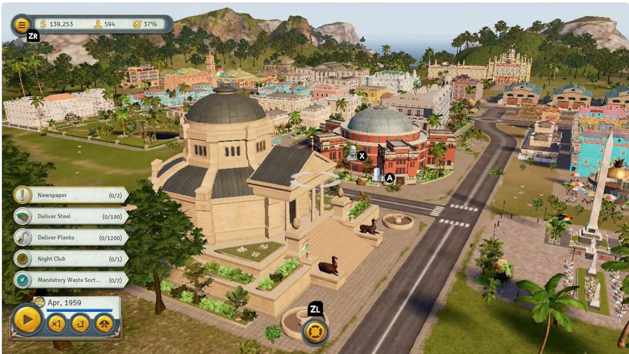
Image: A closer look at a grand building within the game, demonstrating the architectural detail of structures in Tropic 6.