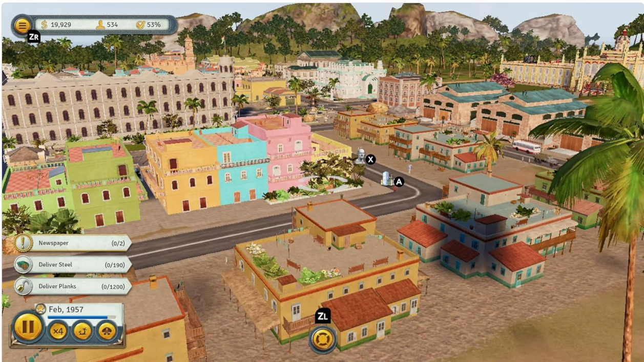
Image: A vibrant town square with diverse building styles and active citizens, reflecting the lively atmosphere of Tropic 6.