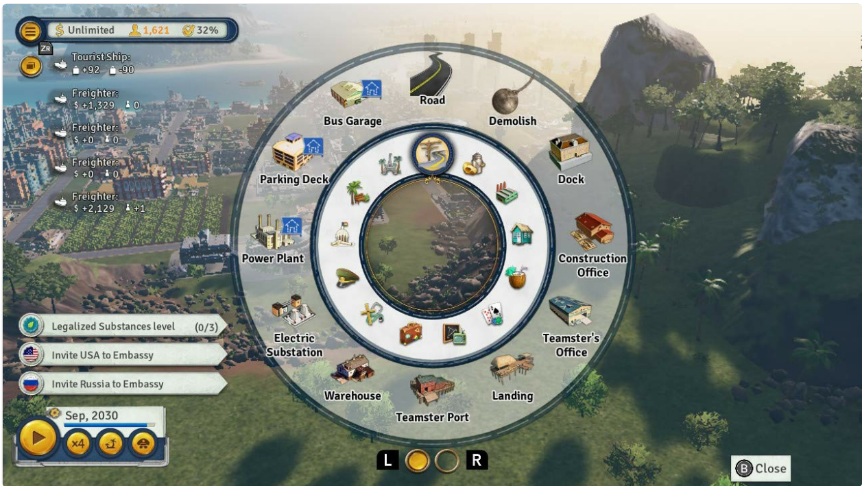
Image: The in-game construction menu, presenting a wide array of building options for urban planning and infrastructure development.