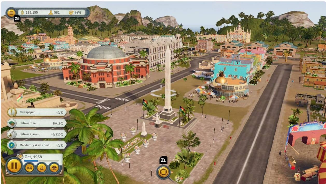
Image: An expansive city view centered around a large plaza, demonstrating the scale of urban planning in Tropico 6.