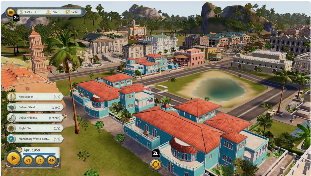
Image: A high-end residential district featuring large, elegant villas and a decorative pond, showcasing affluent areas in Tropico 6.