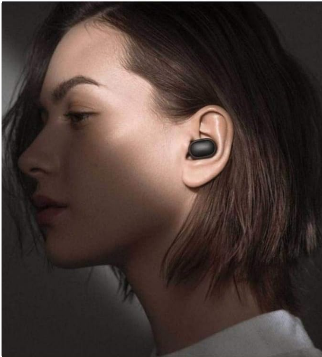
Image: A Xiaomi Mi True Wireless Earbud Basic 2 comfortably seated in a person's ear, demonstrating its compact design.

These earbuds are designed to be lightweight and comfortable for extended wear. They come with multiple sizes of silicone ear tips to ensure a secure and comfortable fit for different ear shapes. A proper fit is crucial for optimal sound quality and passive noise isolation.