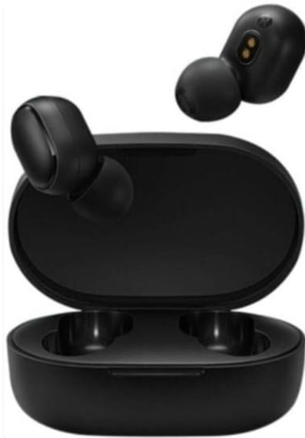
Image: The Xiaomi Mi True Wireless Earbuds Basic 2, showcasing both earbuds and their compact charging case.

The Xiaomi Mi True Wireless Earbuds Basic 2 offer a high-performance audio experience with advanced Bluetooth 5.0 technology. Designed for comfort and convenience, these earbuds provide seamless switching between single-ear and double-ear modes, clear call quality, and intuitive touch controls. With a lightweight design and extended battery life, they are ideal for daily use, whether for music, calls, or entertainment.