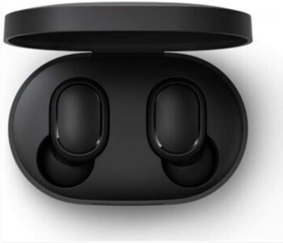
Image: Top-down view of the Xiaomi Mi True Wireless Earbuds Basic 2 securely placed within their charging case.

Before first use, ensure both the earbuds and the charging case are fully charged. Place the earbuds into the charging case. The indicator lights on the earbuds will show their charging status. The charging case itself can be charged using a standard micro USB cable (included). A full charge provides approximately 4 hours of continuous earbud use, with the charging case extending total battery life to about 12 hours.