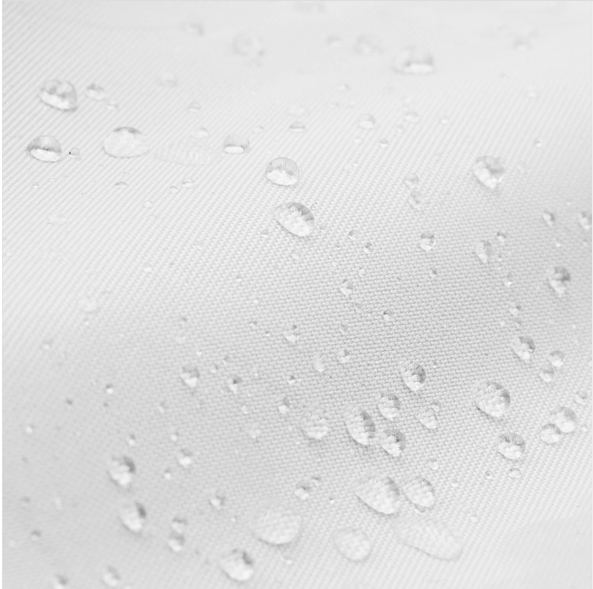
Image: A close-up view of the canopy's waterproof fabric, showing water droplets beading on the surface.