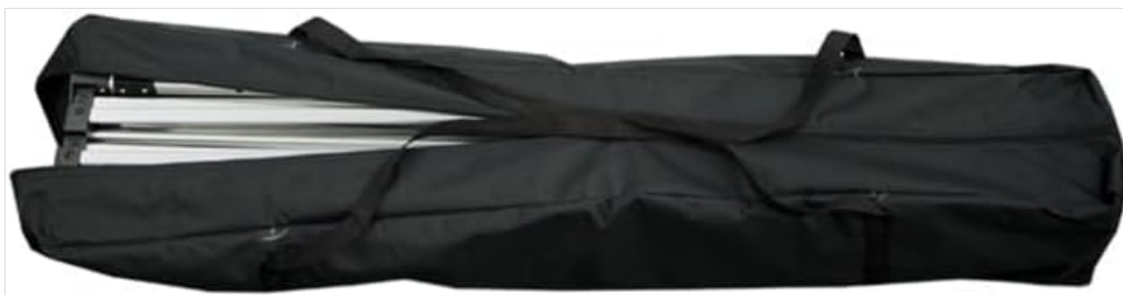
Image: The black carrying bag designed for convenient transport and storage of the folded canopy tent.