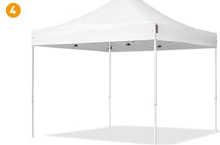
Image: Visual guide illustrating the four main steps of pop-up canopy assembly, from collapsed to fully erected frame.

Due to comprehensible assembly instructions, the pop up gazebo can be set up by 1-2 persons without complications. No tools needed. After setting up the frame construction, pull open lightly. Then cover with tarpaulin and pull open completely (add side panels if applicable).