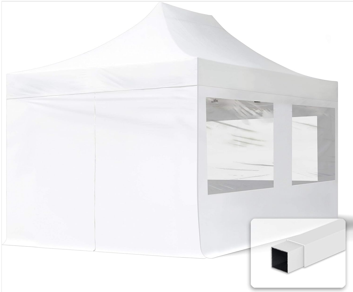
Image: A fully assembled white pop-up canopy tent, showcasing the sidewalls with panorama windows.

The included sidewalls can be attached to provide additional protection from wind, sun, or rain. They feature panorama windows for visibility. Attach them securely to the frame using the integrated fasteners.