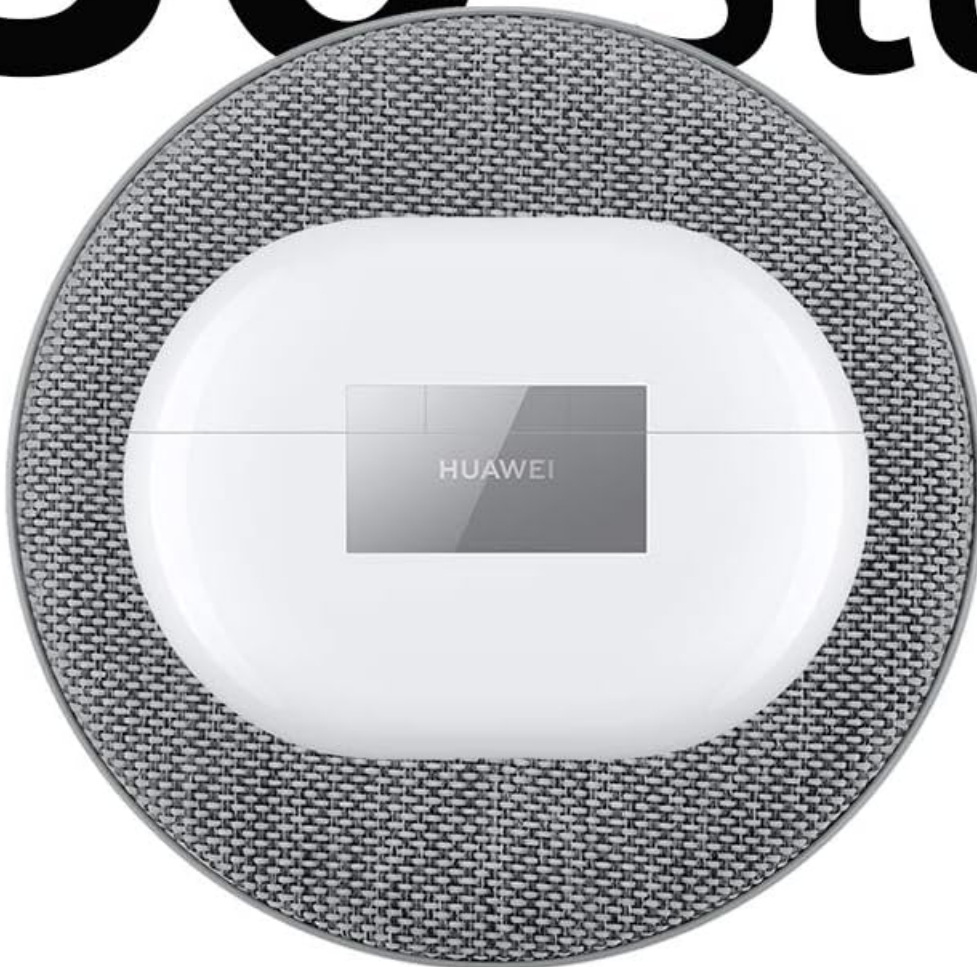
Image: The HUAWEI FreeBuds Pro charging case, illustrating its extended battery life of up to 36 hours with the case.