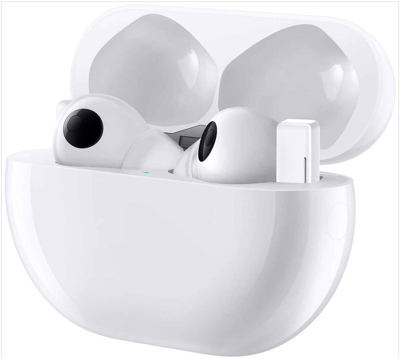
Image: HUAWEI FreeBuds Pro earbuds resting inside their open white charging case, showcasing the compact design.