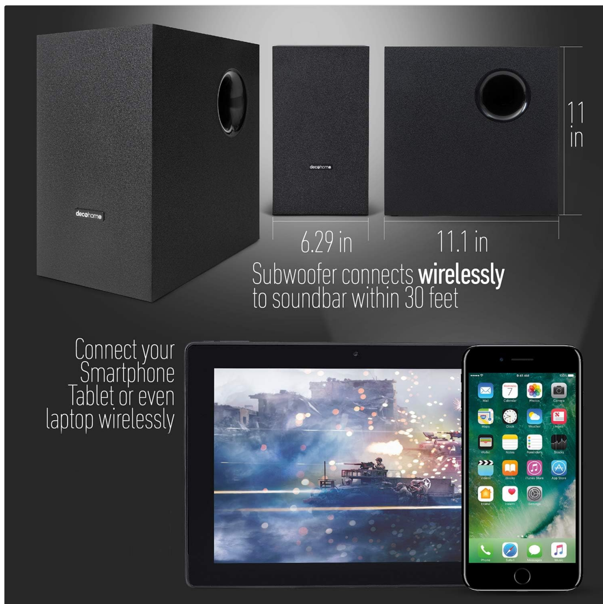
Image: A diagram illustrating the dimensions of the Deco Home soundbar and subwoofer, and indicating the wireless connection capability of the subwoofer.

both the soundbar and subwoofer into power outlets using their respective power cables. The subwoofer should automatically pair with the soundbar. If not, refer to the soundbar's specific pairing instructions.