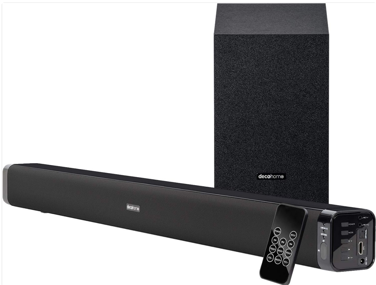
Image: The Deco Home 60W Soundbar and its wireless subwoofer, accompanied by a remote control.