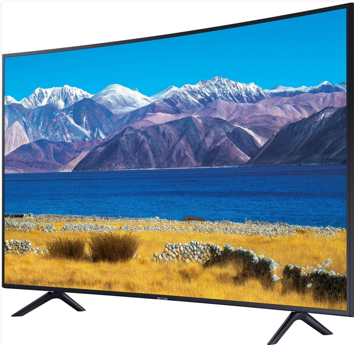
Image: Front view of the Samsung UN65TU8300 65-inch 4K UHD Smart Curved TV, showcasing its curved screen and slim bezels.