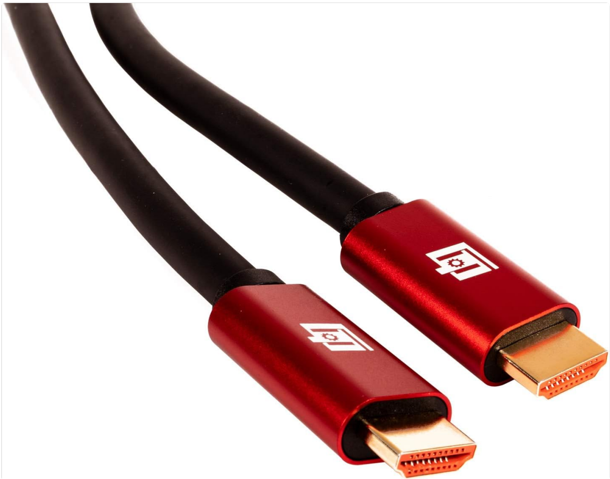
Image: Two 6-foot Universal 4K HDMI 2.0 cables with distinctive red connectors.