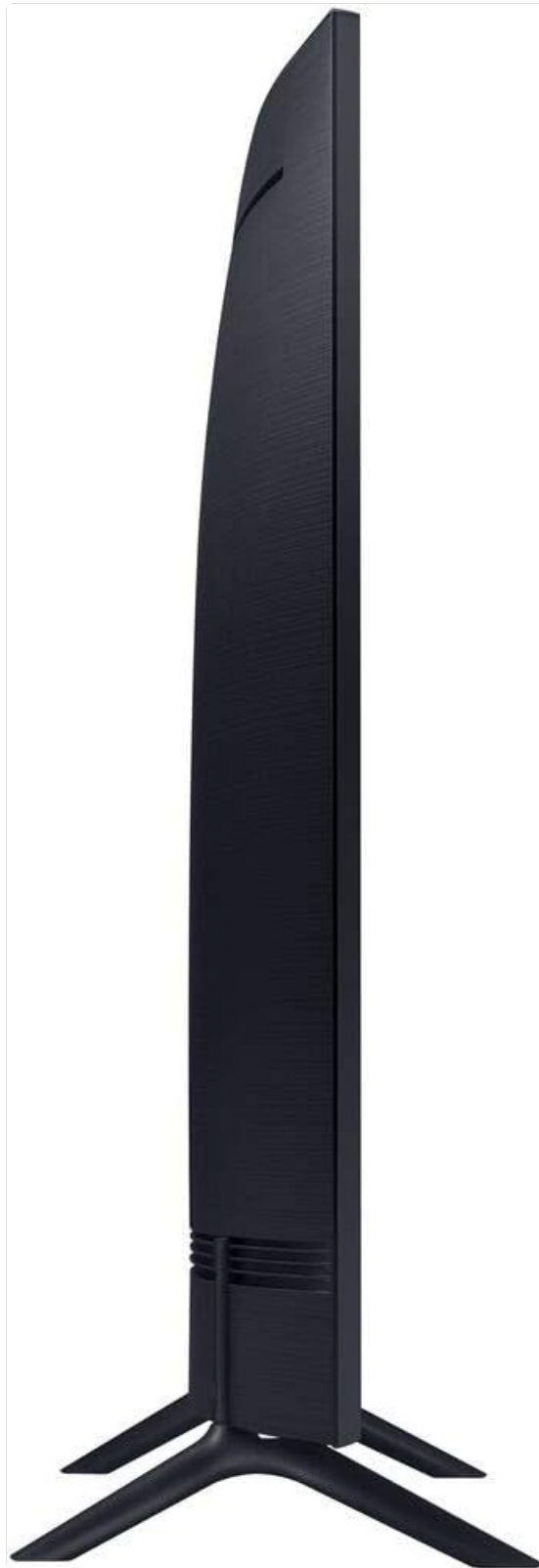
Image: Side profile of the Samsung UN65TU8300 Curved TV, illustrating its slim design and stand attachment.