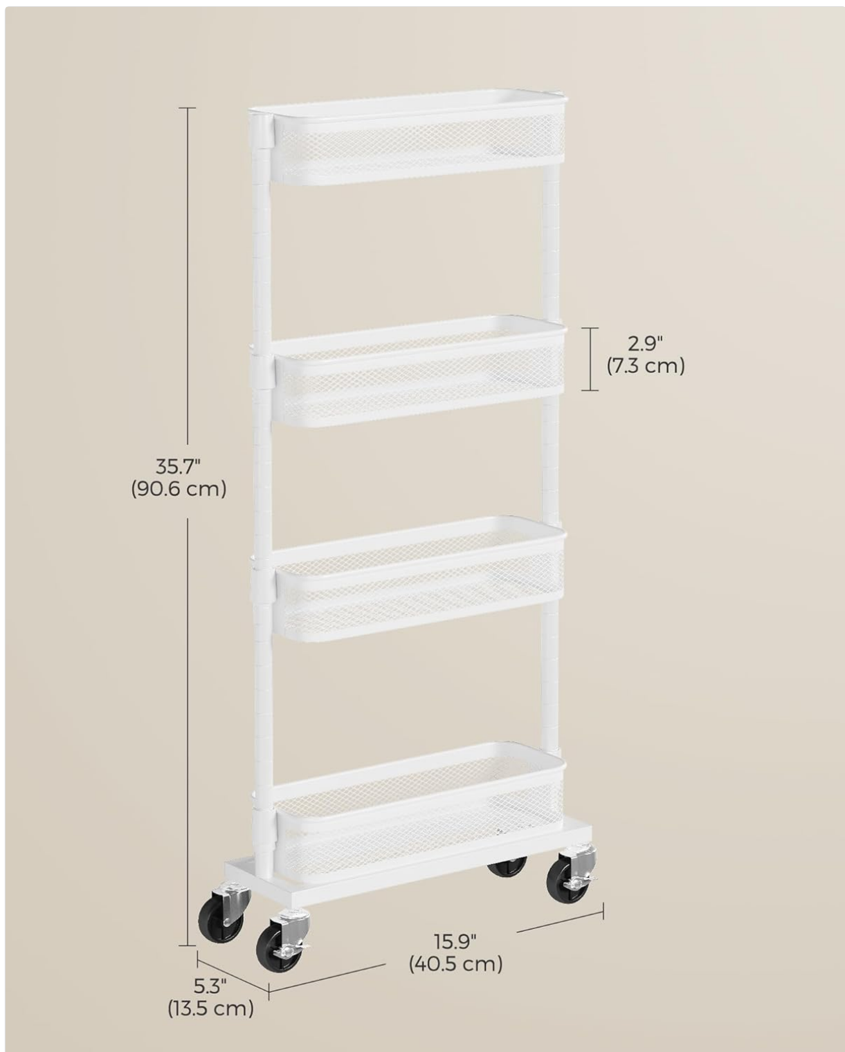
Image: A diagram showing the dimensions of the cart: 35.7 inches (90.6 cm) height, 5.3 inches (13.5 cm) width, and 15.9 inches (40.5 cm) depth.