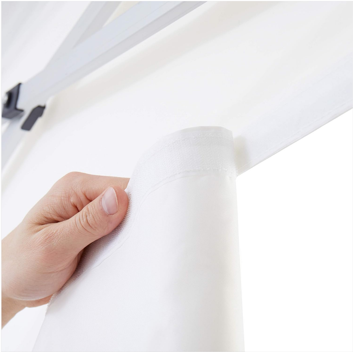
Figure 4.1: Attaching a sidewall to the canopy frame.