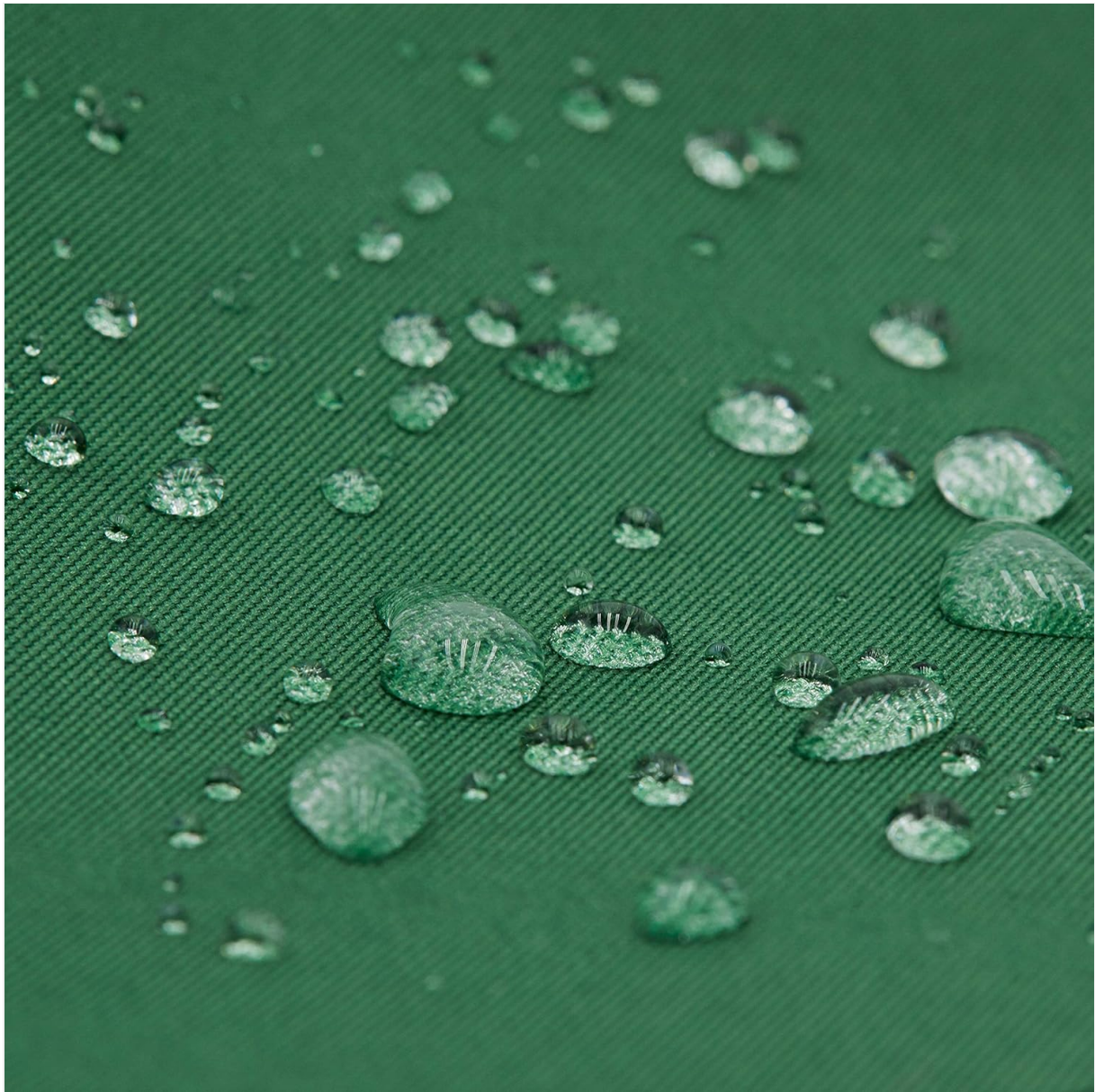
Figure 5.1: The waterproof tarpaulin material is easy to clean.