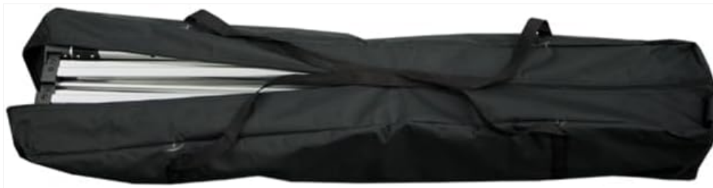
Figure 2.1: The convenient carrying bag for transport and storage of the canopy components.