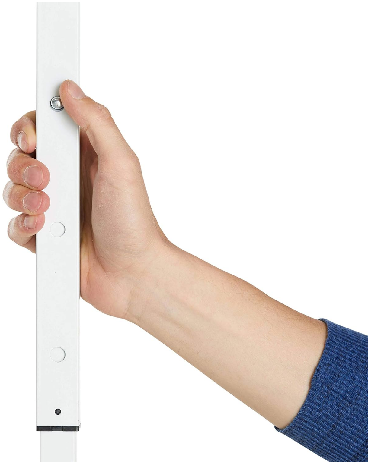
Figure 3.2: Adjusting the canopy leg height using the click system.