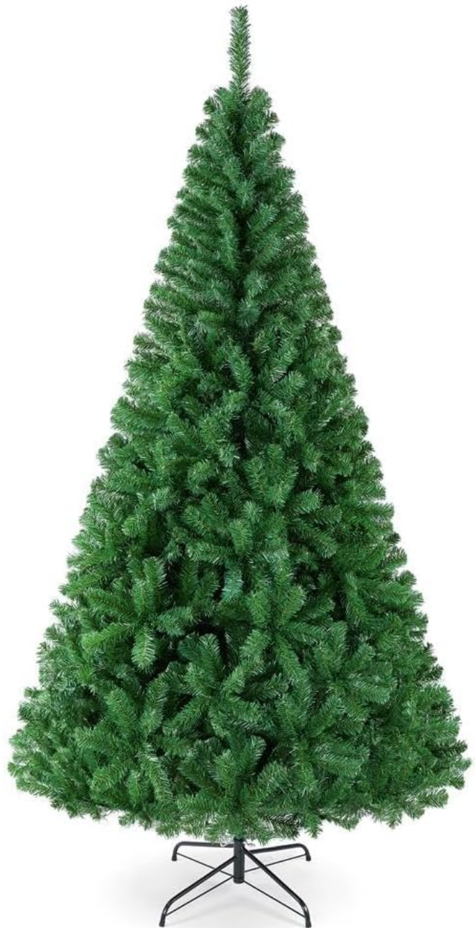
Image: Overview of tree components including simple set-up, quality materials, and the foldable metal stand.