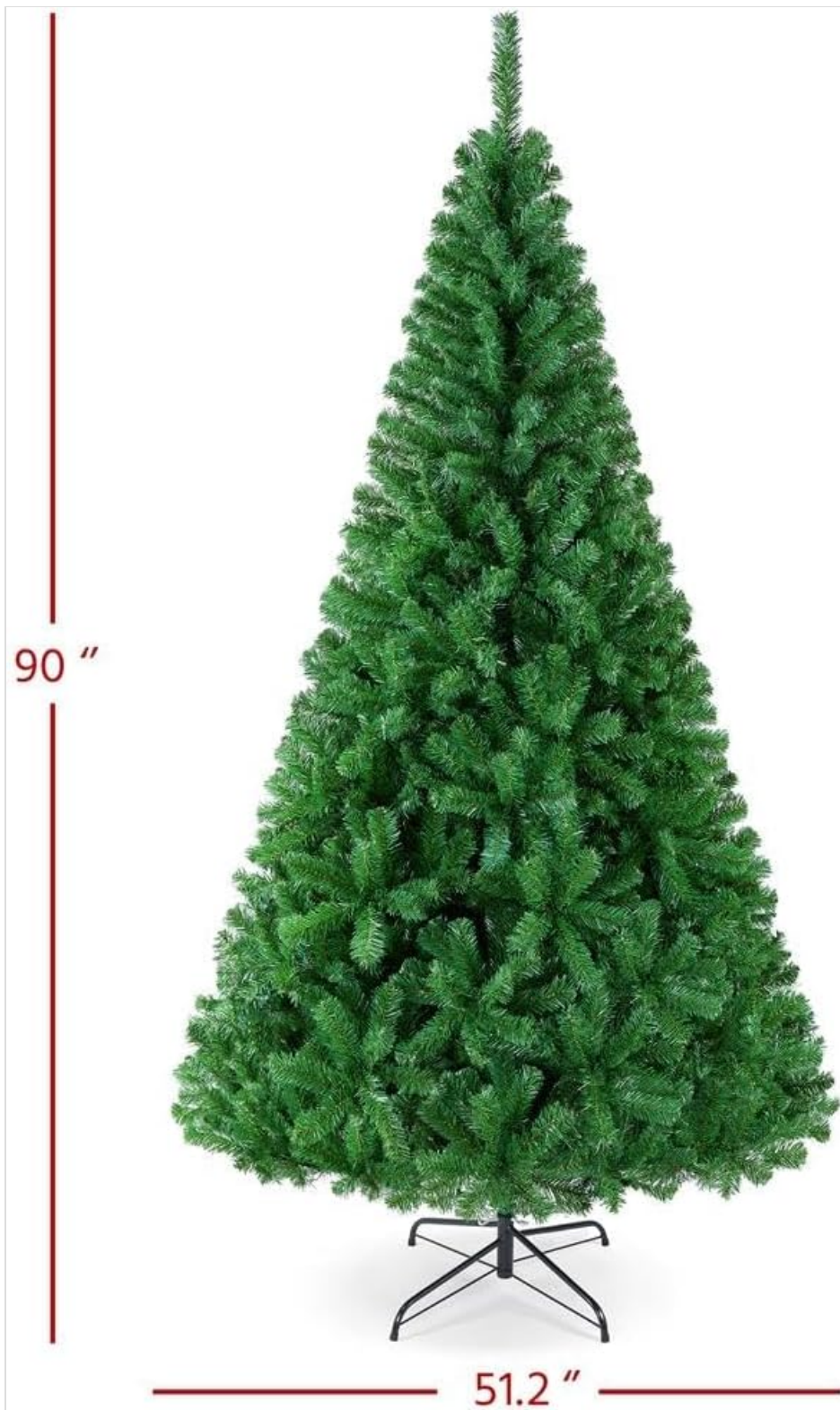
Image: Tree dimensions (Height: 90 inches, Base Width: 51.2 inches).