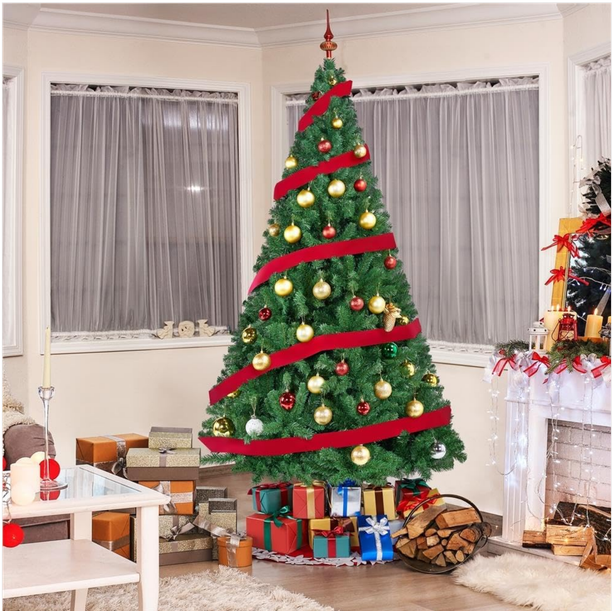
Image: An example of the tree fully decorated in a festive setting.

The lush spruce branches provide ample space for your chosen decorations and lights. You can customize the tree with various ornaments, garlands, and lighting to match your holiday theme. Ensure decorations are evenly distributed and do not place excessive weight on any single branch.