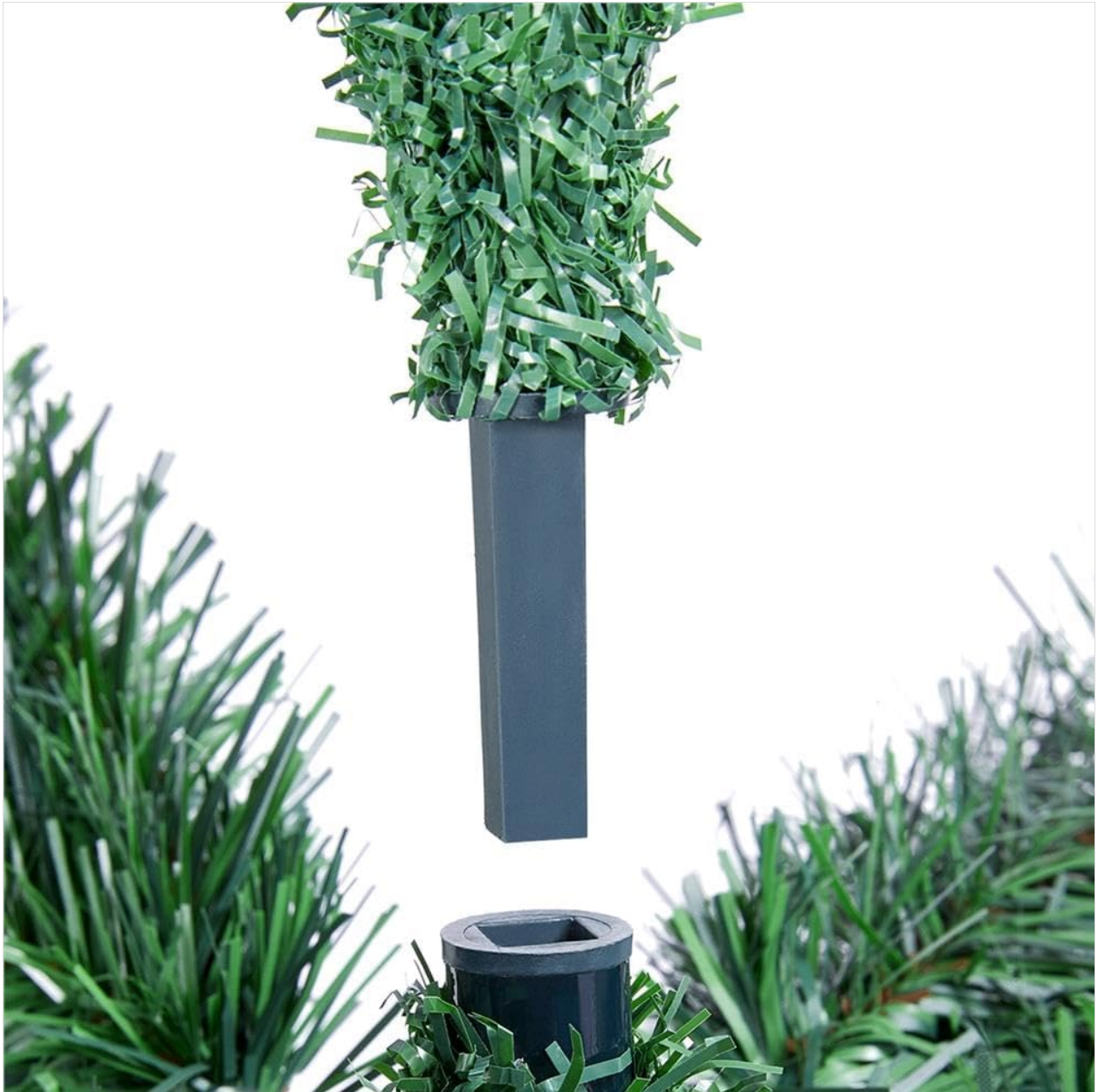
Image: Detail of the tree pole connection mechanism.

Start from the bottom section and work your way up. The fluffing procedure typically includes two steps: lifting the top tips and pulling out the side tips. This step is crucial for achieving the tree's intended fullness.