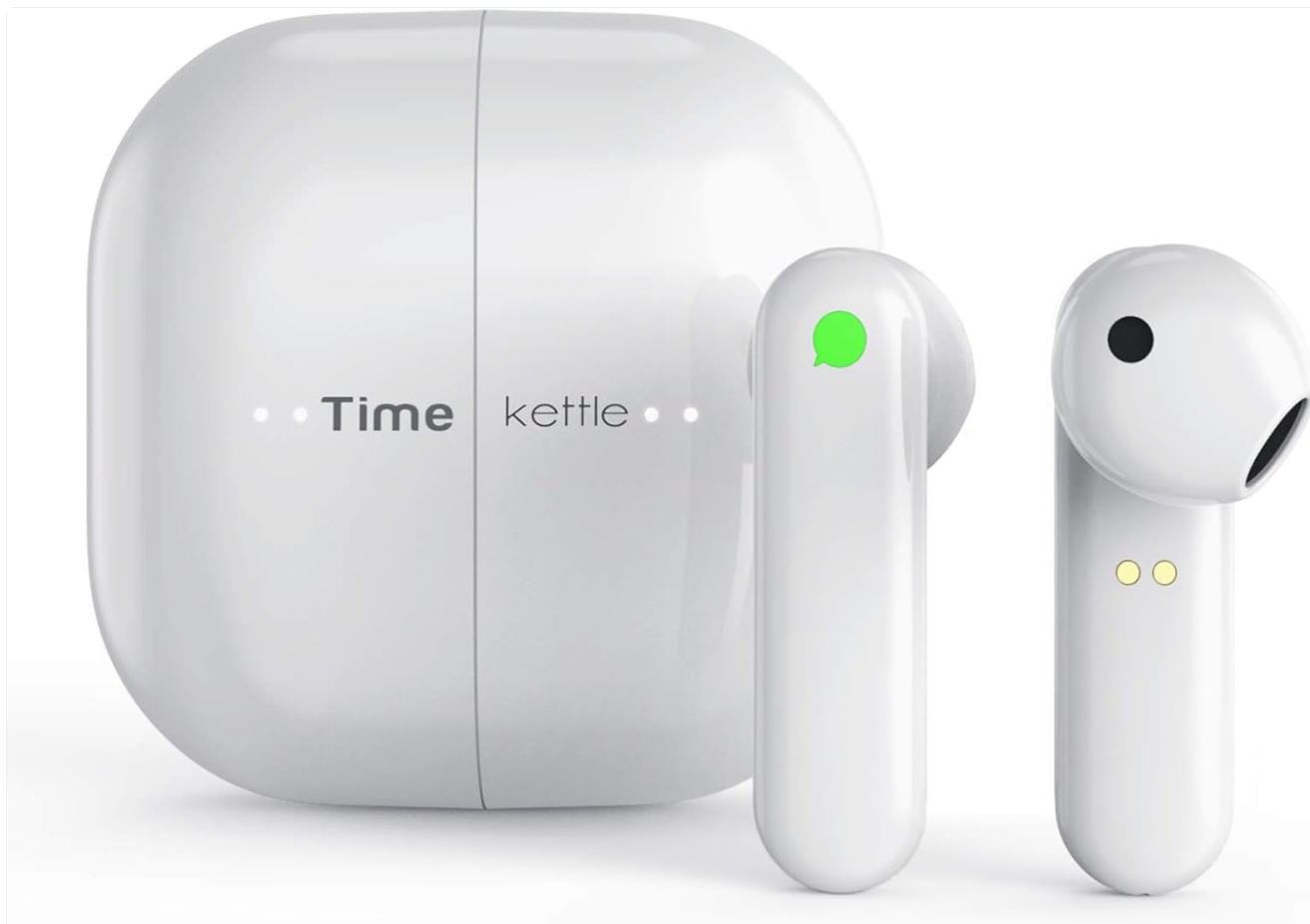
Image: Timekettle M2 Earbuds and their charging case.

The Timekettle M2 Language Translator Earbuds are innovative translation earbuds offering online 2-way translation for 40 languages and 93 accents. They also provide spectacular sound quality for music and calls, powered by Qualcomm aptX and Bluetooth 5.0 technology. Designed for travel, learning, business, or daily use, the M2 connects to 14 high-speed servers globally for an unparalleled translation experience. These true wireless earbuds ensure effortless communication without compromising audio quality.