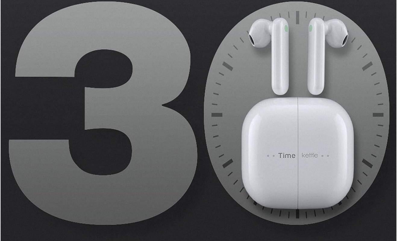
Image: Details the impressive battery life of the M2 earbuds and charging case.