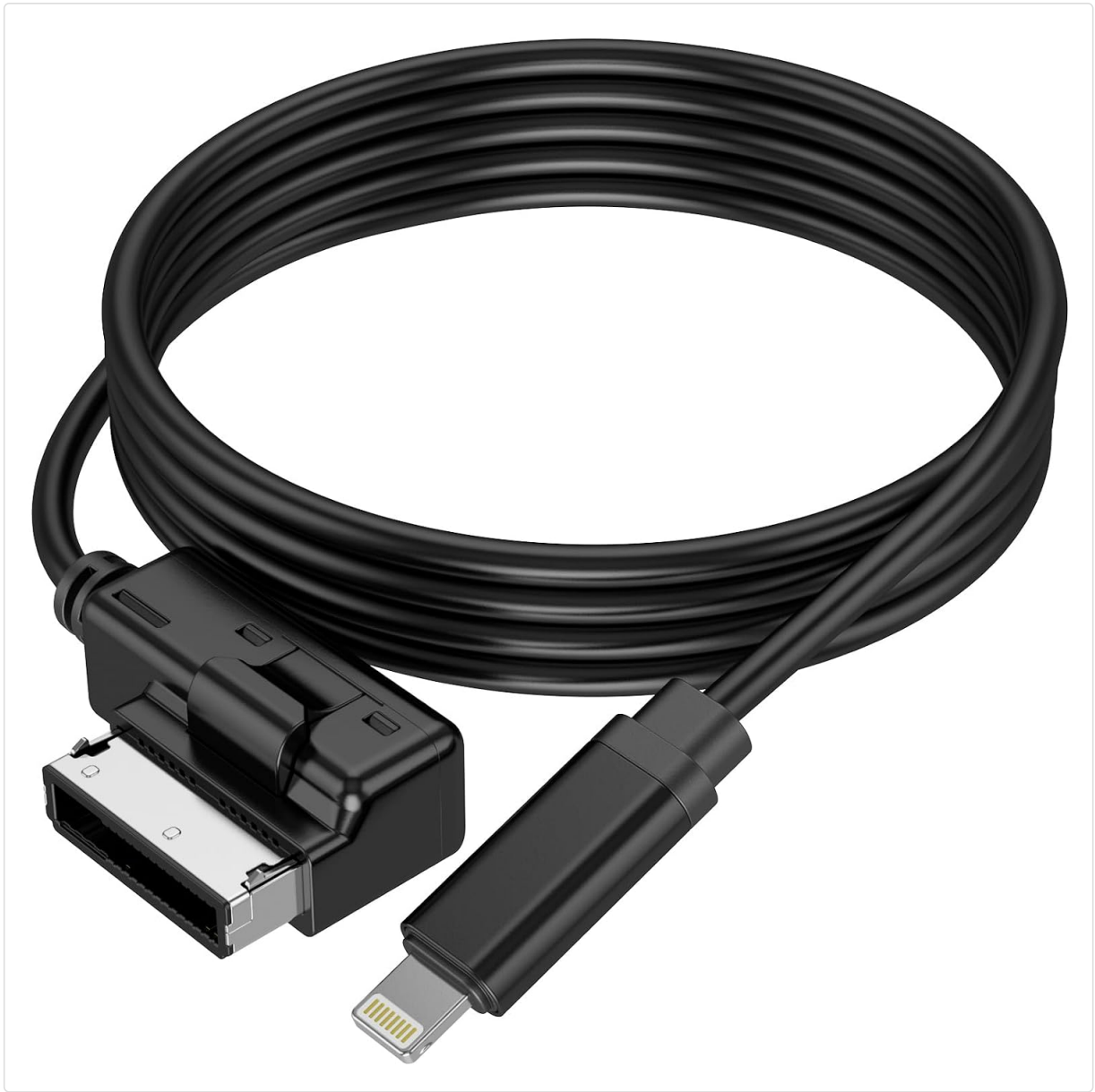
Figure 1: Dimfly AMI MMI Aux Cable, showing the AMI connector and the Lightning connector.