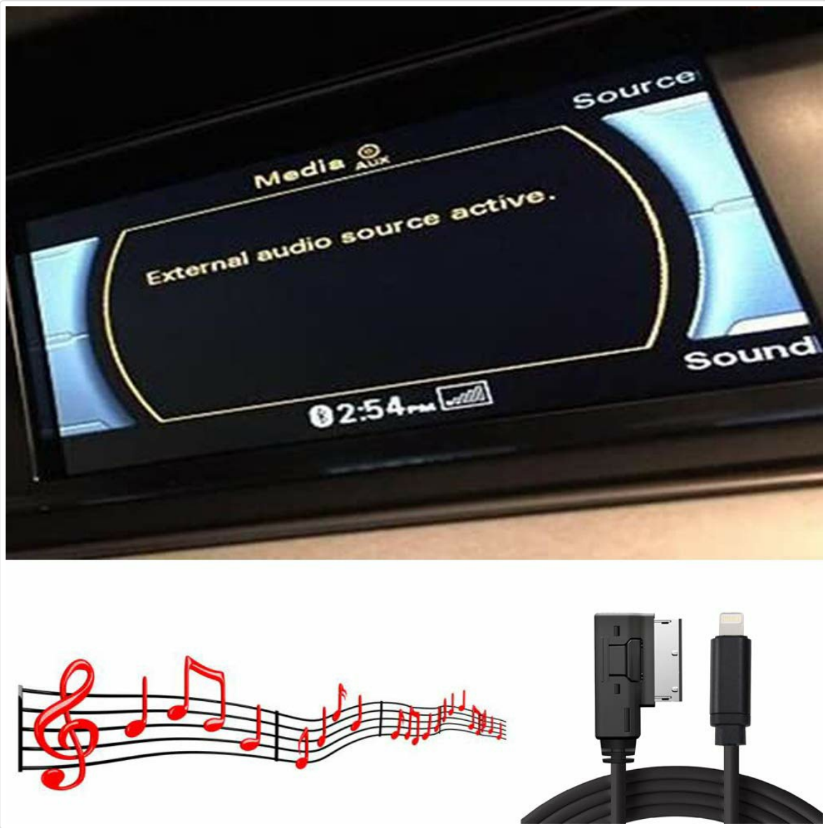
Figure 4: Car display indicating active external audio source.