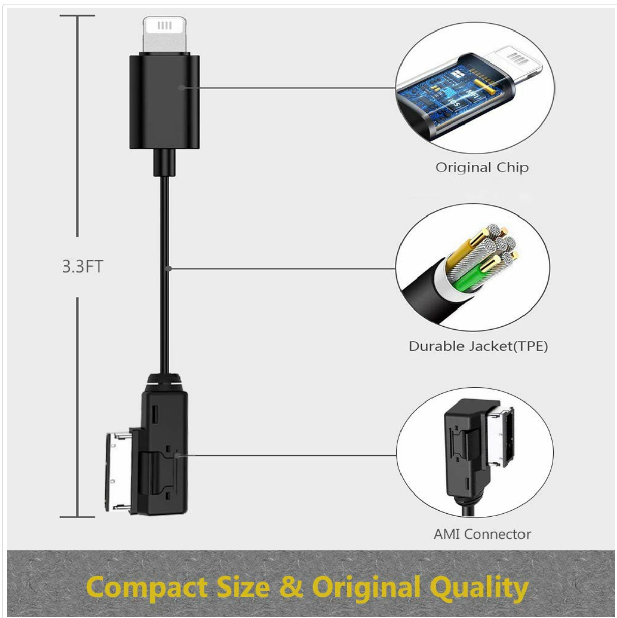
Figure 2: Cable components and dimensions. The cable is approximately 3.3 feet long and features an original chip and a durable TPE jacket.