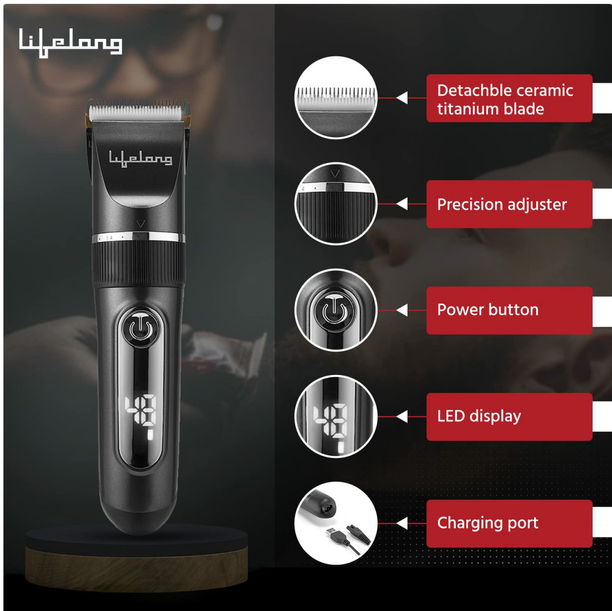
Figure 1: Lifelong LLPCM17 Ace Pro Hair Clipper