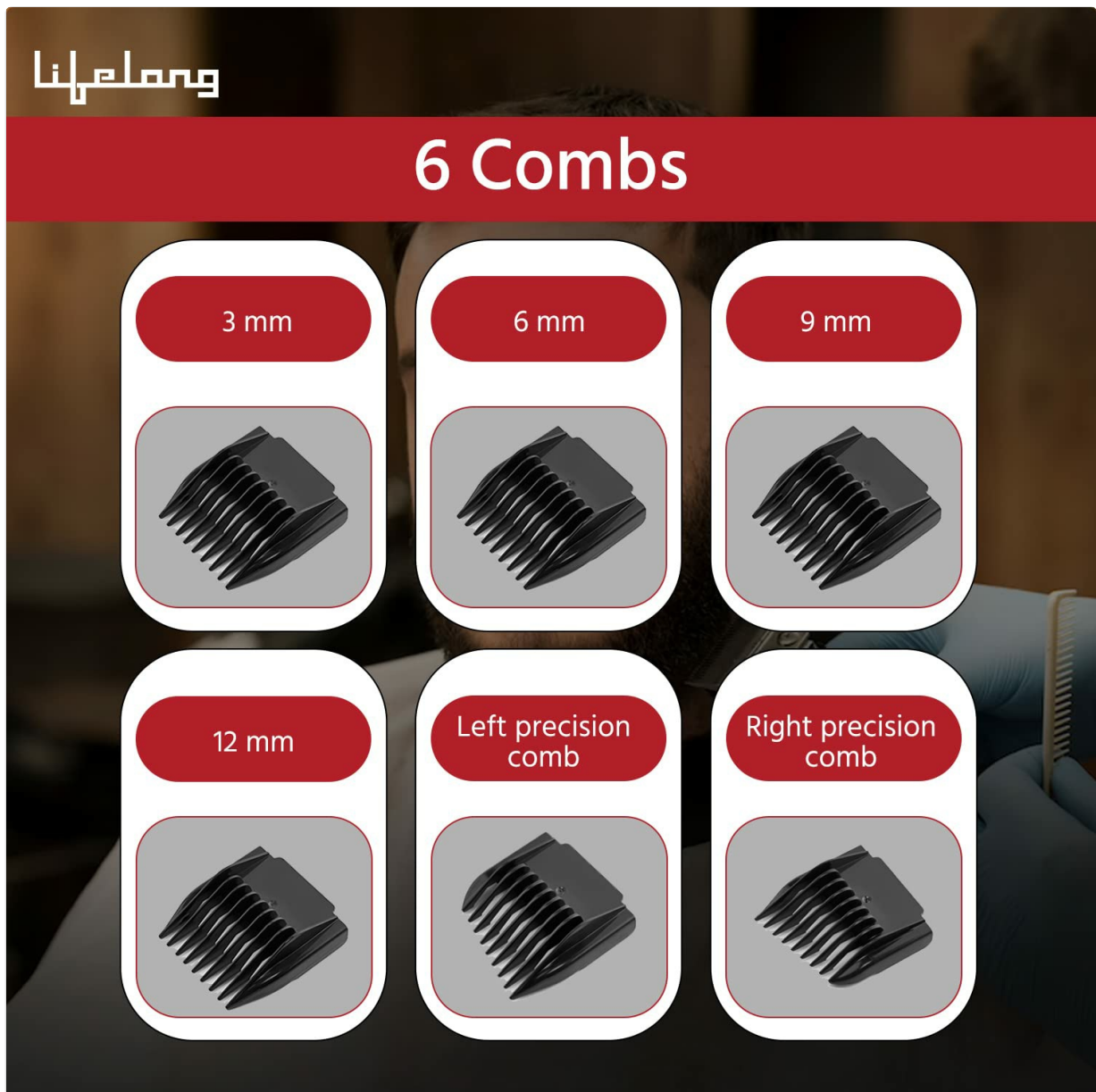
Figure 4: Included Guide Combs

To attach a comb, align the comb with the clipper blade and slide it on until it clicks into place. To remove, gently push the comb upwards from the back of the clipper.