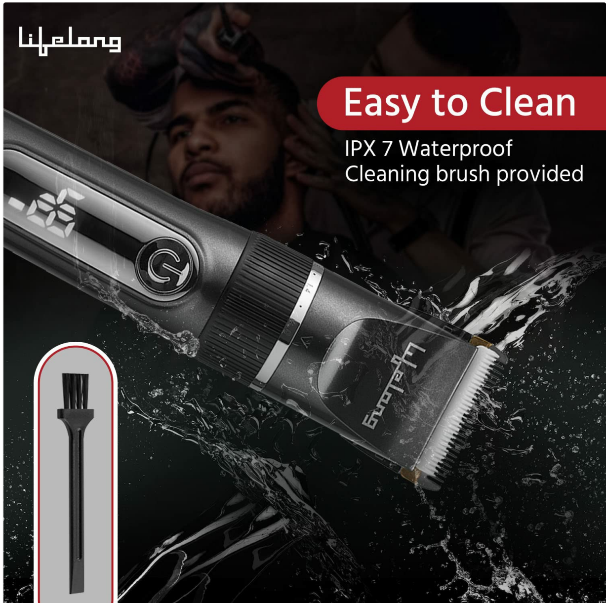
Figure 6: IPX7 Waterproof for easy cleaning