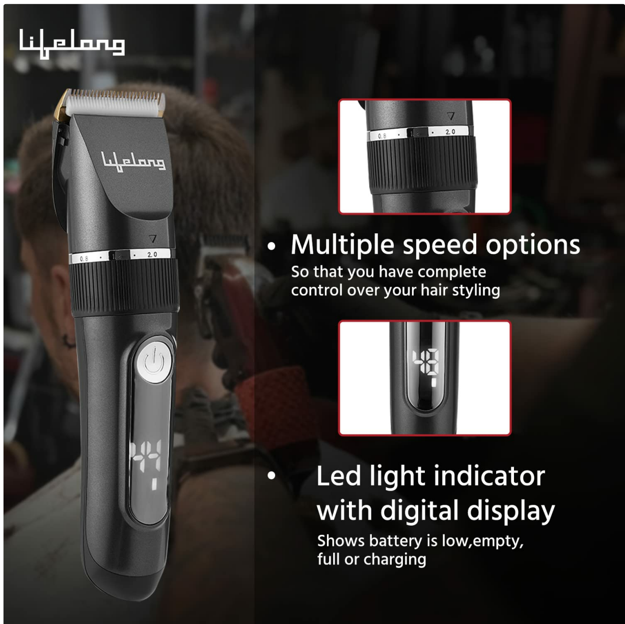
Figure 3: Digital LED Display and Speed Options