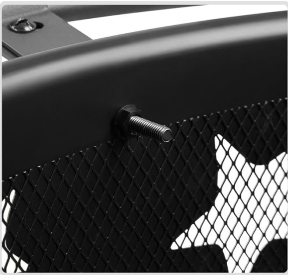
Beautiful cutouts on the side