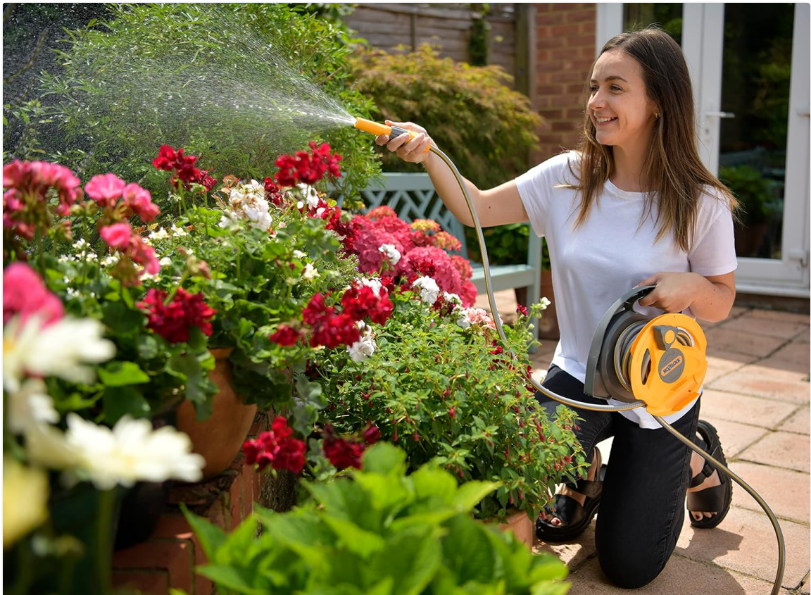
Figure 4: Watering plants with the Hozelock Micro Reel.

Once the desired hose length is unwound, turn on your water tap. Use the attached nozzle to control the water flow and spray pattern for your watering needs.