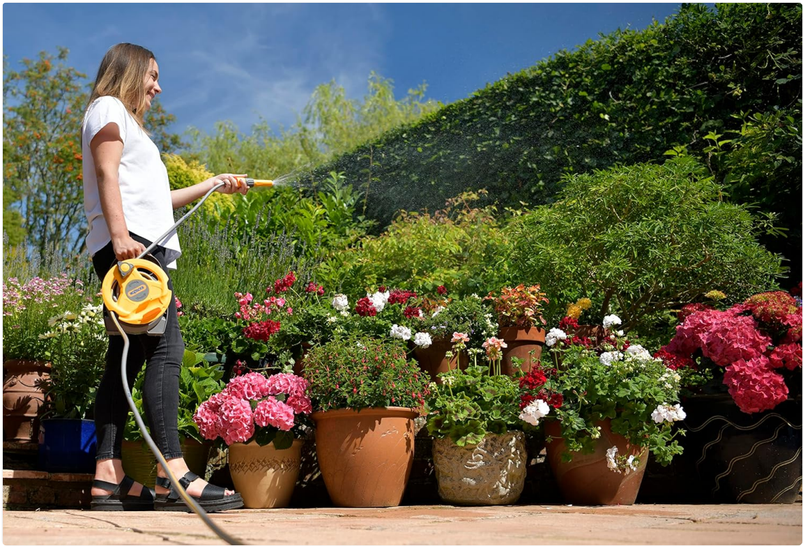
Figure 5: Demonstrating the reach and ease of use for watering various garden areas.