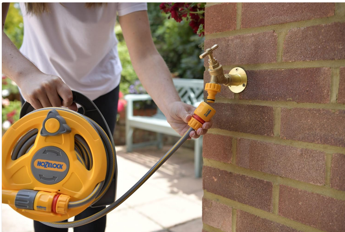
Figure 2: Connecting the hose reel to a water tap.