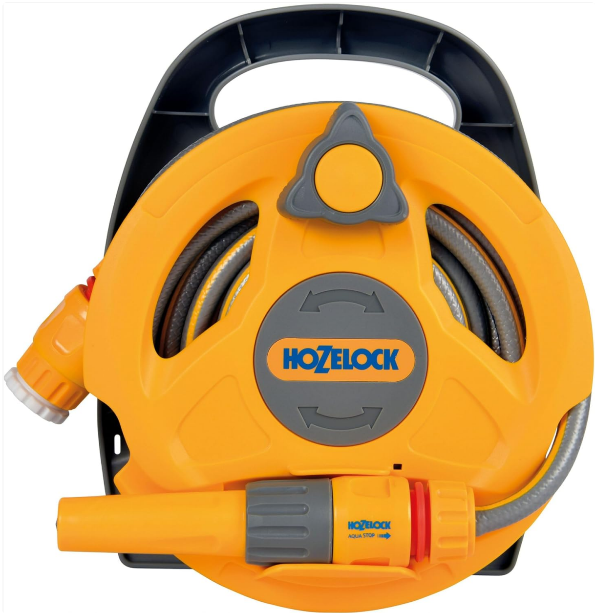
Figure 1: The Hozelock Micro Reel 10m, showcasing its compact design and integrated hose and nozzle.