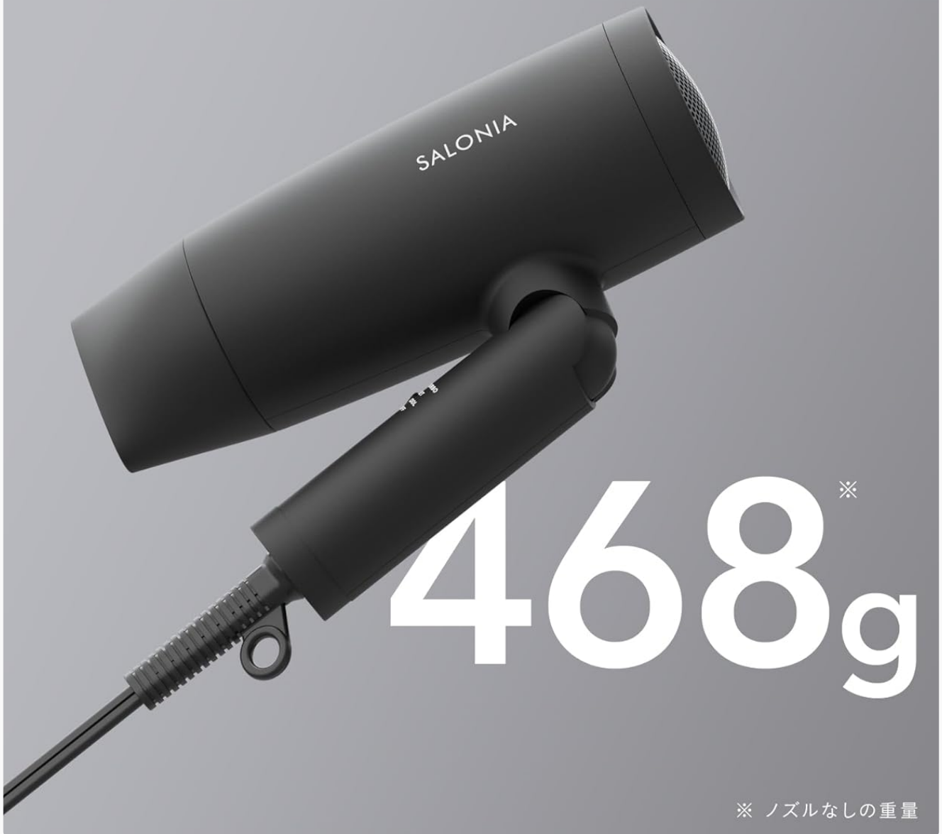
Image: The SALONIA hair dryer in its folded, compact state, with an overlay indicating its lightweight design at approximately 468 grams.