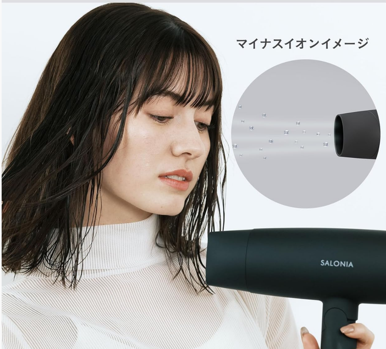
Image: An illustration showing negative ions being released from the dryer, which help to care for damaged hair and improve manageability.