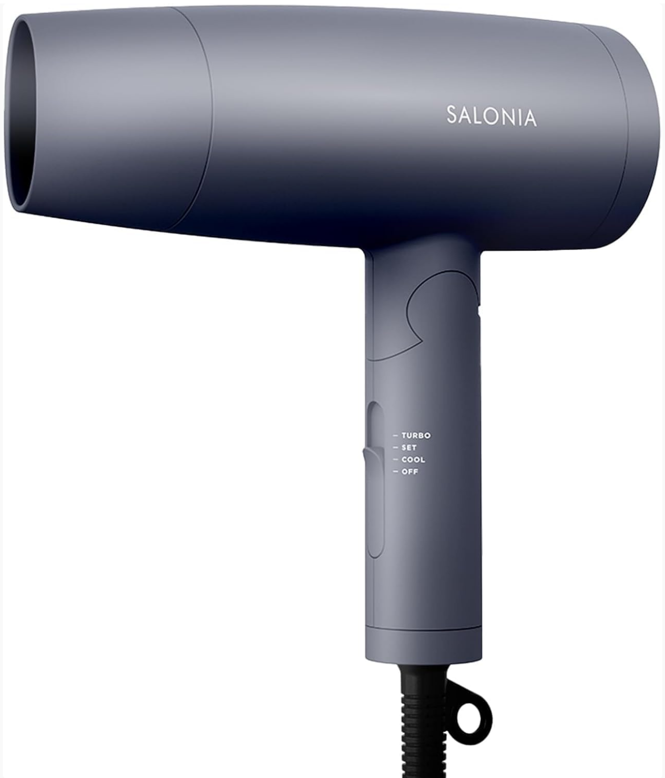
Image: The SALONIA Speedy Ion Hair Dryer in gray, showcasing its sleek and minimalist design.