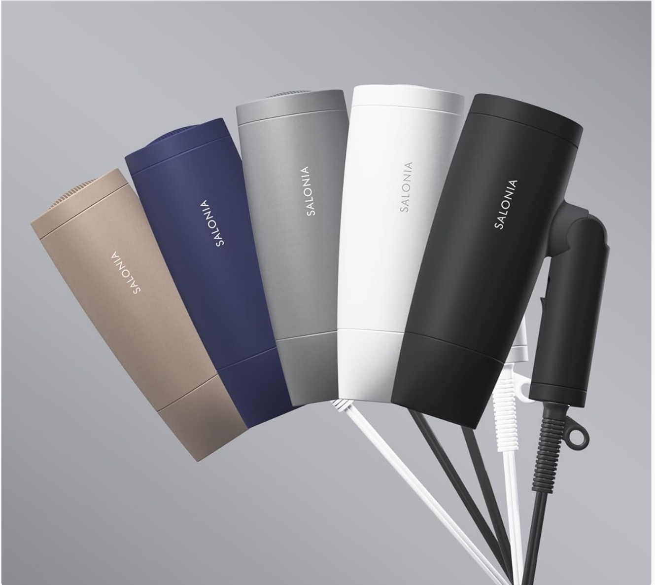
Image: Five SALONIA hair dryers displayed in various matte colors, illustrating the minimalist design and color options.

どんなライフスタイルにもなじむシンプルな デザインでマットな質感の5色のカラーリング