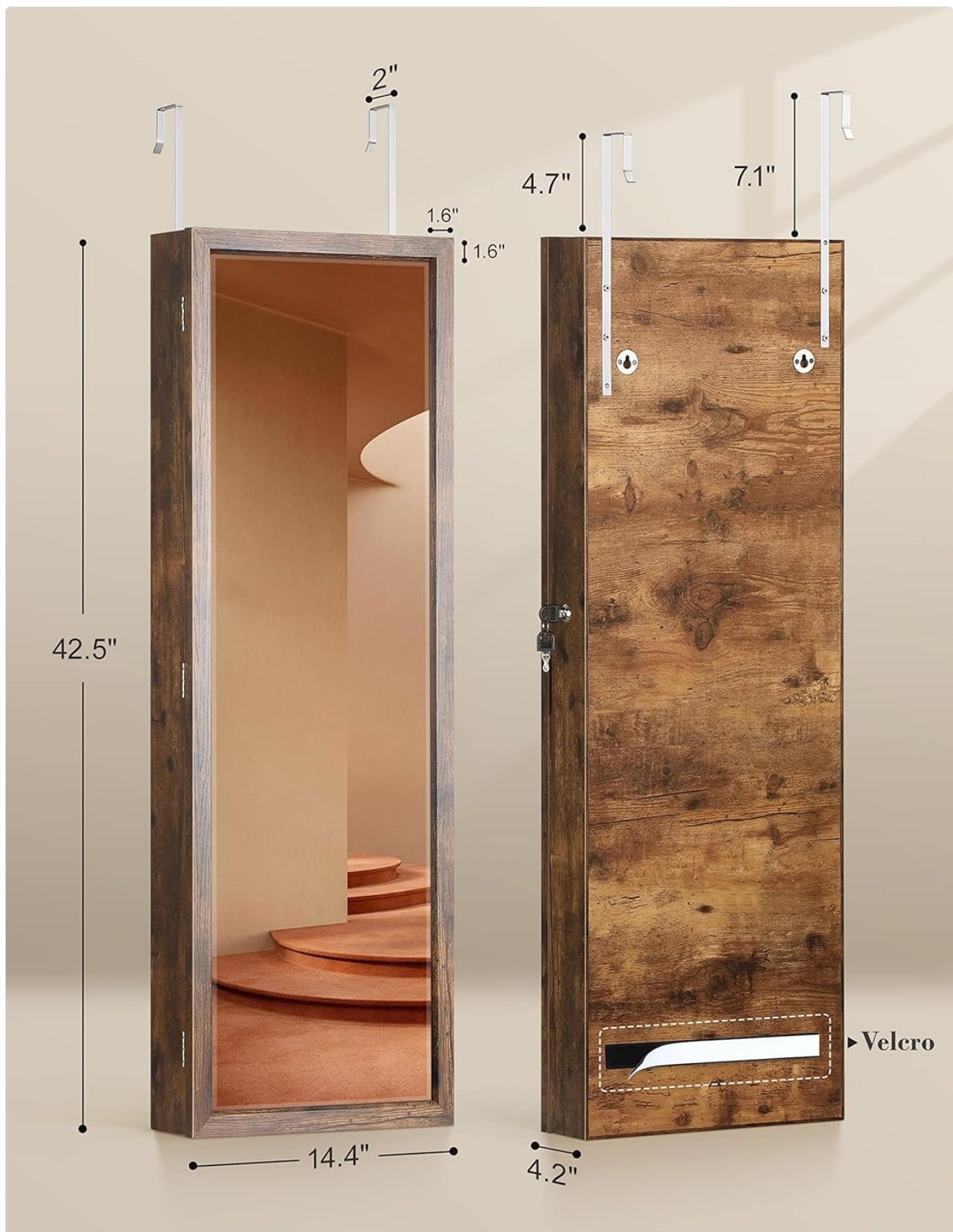
Image: A diagram illustrating the overall dimensions of the jewelry cabinet (42.5"H x 14.4"W x 4.17"D) and the two types of mounting hardware: over-the-door hooks and wall-mounting screws.