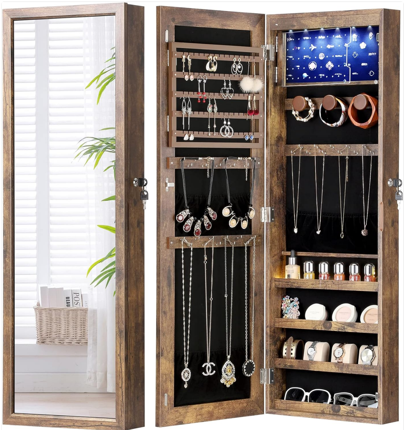
Image: The Nicetree Jewelry Cabinet in its open position, showcasing the various compartments for necklaces, rings, earrings, and other accessories, alongside its integrated full-length mirror.