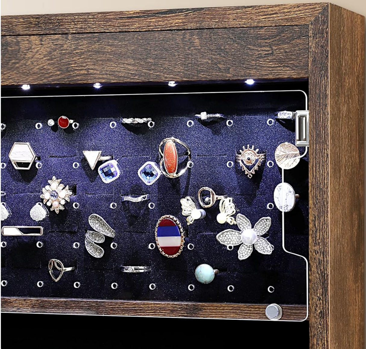
Image: A close-up view of the top interior of the cabinet, highlighting the six integrated LED lights that automatically activate when the door is opened.