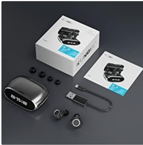
Image: KUNGIX BX13 Earbuds Package Contents. This image displays the charging case, two earbuds, a USB charging cable, three pairs of ear tips in different sizes, and the user manual, all neatly arranged.