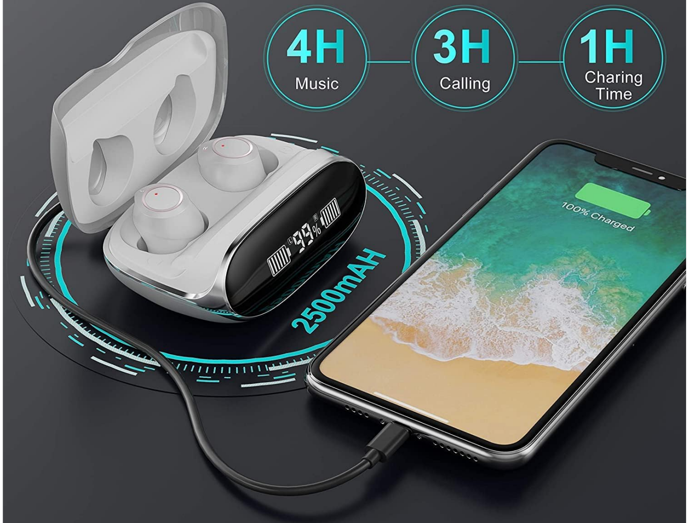
Image: KUNGIX BX13 Earbuds Charging and Playtime Information. This graphic illustrates the charging case with earbuds inside, connected to a phone for charging, and highlights 4 hours of music playback, 3 hours of calling, and 1 hour of charging time for the earbuds, with the 2500mAh case providing extended playtime.

Enjoy multiple movies, series, hundred songs without needing a charge strong enough to last from day to night