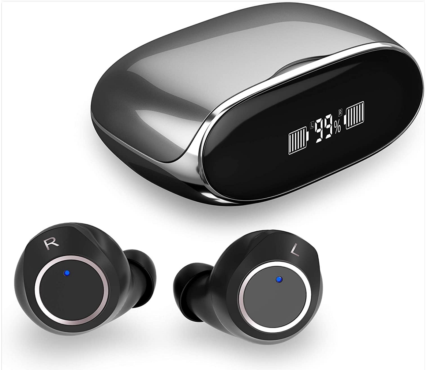
Image: KUNGIX BX13 Wireless Earbuds and Charging Case. This image shows the two black earbuds with blue LED indicators and a

Familiarize yourself with the components of your KUNGIX BX13 earbuds and charging case.