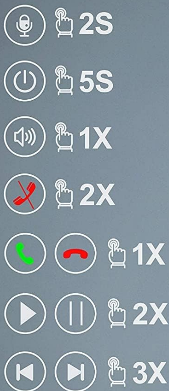
Image: KUNGIX BX13 Earbuds Smart Touch Controls Diagram. This diagram illustrates various touch gestures on the earbud for functions like activating voice assistant (2s), power on/off (5s), volume control (1x), rejecting calls (2x), answering/ending calls (1x), play/pause (2x), and next/previous track (3x).

Simply touch your earphone to control your phone calls, voice assistant, music, and more.