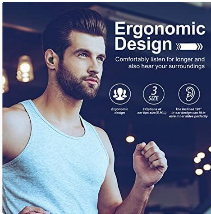
Image: KUNGIX BX13 Earbuds Ergonomic Design and Ear Tip Sizes. This image shows a person wearing the earbuds, highlighting the ergonomic design and mentioning the availability of 3 ear tip sizes (S, M, L) for a comfortable and secure fit.