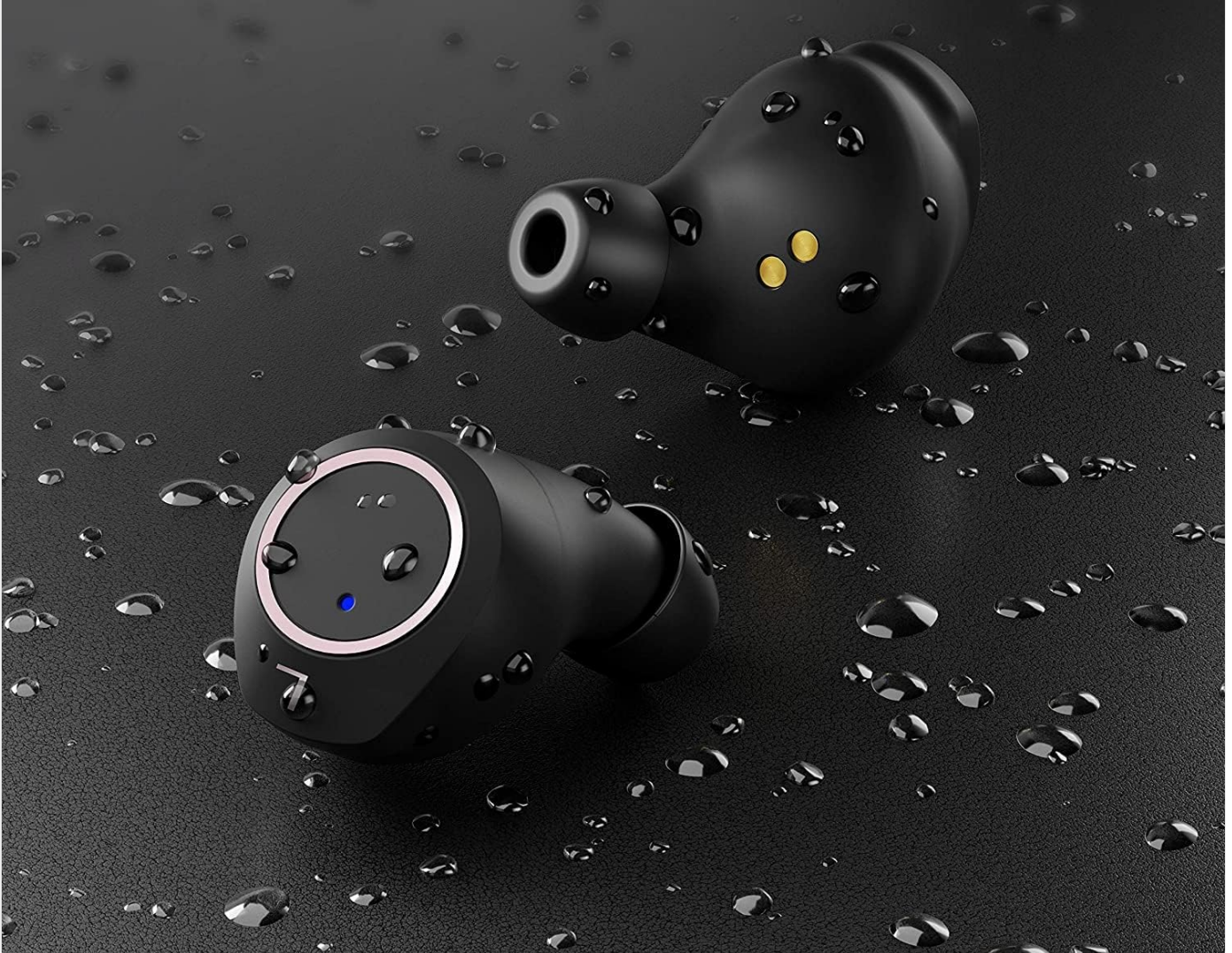
Image: KUNGIX BX13 Earbuds IPX7 Waterproof Feature. This image shows two earbuds on a wet surface with water droplets, demonstrating their resistance to sweat, accidental splashes, and light rain.