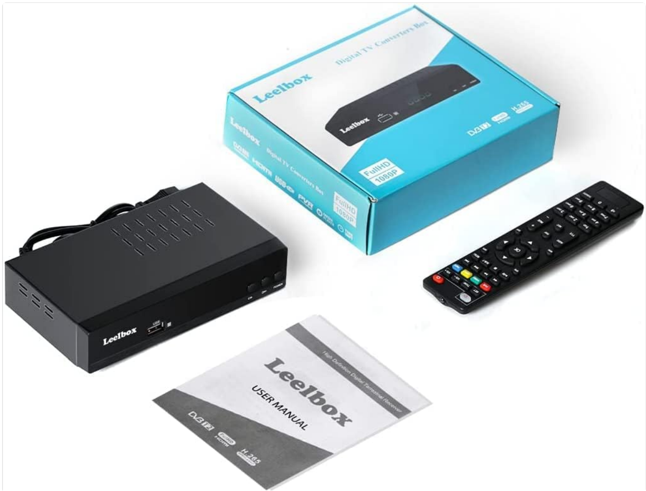
Image: Leelbox T2 package contents, showing the decoder unit, remote control, user manual, and product box.