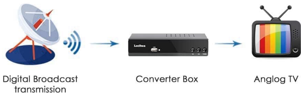
Image: Signal flow diagram showing how digital broadcast signals are received by the Leelbox T2 converter box and then output to an analog television, demonstrating HEVC Main10 compatibility.