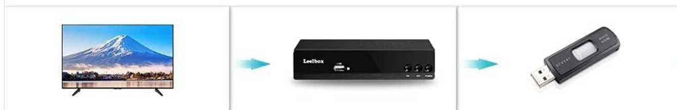
Image: Illustration of the PVR function, demonstrating how to record TV programs to a USB drive for later viewing.