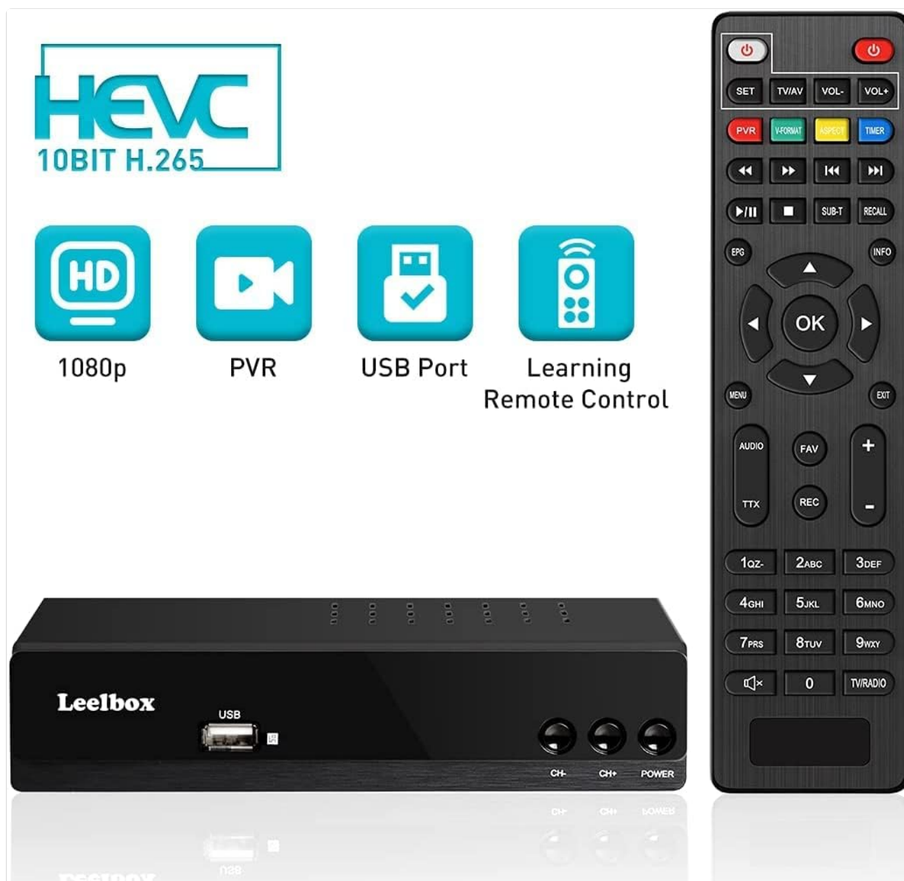
Image: The Leelbox T2 decoder alongside its remote control, illustrating the device's main capabilities.

The included remote control provides full functionality for the Leelbox T2. It also features a learning function, allowing you to program certain buttons to control your TV (e.g., Power, Volume, Input).