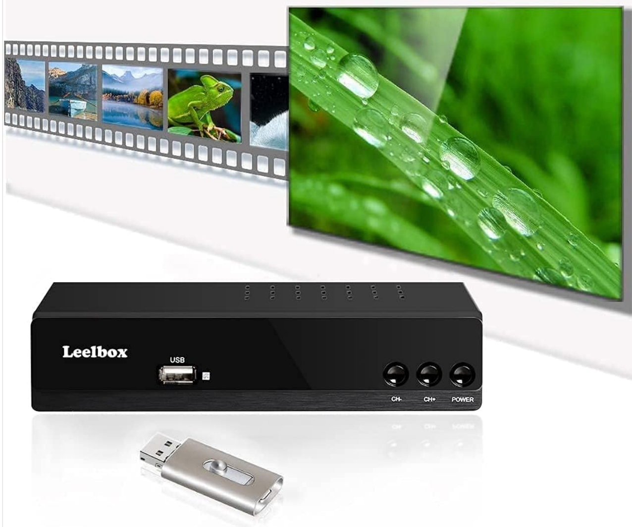
Image: The Leelbox T2 connected to a USB drive, demonstrating its capability to play back various media files directly on your television.

Playback media directly from your USB drive (not included)