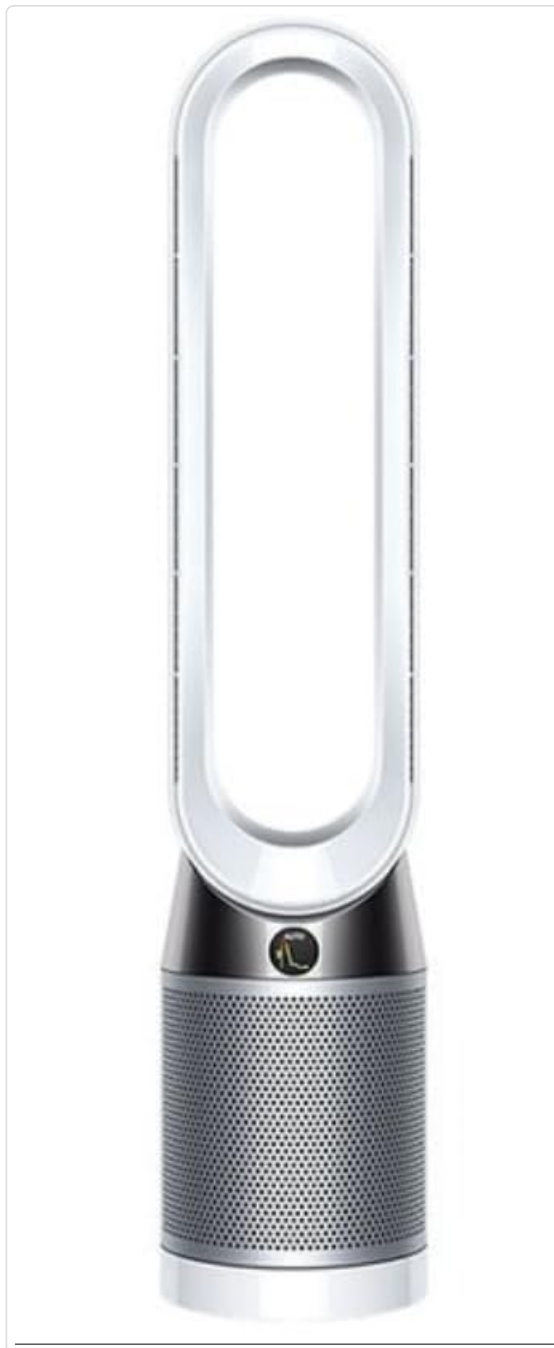
Figure 1: Front view of the Dyson TP04 Pure Cool Purifying Connected Tower Fan.