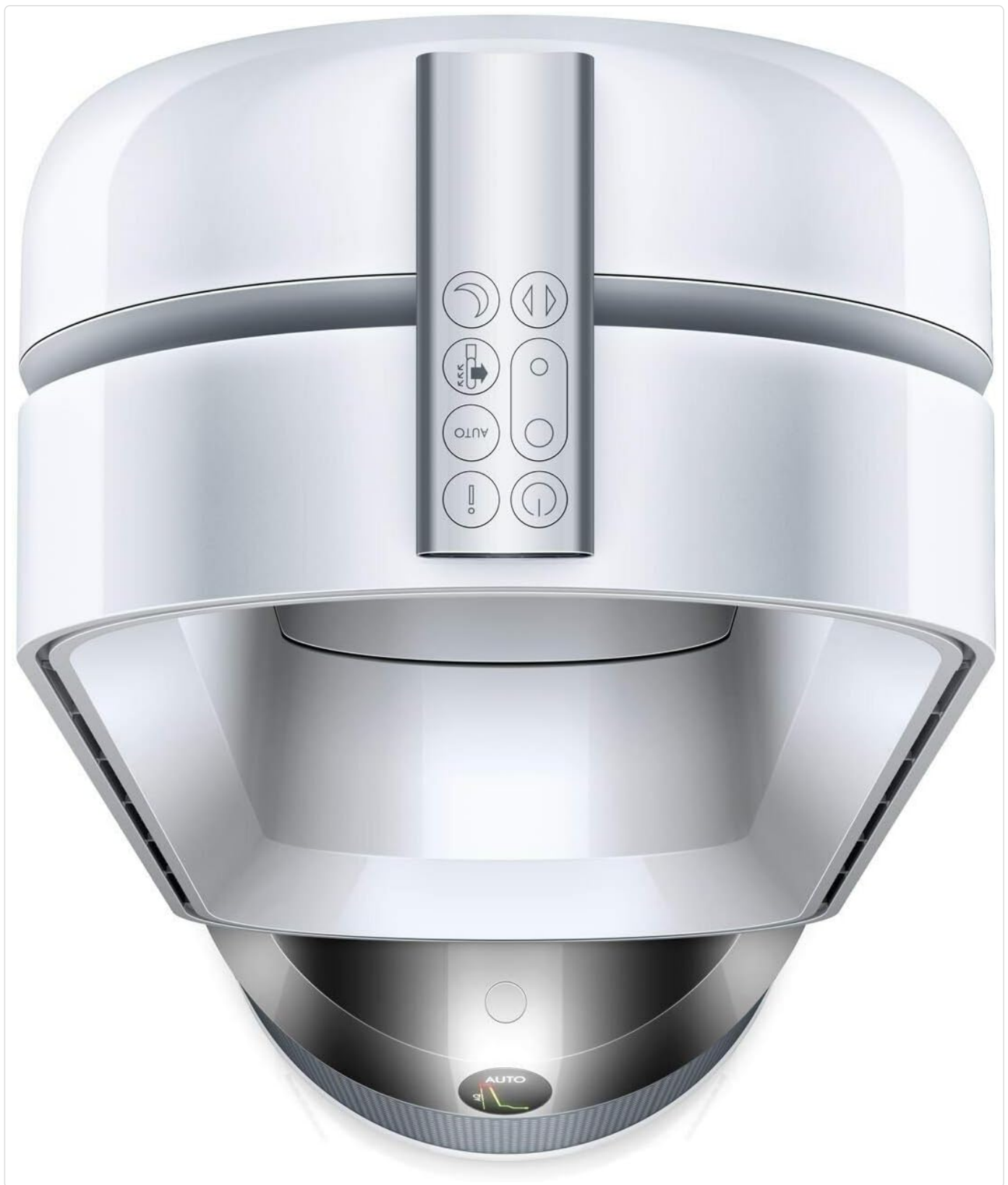
Figure 3: The remote control, designed to store neatly on top of the fan, provides convenient access to all functions.