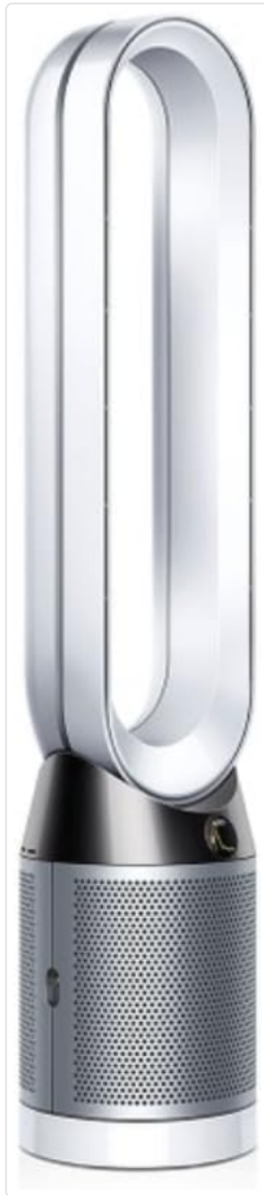
Figure 2: Side view of the Dyson TP04 fan, illustrating its slim profile for easy placement.