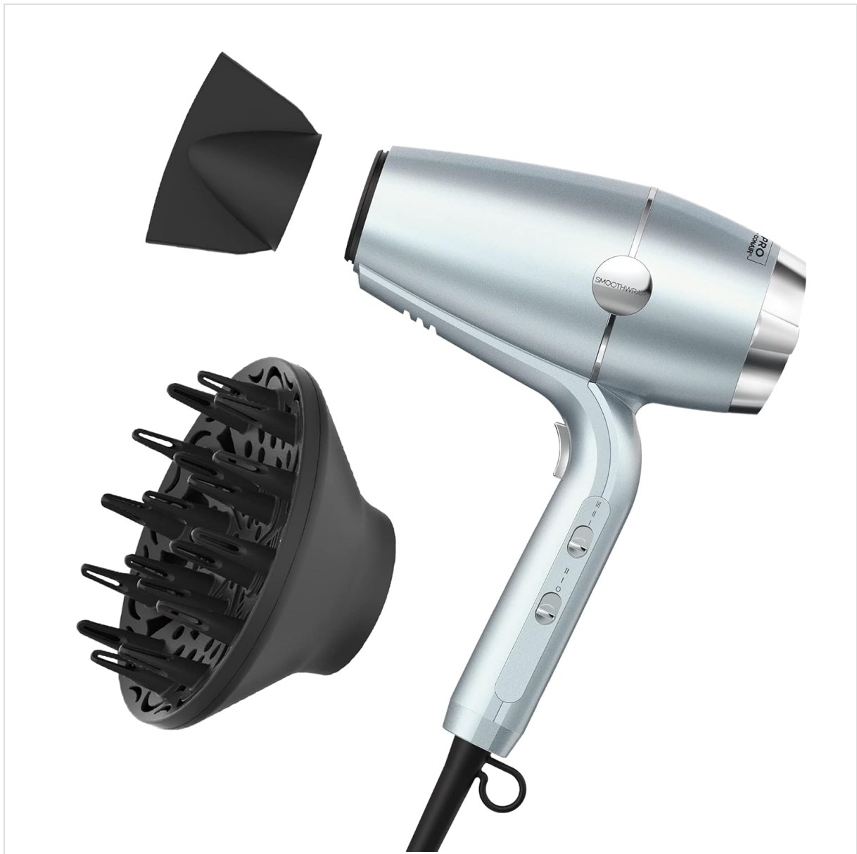
Image: The SmoothWrap Hair Dryer shown with its concentrator and diffuser attachments.

The INFINITIPRO BY CONAIR SmoothWrap Hair Dryer is designed to provide an efficient and conditioning hair drying experience. It incorporates advanced technologies to help reduce frizz and enhance hair's natural body and shine.