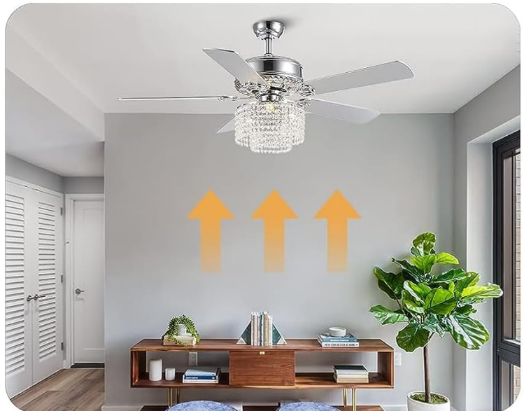
Figure 4: Visual representation of the reversible function. Downdraft mode delivers a downward cool breeze for hot days, while updraft mode promotes indoor warm air circulation during cold days.

It can be used with heating to promote indoor warm air circulation during cold days.