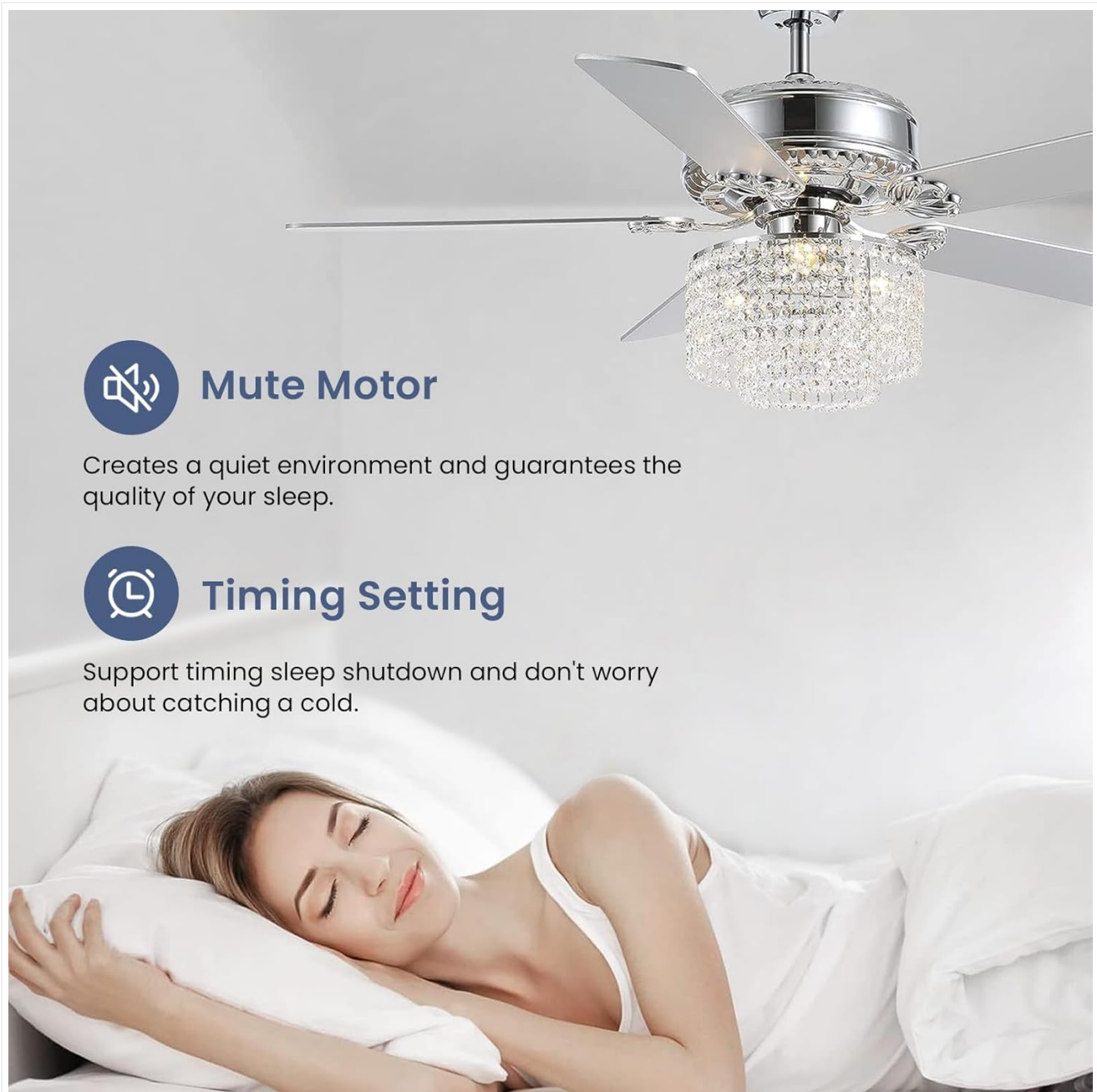
Figure 2: Illustration of the fan's quiet operation due to its mute motor and the convenience of the timing setting for automatic shutdown.