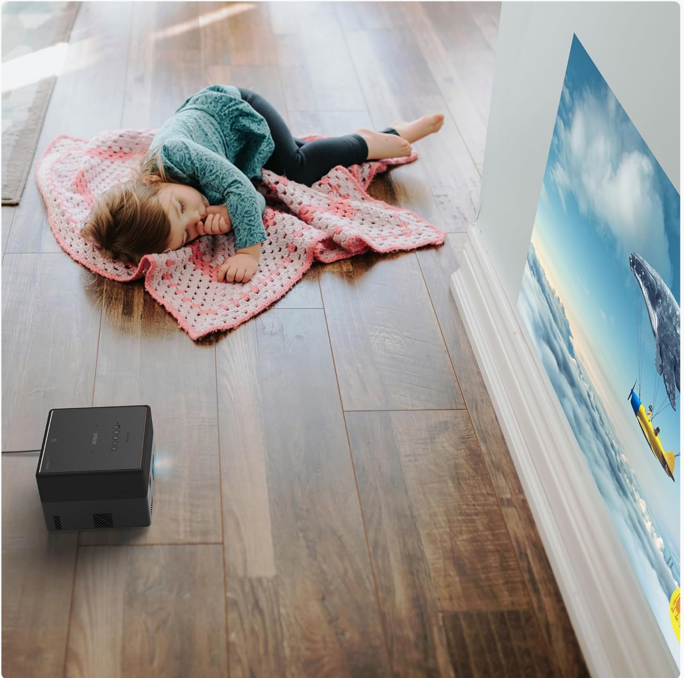
Image: Top view of the Epson EpiqVision Mini EF12 projector, showing the integrated control buttons for power, source, Bluetooth, and volume.

The projector features a custom-designed audiophile speaker system by Yamaha, delivering powerful and clear sound. You can also connect external audio systems via Bluetooth or the 3.5mm jack for an enhanced experience.