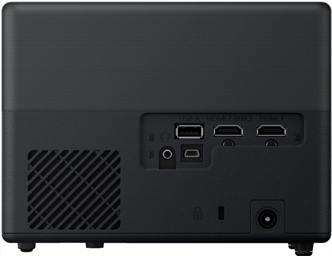
Image: Rear view of the Epson EpiqVision Mini EF12 projector, detailing the HDMI, USB, and audio ports.